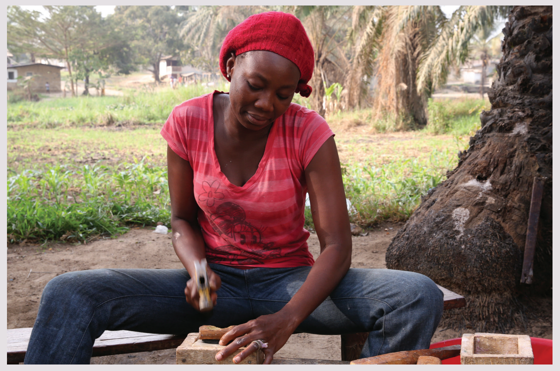
A woman in Ganta, Nimba County, stamps her product logo on handmade soap.