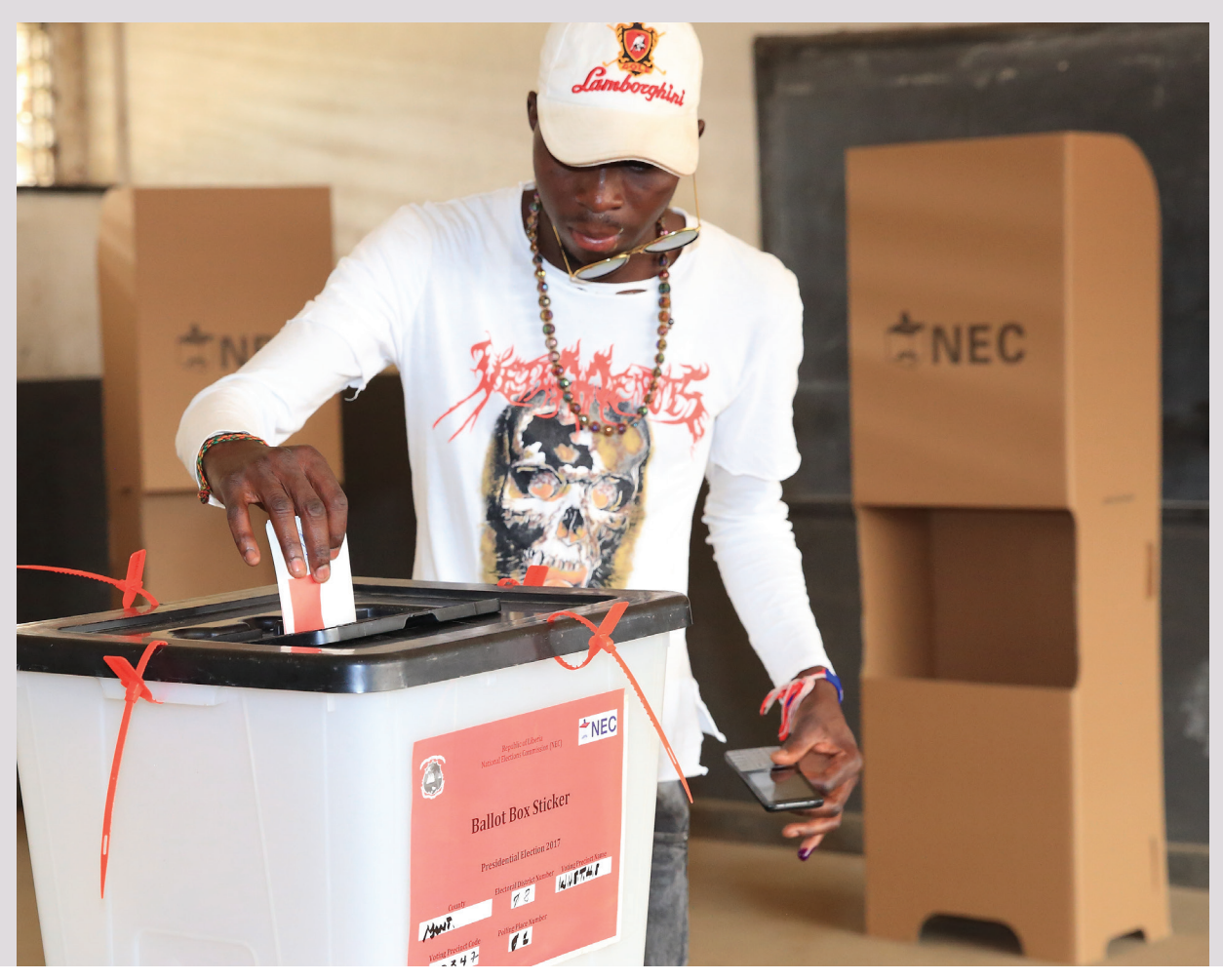
A man casts his ballot in the 2017 run-off presidential election in Monrovia.

In Liberia, UNDP will build on its previous work in elections by helping the National Elections Commission train its staff on enterprise resource and planning systems, installed by UNDP in 2017, while also rolling out an asset management system that will keep track of all goods in its national network of warehouses. This will lessen the incidences of lost assets like computers and vehicles, limiting corruption and waste. Other activities outlined in the UNDP work plan for 2018 focus on the post-election period and includes support for the policy and regulatory environment and reform. This includes support to linkages to the newly established national identification scheme as well as meetings of political parties promoting conflict resolution. A set of tools will be designed to integrate into the school curriculum in cooperation with the Ministry of Education and election observer recommendations once published will be compiled and act as the foundation for a set of reform minded initiatives to promote improvements in the electoral system and administration.