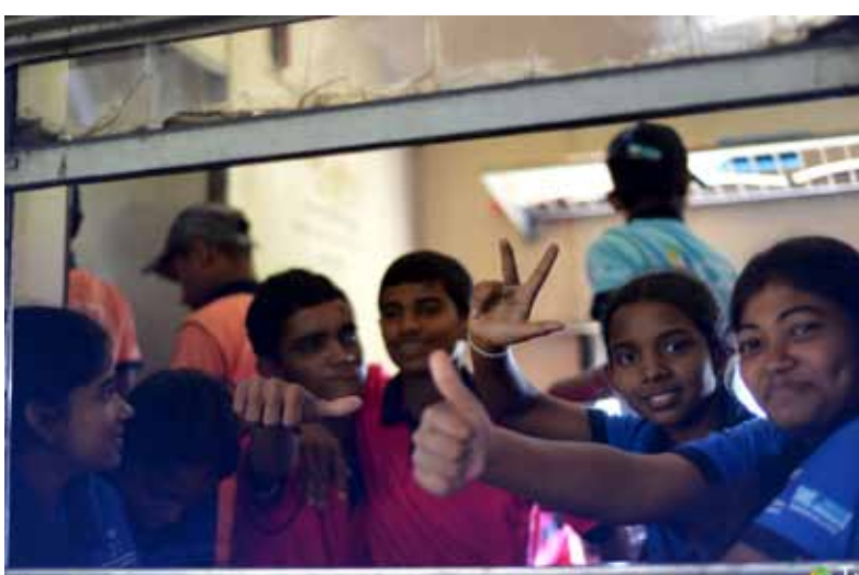
Students on board the Peace Train, from Badulla to Kandy