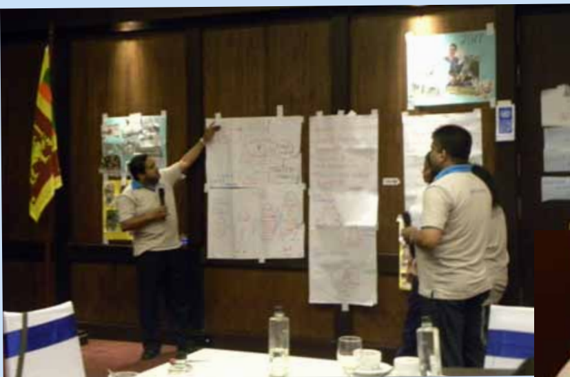
Participants, analyze and present creatively, the expected results and outcomes under each thematic area, the role of each unit in contributing towards achieving these outcomes and the key deliverables for 2013-2014