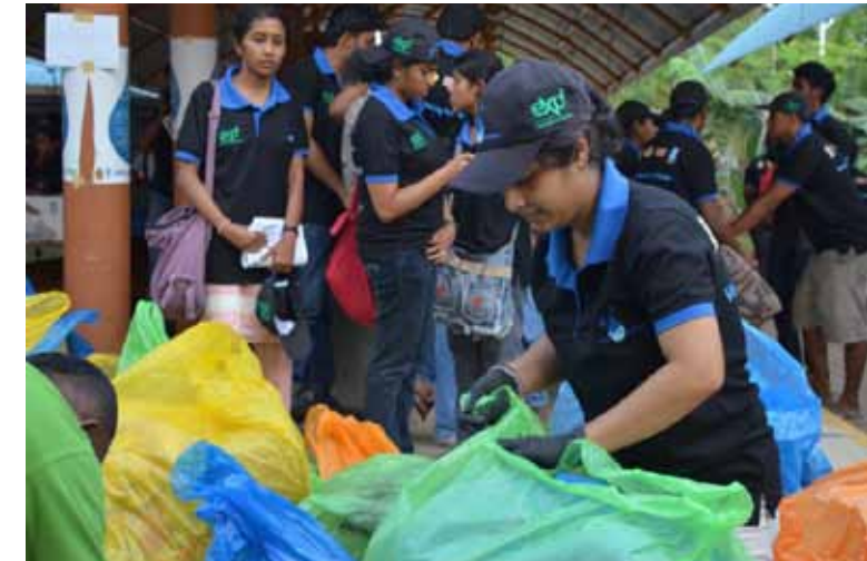
Volunteers at the event

The day's events included a workshop for the corporate sector on improving understanding of water quantity and quality issues, laying the foundation for a bio gas facility to process solid waste, wastewater and toilet waste that otherwise harm the quality of water, an awareness and advocacy campaign to spread awareness on waste, water and health and the collection of harmful waste accumulated at houses, such as, CFL bulbs, plastic, e-waste and unused med-