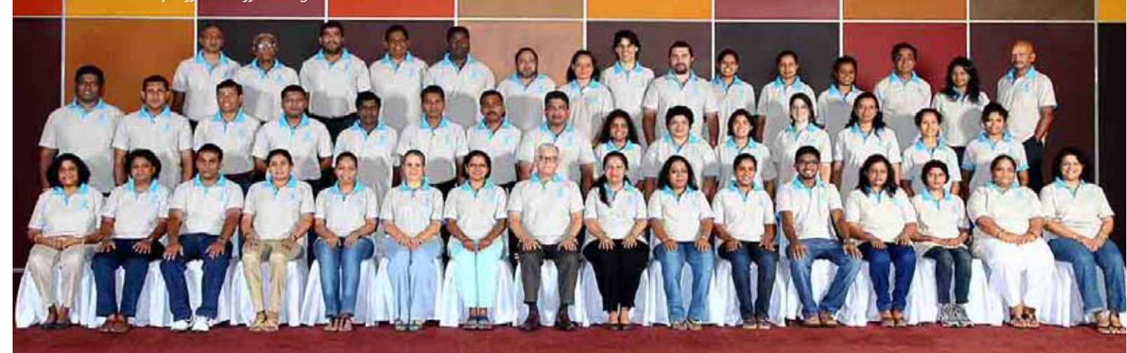
All UNDP Country Office staff during the retreat