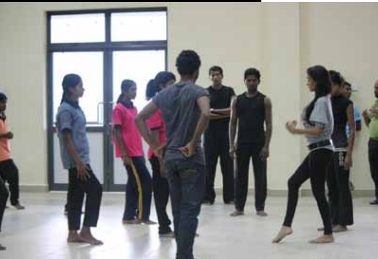
Students train with well-known dancer Prashadi Ranasinghe