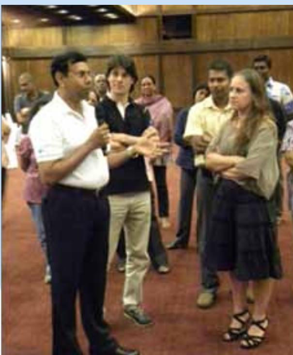
Reflecting on and discussing the lessons learnt in the past year