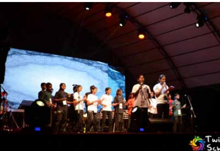
Students perform during the cultural night