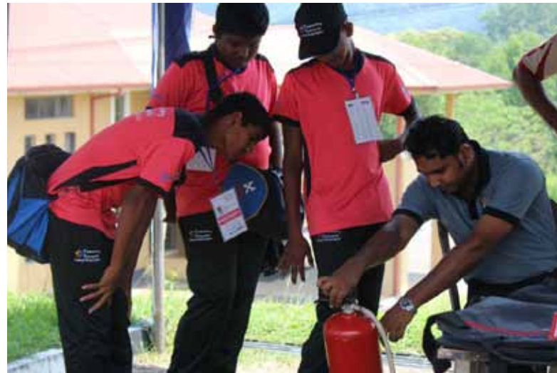
Exploring career options