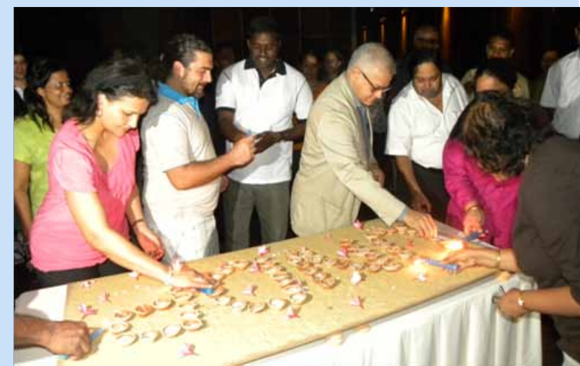
All UNDP Staff lighting the traditional oil lamp

A variety of games and activities the participants actively participated in, enhanced positive group dynamics, encouraged participants to identify common ground with other staff members, and strengthened team spirit.