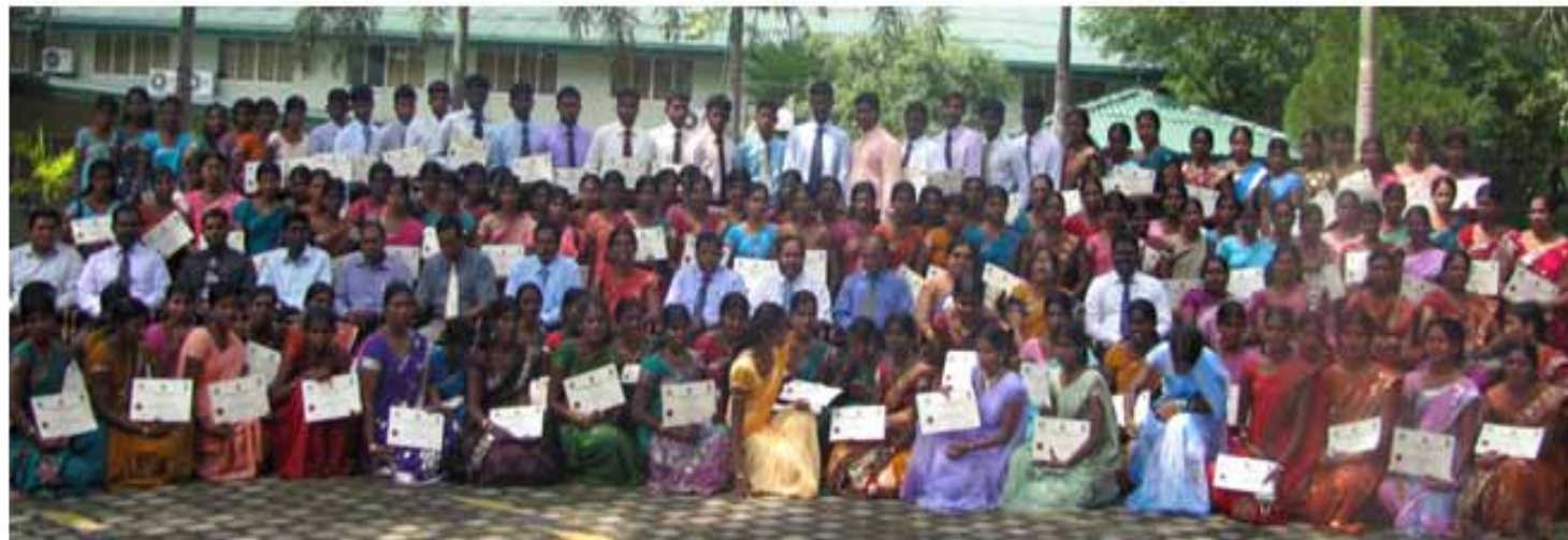
The participants pose with officials from the University of Jaffna, UNDP, and the government

The 2nd phase of the Course for Community Catalysts in Kilinochchi and Mullaitivu districts, a flagship programme promoting youth leadership development carried out through the Local Governance Programme, drew to a conclusion with the awarding of certificates to the 124 participants.