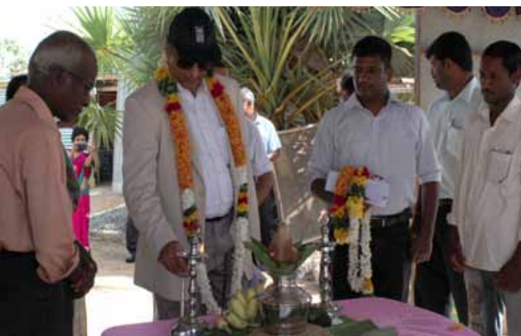
During the visit to the livelihood development project site in Jaffna

For more information on the visit, watch: http://www.youtube.com/watch?v=SEXsPdL-5M&feature=youtu.be