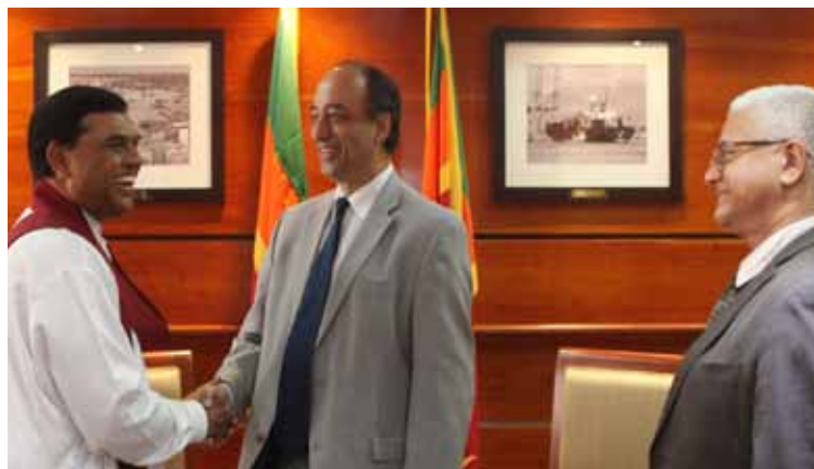
Meeting with Hon. Minister Basil Rajapaksa

A highlight of the visit was the launch of the Sri Lanka Human Development Report 2012, on 5 October 2012, titled, 'Bridging Regional Disparities for Human Development'. With UNDP in Sri Lanka gradually shifting focus to look at issues of regional disparities and socio-economic inequalities across the country and promoting multi-stakeholder approaches to policy advocacy and reform, this Report comes at a significant juncture, explained Mr. Chhibber.