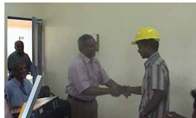
A visit to a project site