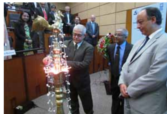
At the launch of the Sri Lanka Human Development Report 2012