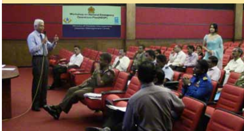
Rehearsal on the Standard Operating Procedures (SOPs) related to NEOP held on November 5 and 6, 2012

Lightning & Thunderstorms Manmade disasters Maritime hazards Nuclear disasters Oil spills Radiological emergencies Tsunami