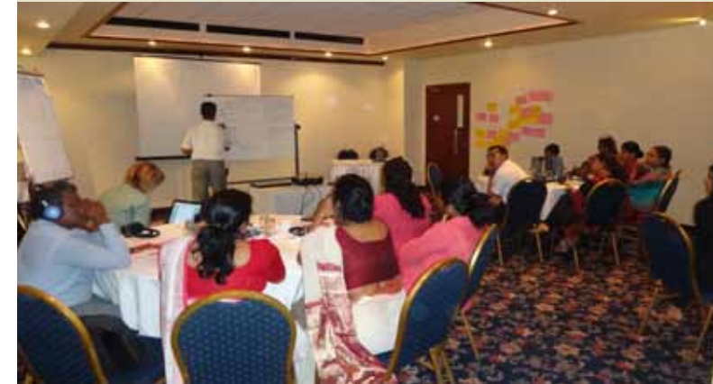
Participants during the consultation

The objective of the day was to look at how the partners could collaborate to promote 1325 in Sri Lanka. After learning about experiences from other N-PEACE countries, participants had the chance to discuss the opportunities and challenges linked to promotion of 1325 in Sri Lanka. The discussion was framed around the four pillars of the resolution – Participation, Prevention, Protection and Relief & Recovery – and noted that while challenges exist at all levels, there is also a lot of work already taking place led by Government, NGOs/CBOs and the UN. Indeed, a key challenge is ensuring effective coordination among the many actors.