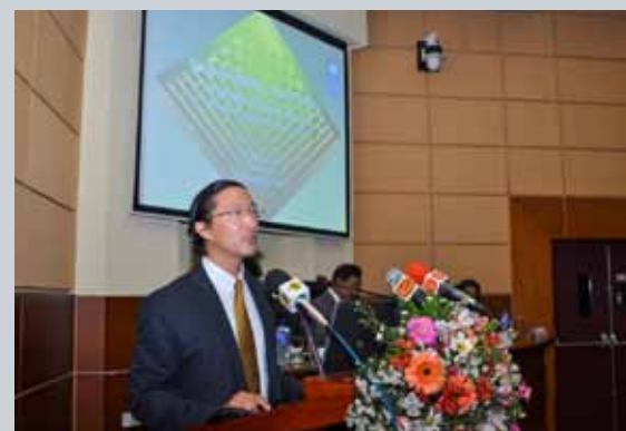
Speaking during the launch of the 2011 Human Development Report