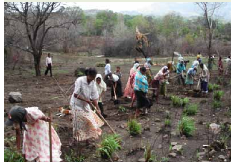
During a community replanting programme