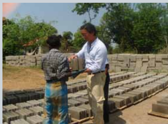
During a field visit