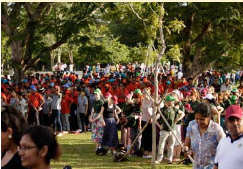
During the event

The highlight of the evening was the human mosaic that was formed in the shape of the world map. It was the largest human mosaic formed in Sri Lanka. In addition the lighting of the human mosaic signified the positive contribution that these youth had pledged to make to their community. Furthermore it reflected the global theme of “Light up the World”.