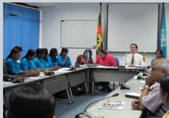
During a meeting with participants of the Women's Leadership Development Project held in Colombo