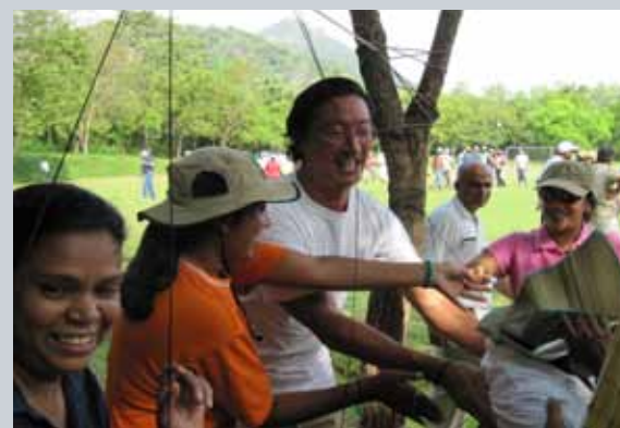
Participating at one of the many activities during the bi-annual UNDP retreat