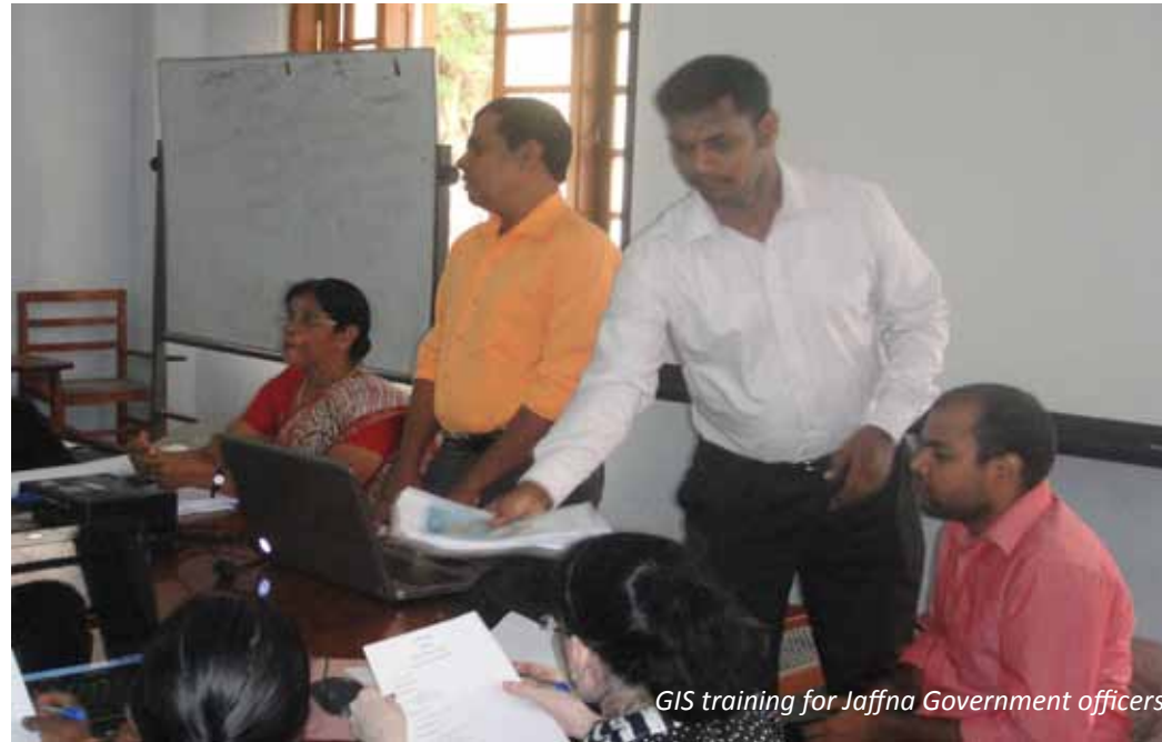
GIS training for Jaffna Government officers