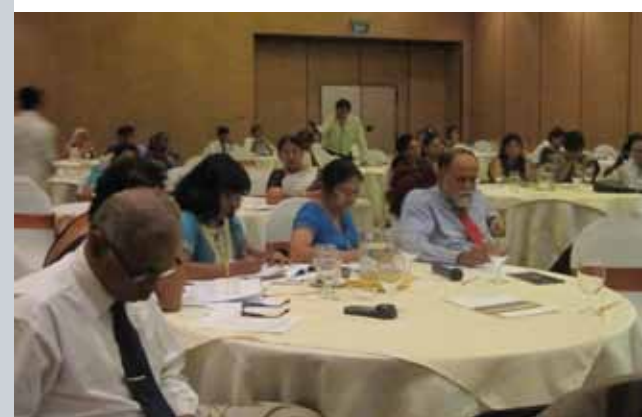
Members of the Evaluation Committee