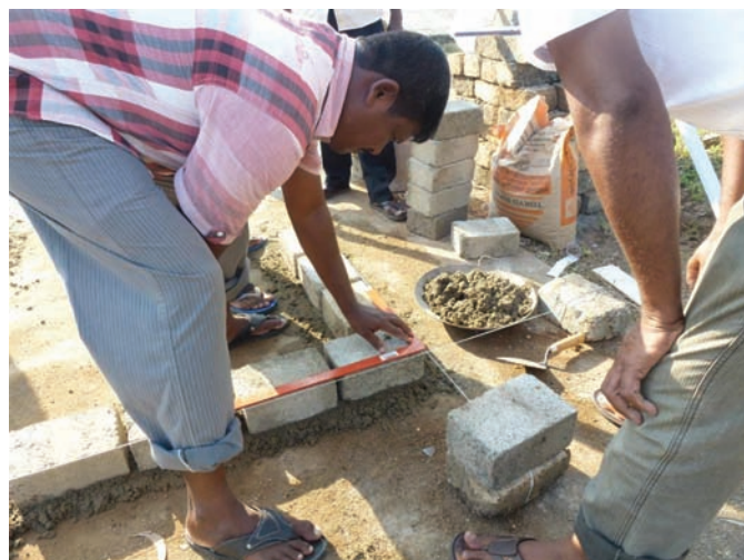
Increasing the resilience of communities against natural disasters by supporting them to build disaster-resilient infrastructure

In partnership with the UN Environment Programme, UNDP supported over 30 government agencies involved with development, conservation and planning to conduct an Integrated Strategic Environmental Assessment (ISEA) for the conflict-affected Northern Province. The ISEA established environmental baselines, mapped important archaeological areas and wildlife corridors and environmentally less-sensitive lands suitable for development. The Government used the ISEA to improve its physical investment plan for 2030, and to revise the urban and other development plans for the North. ISEAs were also carried out in the Uva and Gampaha Districts.