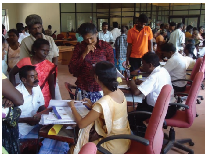
Empowering communities by strengthening access to justice and services

The United Nations Development Programme (UNDP) is the development arm of the United Nations. UNDP partners with people at all levels of society to help build nations that can withstand crisis, and drive and sustain the kind of growth that improves the quality of life for everyone. On the ground in 177 countries and territories, UNDP's focus is on helping countries build and share solutions to the challenges of poverty reduction and the Millennium Development Goals (MDGs), democratic governance, crisis prevention and recovery, and environment, energy and sustainable development.