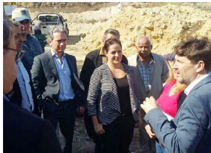
November 3, Tyre