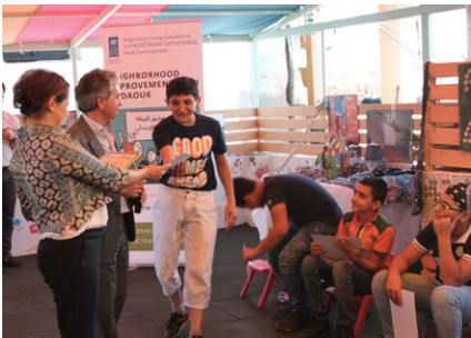
October 5, Daouk