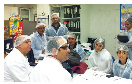
Ministry of Economy and Trade: capacity building on food safety inspections

Registering in TOKTEN database as a candidate does not guarantee that the applicant will eventually engage in a mission. The applicant will be contacted only if an appropriate opportunity arises.