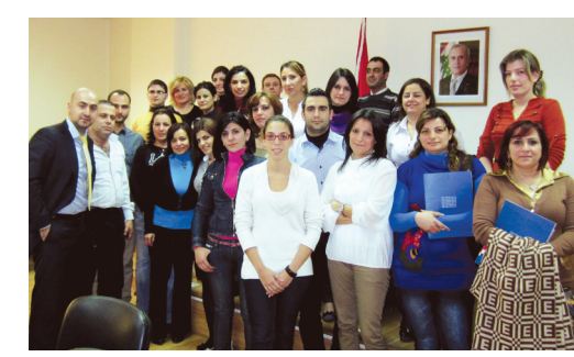
Public hospitals: critical incidence stress manageme (CISM) training

A roster is continuously upgraded with more Lebanese expatriates willing to offer their services. A special effort is made through this project to identify and recruit expatriate professional Lebanese women to serve as TOKTEN volunteers.