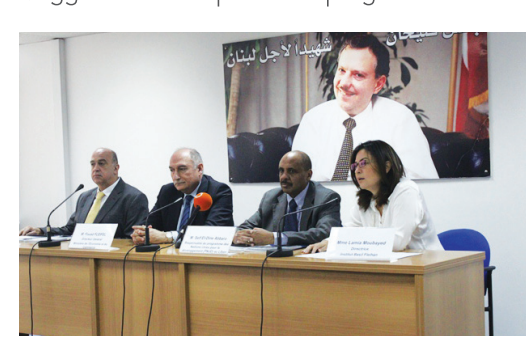
Ministry of Economy and Trade: food safety workshop; opening session at the Institute of Finance