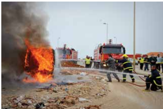
Disaster risk management simulation.

Finally, partners continued to support the institutionalization of municipal police forces in partnership with MoM, through the development of an Internal Security Forces (ISF) academy training manual, Standard Operating Procedures (SOPs) and codes of conduct in crisis response.