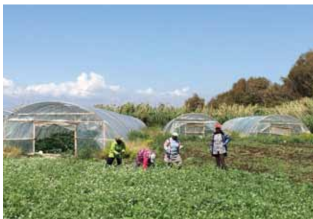
Syrian refugees working on leafy green seeds fields.

As a result, more than 1,600 farmers were provided with training and equipment to increase agriculture and livestock production. In addition, 173 government staff were trained on using the mobile data collection tools necessary to conduct the 2016 agricultural production survey and on the surveillance and monitoring of plant diseases.