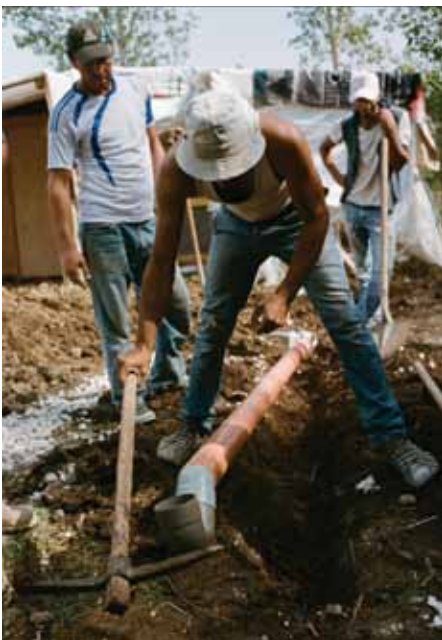
Construction of latrines.

Under the leadership of the Ministry of Social Affairs, 100 new ‘maps of risks and resources’ (MRR) have been conducted , thus ensuring that all municipal priorities are mapped across the 251 most vulnerable localities of Lebanon.