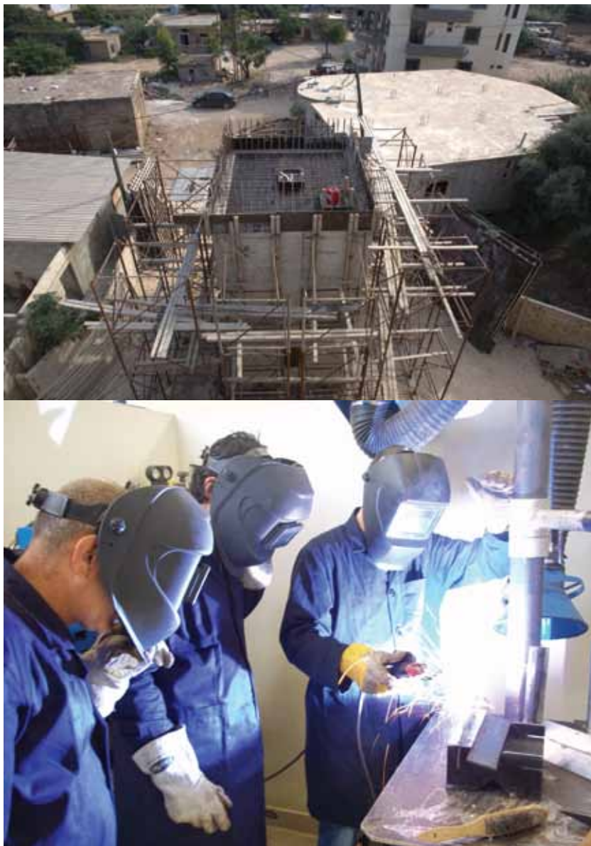
Interventions in the Livelihoods and Shelter sectors under the LCRP 2016.

Please note that throughout this document, large numbers have been rounded to the nearest hundred.