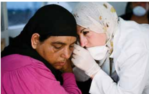
Akkar Charity Medical Center.

Finally, investments have been made to strengthen the support to the National Tuberculosis Program to reduce avoidable tuberculosis-related mortality and illnesses. This was achieved through enhanced prevention, diagnostic and treatment services for vulnerable communities, notably through the rehabilitation and equipment of tuberculosis treatment centers, as well as the recruitment and training of 29 technical staff and the opening of a new center in Halba-Akkar. In addition, sector partners played an active role in the implementation and scaling up of the National Mental Health Programme strategy to integrate mental health into primary healthcare and build the capacities of health professionals in assessing, managing and referring mental health cases in Lebanon.