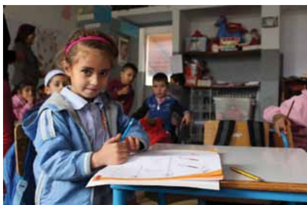
Lebanese and Syrian children in class.

Overall, 32 additional staff were seconded to MEHE to ensure the continued successful implementation of the RACE strategy and development of RACE II.