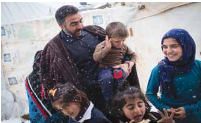
Winter storm in Lebanon.

Since the beginning of the year, 70,000 poor Lebanese households were supported through the provision of winter cash and core relief items (the highest number ever reached) and 28,000 NPTP beneficiaries received monthly food assistance. Overall, no less than 194 additional staff were seconded to social institutions both at the central and local levels to ensure adequate staffing capacity to respond to the crisis.