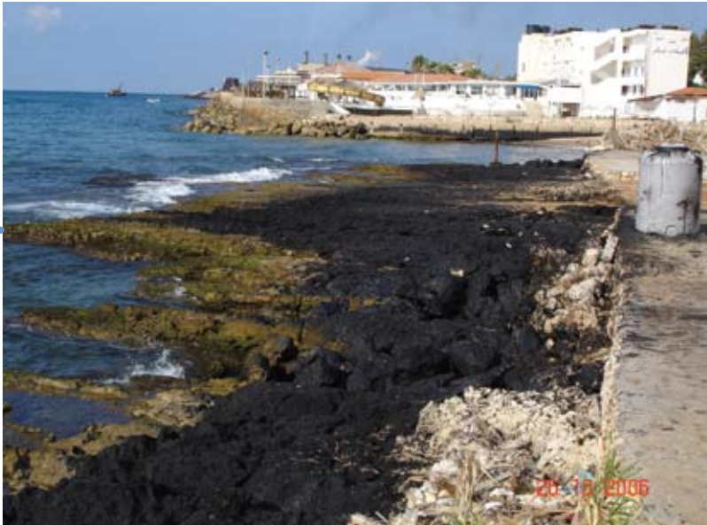
Saint Rock Beach - Jiyeh