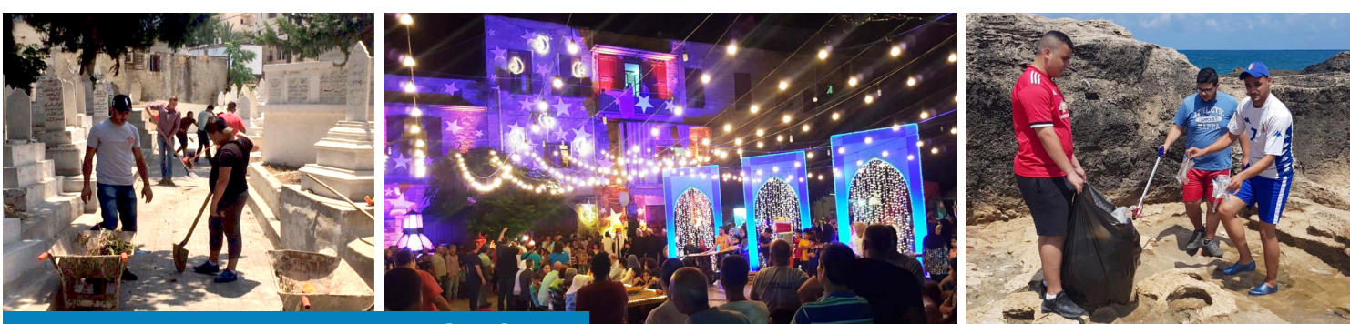
A Different Feel of Ramadan in Old Saida

Building on the success of the first phase of the neighborhood improvement plan in Old Saida, the UNDP project, in partnership with Saida Municipality and partner NGO DPNA, organized a series of public events and volunteering activities during Ramadan, thanks to the support of Germany.