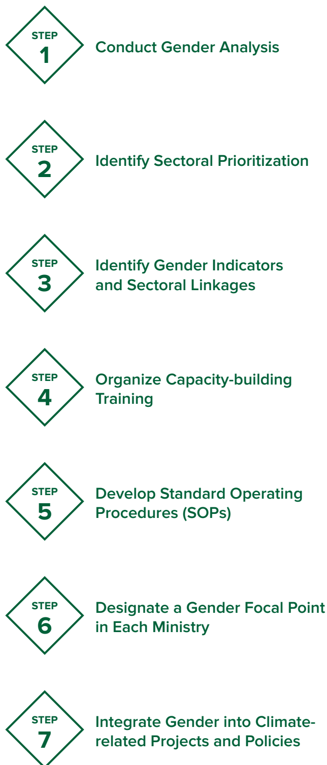
Figure 5: Lebanon's Approach to Mainstreaming Gender-sensitive Climate Action

mainstreaming as outlined in How to put Gender-responsive Climate Solutions into Action: Lebanon's Approach . It has developed a 7-step process to provide the framework for the integration of gender-sensitive climate action at the sectoral level as shown in Figure 5 below.