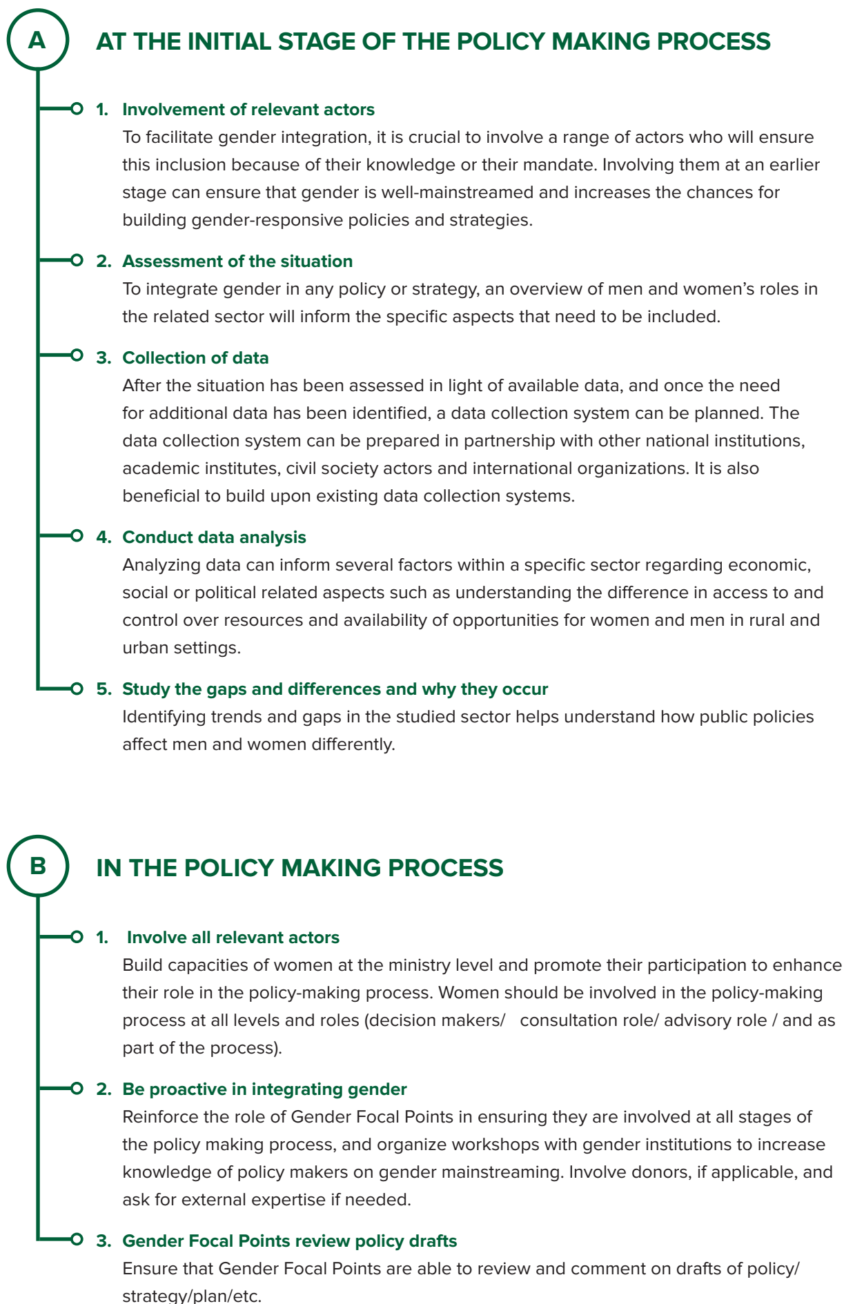
Figure 7: Steps from SOPs to integrate gender into climate relate policies and strategies