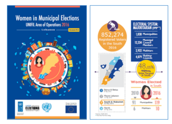
Women in Municipal Elections-UNIFIL AO 2016- issue no.2, produced and published by LEAP