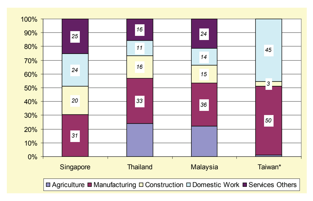
Figure 3: Foreign Workers by Sector of Employment in Singapore, Thailand, Malaysia and Taiwan

Foreign workers are heavily concentrated in the sectors affected by the current financial crisis. Figure 3, using data compiled by Mangahas (2009), shows the composition of foreign workers by sector in four receiving countries. At least half of the official foreign workforce is concentrated in the manufacturing and construction sectors. The degree to which the informal economy can absorb workers retrenched from these sectors is not yet known, although this is seen to be an important safety net for these workers. Migrant workers in the Gulf States, which include a large concentration of South Asian migrants as well as workers from the Philippines, Vietnam and Indonesia, are also expected to significantly decrease, particularly those working in the construction industry.<sup>33</sup> The domestic sector, which employs many women in the Gulf countries, is not expected to lose large numbers of workers in the current crisis. However the agricultural sector, which employs large numbers of foreign workers in Malaysia and Thailand, is expected to lose large numbers of jobs.<sup>34</sup>