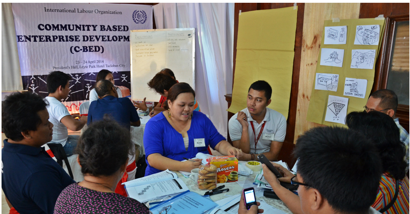
Small-scale business owners, vendors and aspiring entrepreneurs learn the basic principles of business development through the Community-Based Enterprise Development after typhoon Haiyan or Yolanda hit Philippines in 2011.

The active participation of key economic and labour market stakeholders in the recovery-planning process is essential for developing a well-targeted and inclusive ELSP recovery framework. Besides involving national and local government functionaries and public and non-governmental institutions, efforts should be made to facilitate the participation of representatives of the affected population as well as other civil society organizations that may be active at the local level. These stakeholders should be consulted in planning the recovery, identifying and prioritizing interventions, area-specific programme preparation, and thereafter kept in the loop throughout the implementation stages in disaster-affected zones. Adopting such broad-based, consultative approaches enhances information exchange, permits negotiation and advocacy, leading to inclusive decision-making.