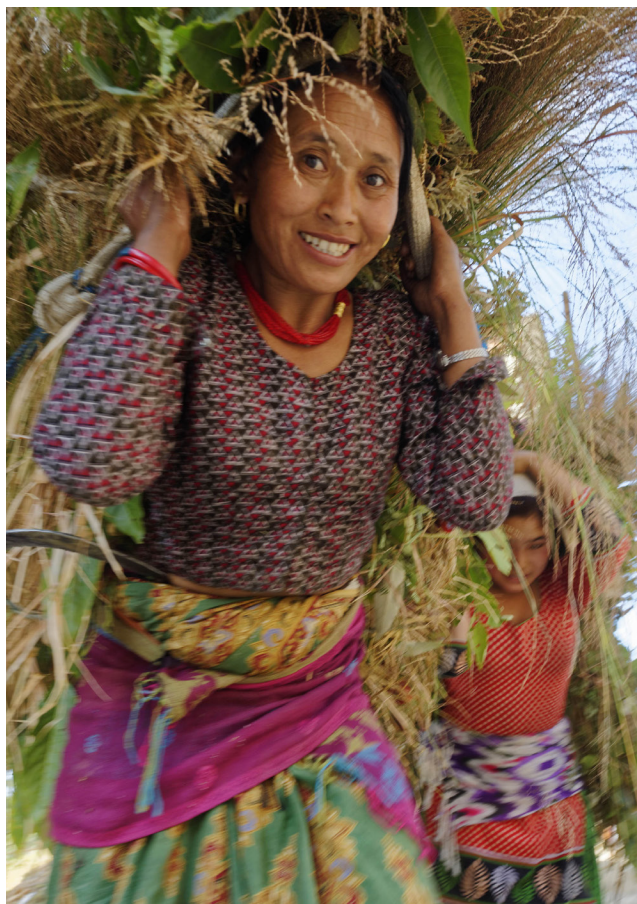
Women farm workers in a post-disaster area (Nepal earthquake, 2016).

the PDNA Guidelines (Volume B) 3 for the estimated effects and impacts of a disaster on the cross-cutting ELSP sector, factoring in the assessed damage and loss to infrastructure, productive and social sectors. This short, action-oriented Guide aims to assist senior advisers and officials from the national, provincial and local governments, intergovernmental organizations