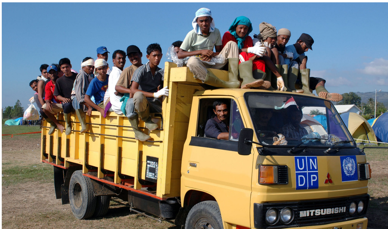
Disaster recovery-linked emergency employment such as garbage collection at refugee camps bring much needed succor to affected populations that have lost livelihoods (Banda Aceh, Indonesia tsunami, 2004).

approach enables recovery and building resilience through job creation and promotion of decent work. 14 The ILO recognizes decent work as the foundation of sustainable poverty reduction that paves the