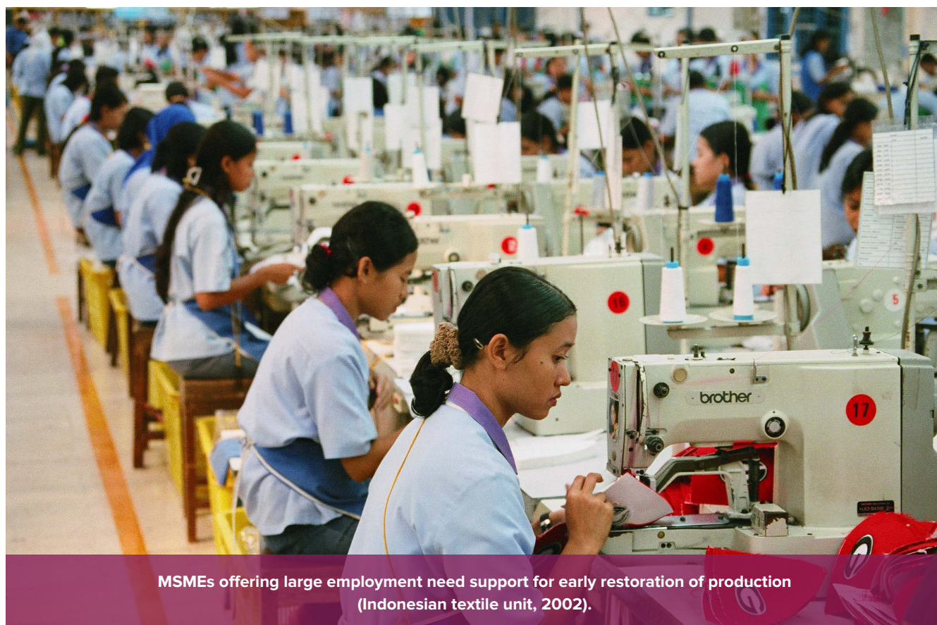
MSMEs offering large employment need support for early restoration of production (Indonesian textile unit, 2002).