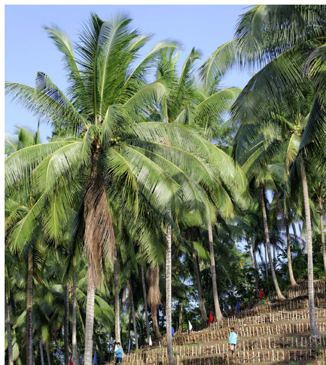
Sloping agricultural land technology (SALT), aimed at increasing productivity and prevent floods or damage to crops, was deployed to rebuild farming communities in keeping with an ecosystem perspective (after tropical storm Washi hit Philippines in 2011)