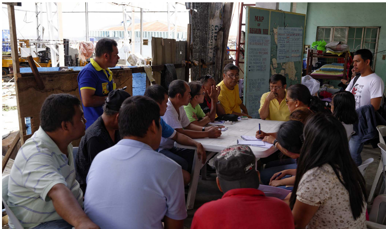
ILO officials discuss emergency employment needs with officials of the DOLE in Tacloban after super typhoon Haiyan hit Philippines in 2013.

of enforcement of the labour law may allow those who profit from disaster to act with impunity, especially in such matters as forced labour, child labour, trafficking of children or workers, and exposure to hazardous working conditions. This may have long-term effects on the observation of International Labour Standards in the country. 54