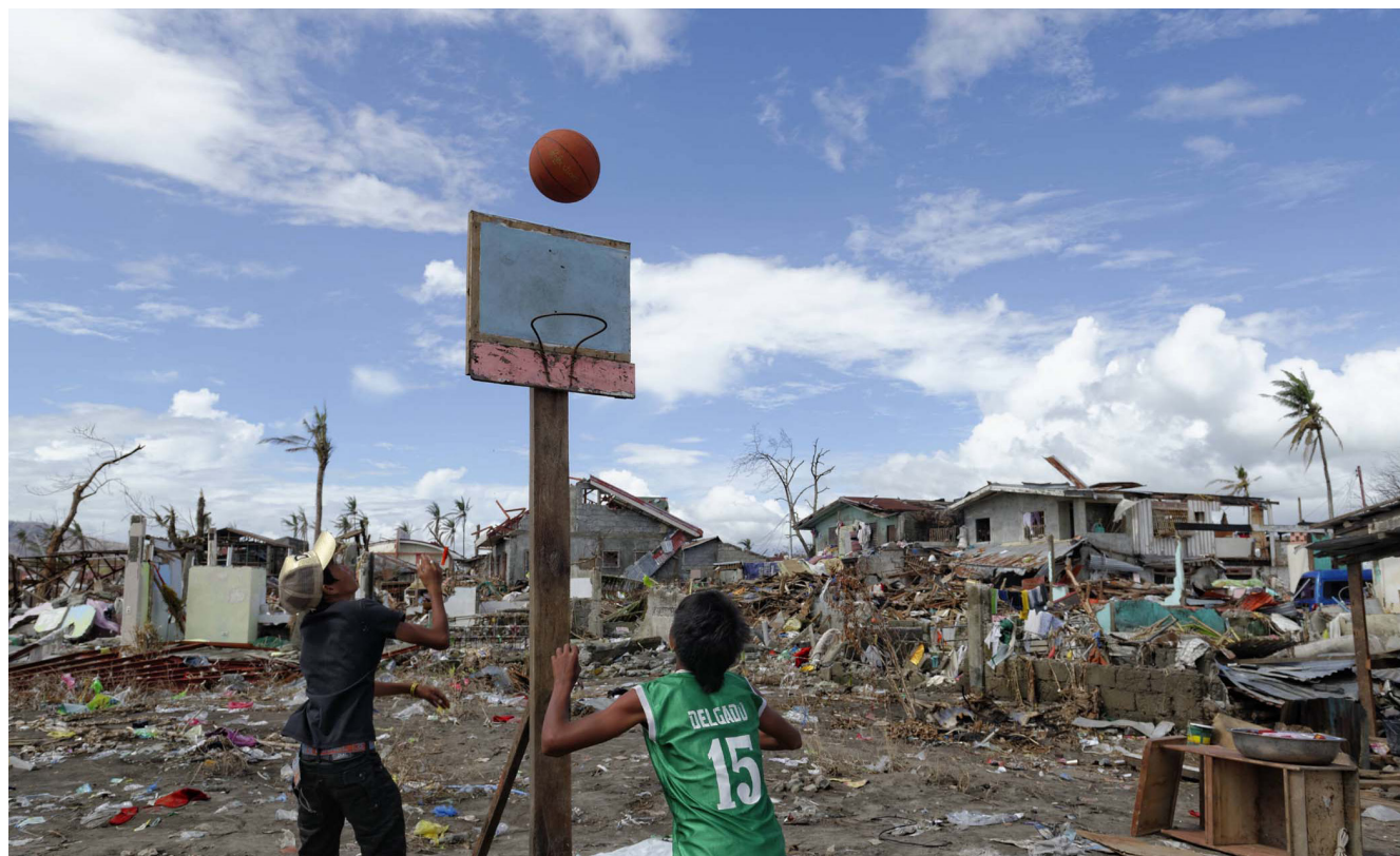
Above all, hope and fortitude in full display at Tacloban city (after typhoon Haiyan hit Philippines in 2013).