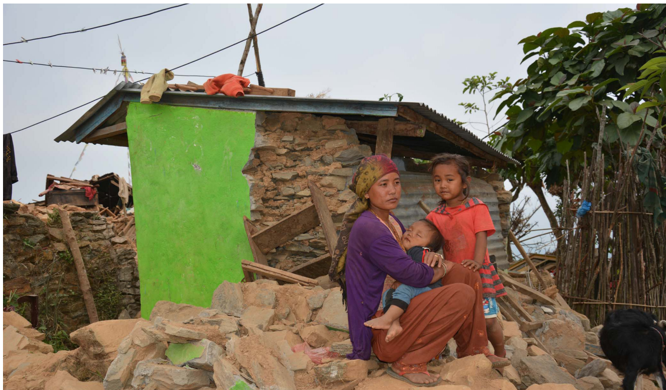
Women and children along with persons with disabilities are some of the most vulnerable during disasters (Nepal earthquake, 2016).

higher risk of catastrophes, the poor are evidently more vulnerable than the non-poor with higher losses to incomes, assets and lives. Sustained low incomes, lack of savings, weaker social networks, low asset bases and heavy reliance on climate-sensitive livelihoods renders all these groups with limited capacity to cope with natural disasters.