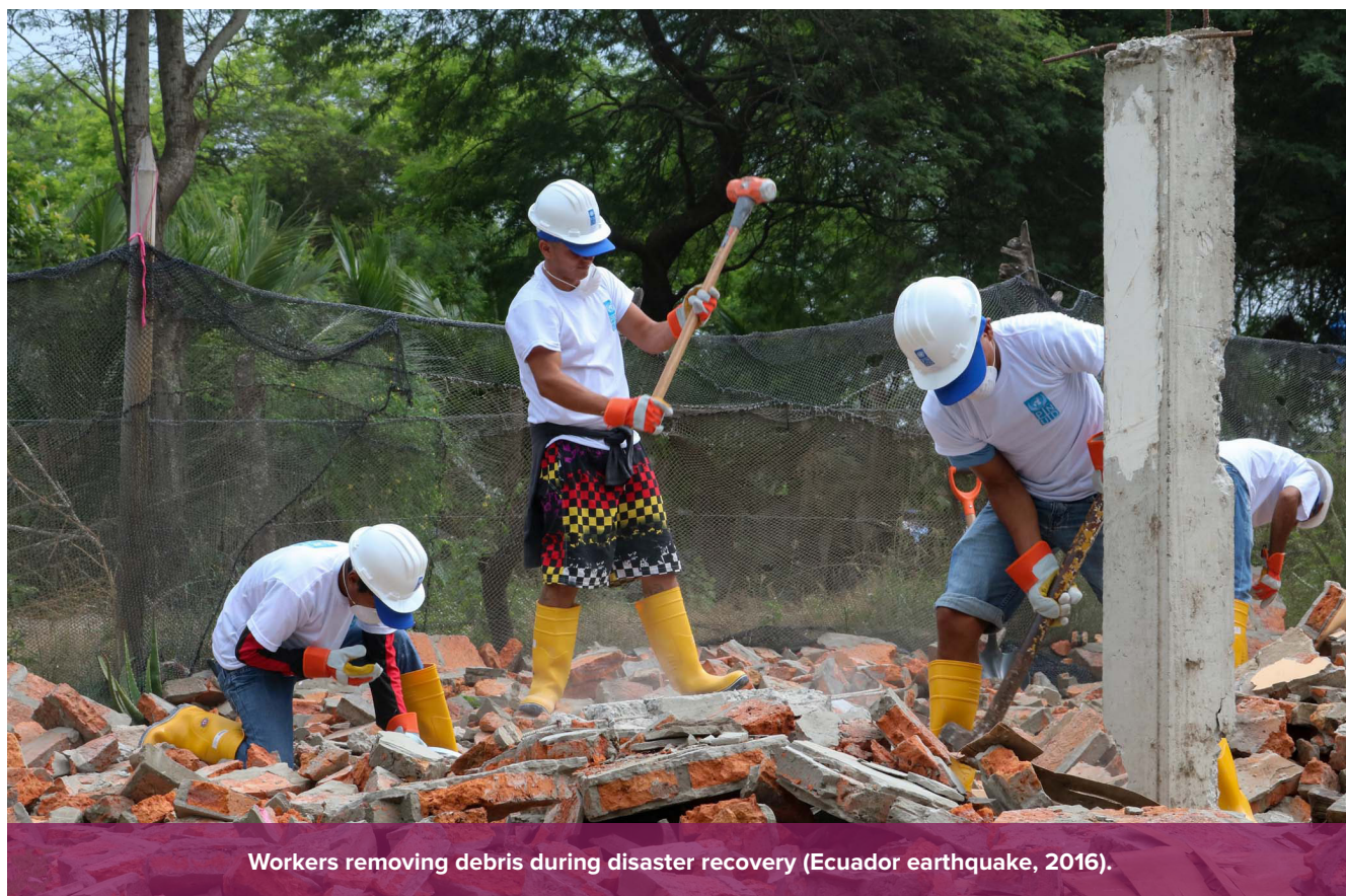
Workers removing debris during disaster recovery (Ecuador earthquake, 2016).

When Climate Change Adaptation (CCA) is part of disaster relief, in addition to providing immediate income and employment for the affected communities, it also improves their access to future employment opportunities and livelihoods and creates infrastructure solutions and assets that strengthen resilience to future shocks. 24 Key areas of CCA through Green Works include: 25