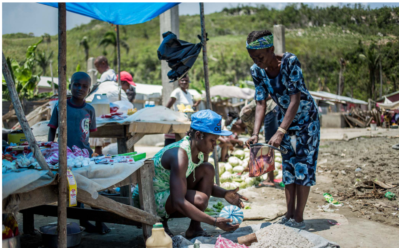
Women selling and buying essential items at a post-disaster makeshift shop (Haiti earthquake, 2010).