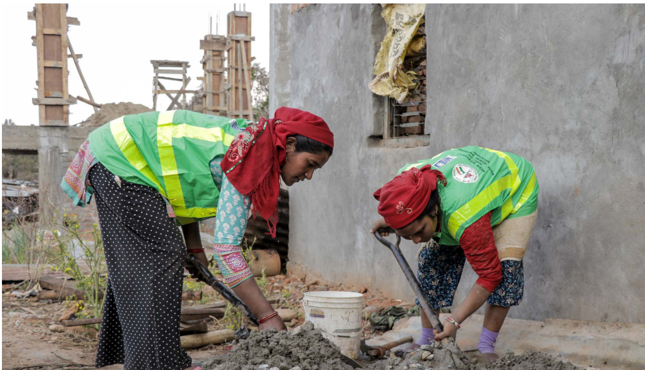
Reconstruction by women beneficiaries for the housing sector under Nepal India Cooperation, anchored by UNDP in 2019, adopting build back better practices (earthquake-resistant).