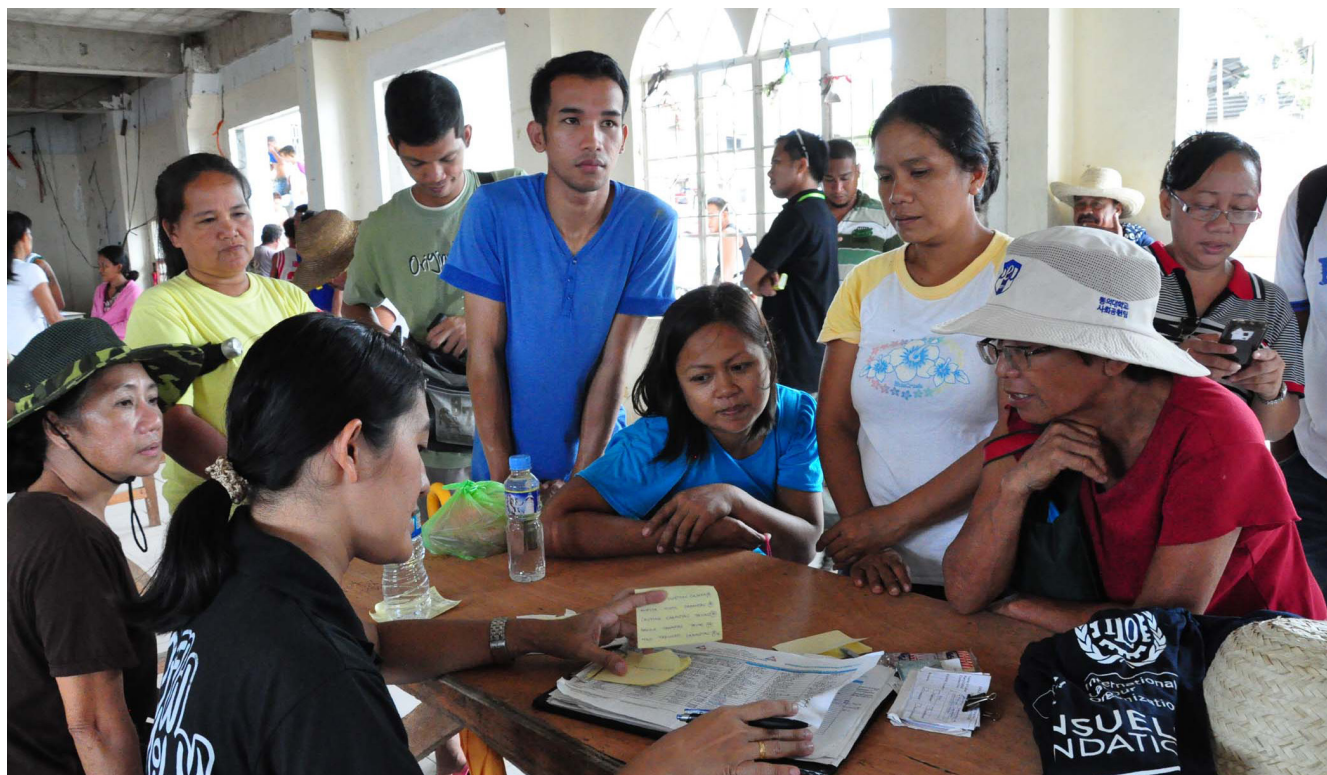
The Philippine government, with ILO's support, rolled out emergency employment programmes in areas most affected by Typhoon Haiyan, including Tacloban.

umbrella, almost 80,000 informal sector workers subscribed to the national insurance schemes while benefitting from immediate relief from the aftermath of Haiyan.