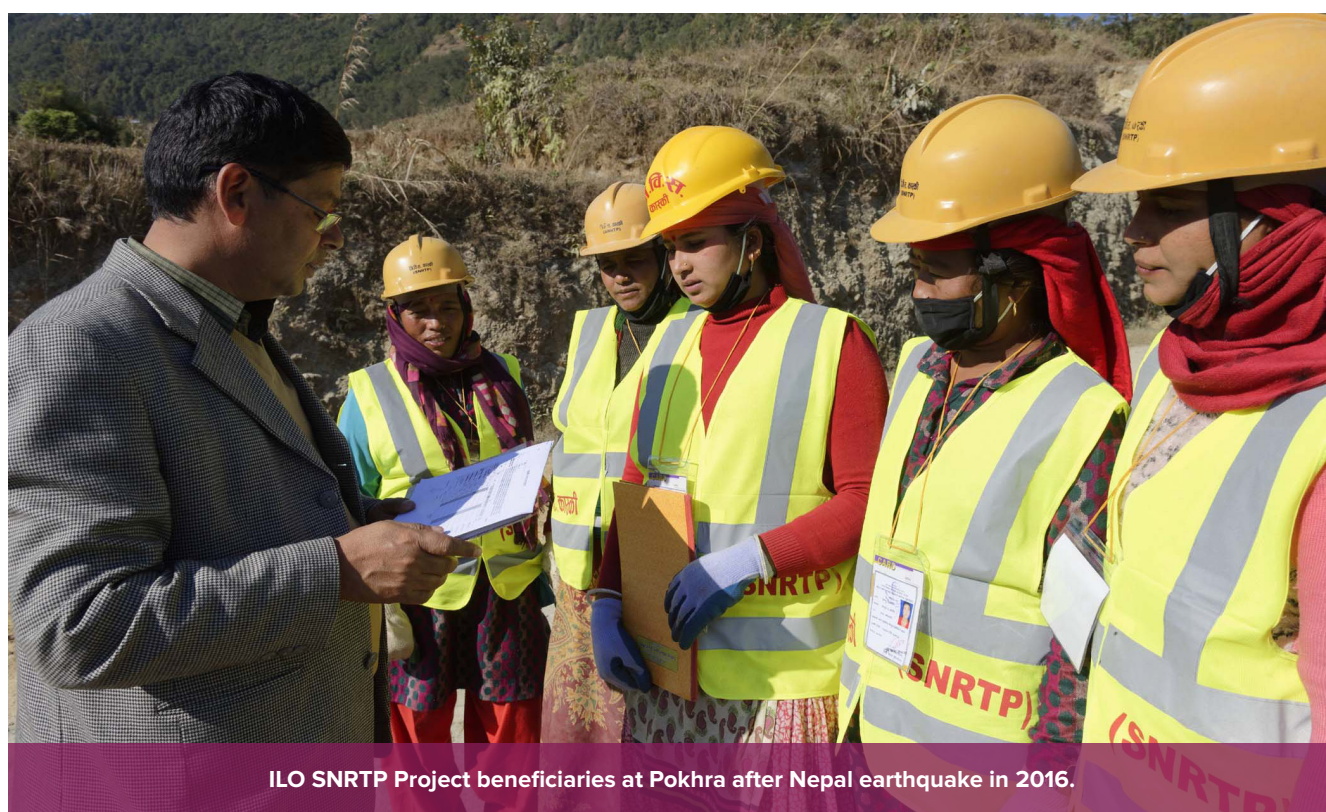
ILO SNRTP Project beneficiaries at Pokhara after Nepal earthquake in 2016.

It is expected that the disaster-affected areas would see a higher level of reconstruction activities in the short- to medium-term. While the infrastructure build-back would be driven mainly through public spending, private expenditure on reconstruction is also expected to go up. Reconstruction activities would require a workforce with multiple skills, and most of such works would be contracted out. Construction enterprises from other regions of the country or even internationally could also seek these contracts and send their workforce for reconstruction projects. As and when construction activity momentum picks up, key issues may be expected to emerge around