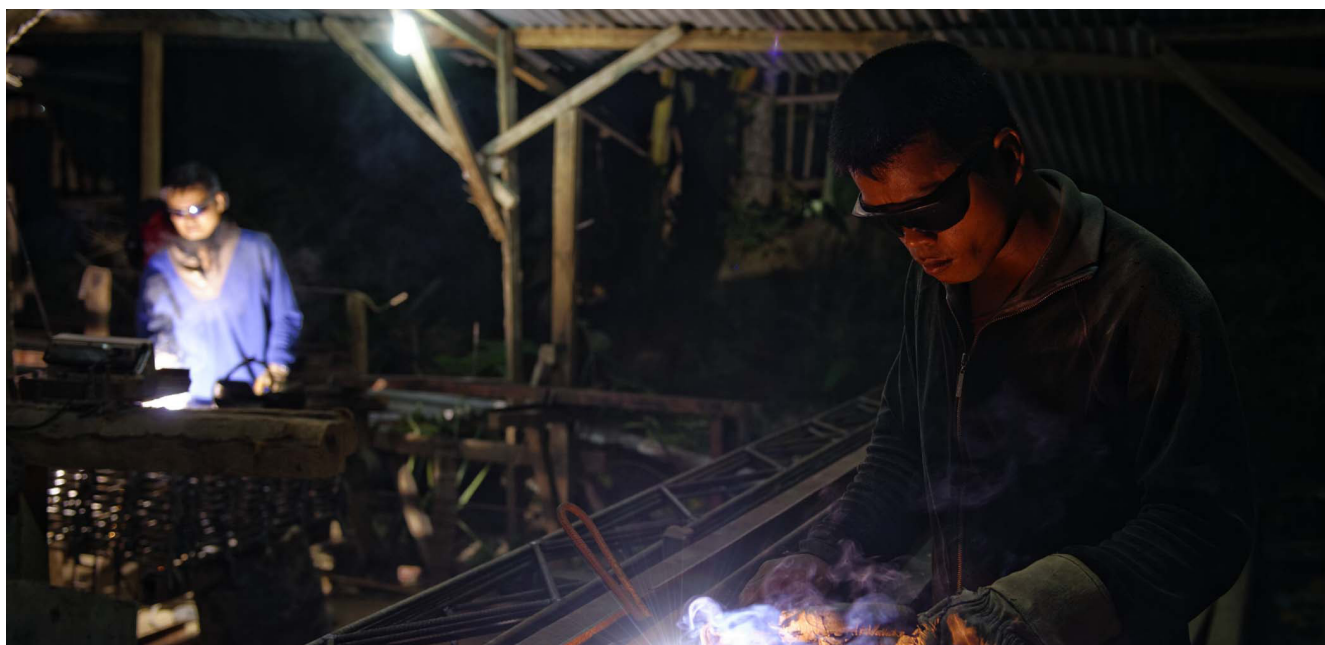
Emergency employment-linked integration of MSMEs and skilling (after tropical storm Washi or Sendong hit Philippines in 2011).

Thus, it becomes imperative for governments to immediately begin providing small capital grants or opening a window for MSMEs to avail collateral-free credit on easier terms for refurbishment or replacement of machinery, either of the same technology or of more advanced technology (for example, green) and associated equipment. Many countries set up public-funded industrial areas, parks and special economic zones to host and support MSMEs of different types including cooperative enterprises. In such cases, increasing the resilience of industrial estate infrastructure also becomes important to help MSMEs recover faster and strengthen their own resilience.