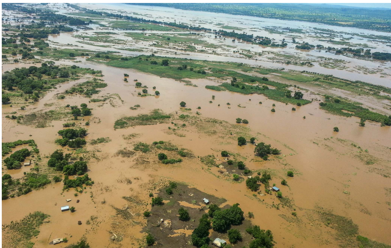
Damage to entire habitat (Malawi floods, 2015).

A disaster also diminishes the capacities of local governments, local offices of central government agencies, chambers of commerce, employers' and workers' organizations, civil society organizations, small and medium