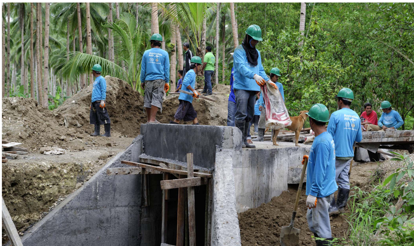
People being provided on-job training while constructing a box culvert as part of the ILO AusAID emergency employment programme (Washi or Sendong tropical storm, 2011).