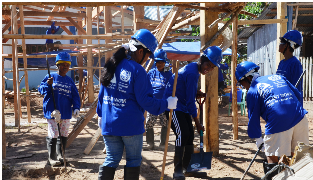
Workers build a centre to produce Sawali split bamboo mats used for walls of tourist resorts and hotels (to transition to medium-term labour-based community work, skills training and enterprise development) in Coron, Palawan (Philippines) under an emergency employment programme after the 2013 typhoon Haiyan (Yolanda).

To overcome the ill-effects of TC Winston the ILO's technical assistance fostered the adoption of a national employment policy embodying effective and responsive on-ground strategies. This initiative translated to three key interventions for recovery that were implemented (summarized below). 94