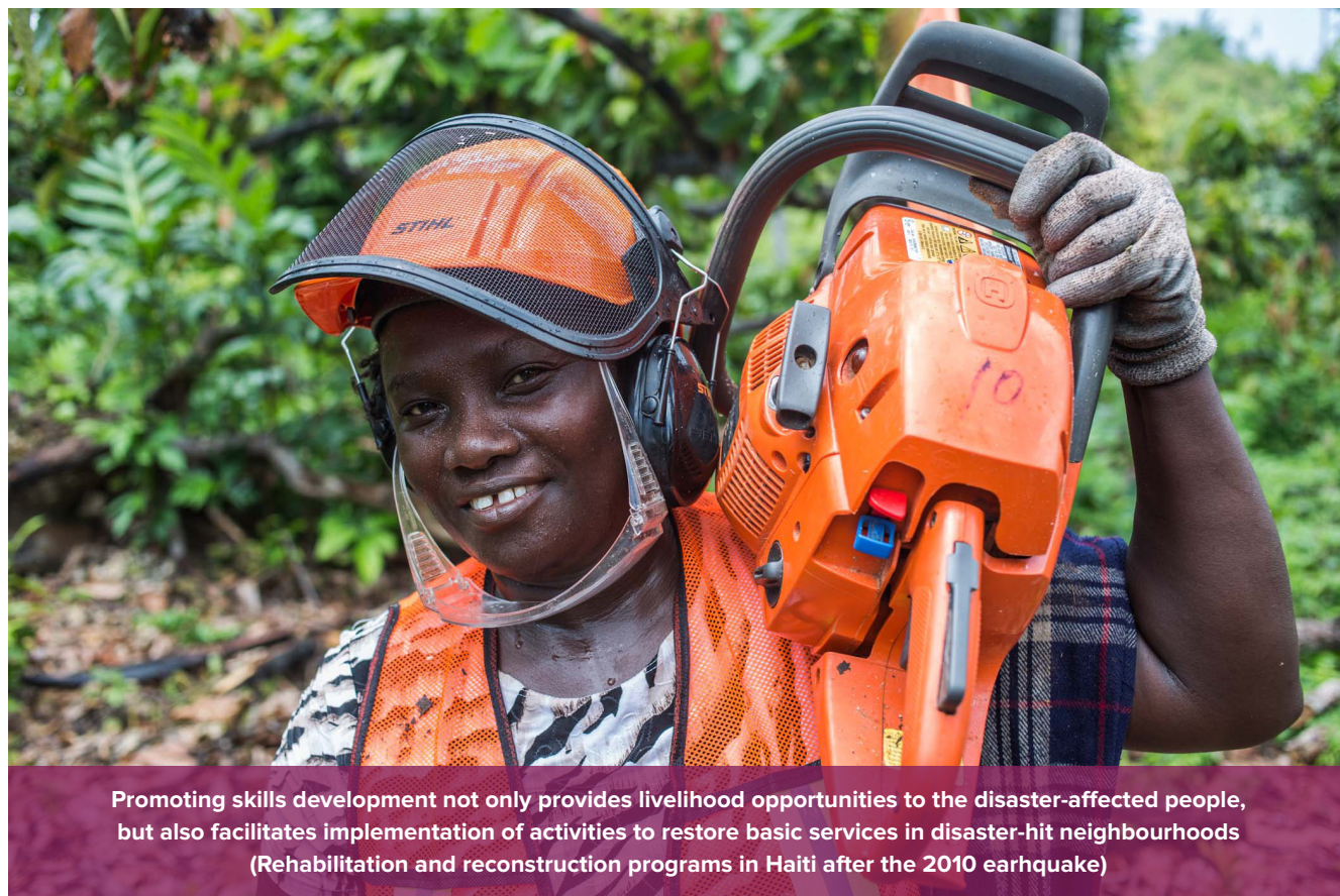
Promoting skills development not only provides livelihood opportunities to the disaster-affected people, but also facilitates implementation of activities to restore basic services in disaster-hit neighbourhoods (Rehabilitation and reconstruction programs in Haiti after the 2010 earthquake)