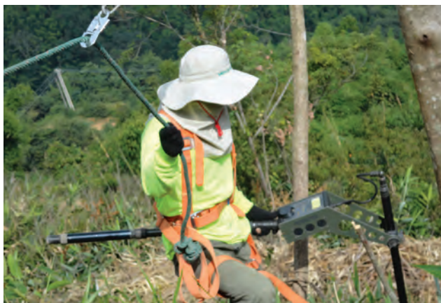
Deep Search Using a Safety Harness in Steep Terrain.

Throughout 2012 Milsearch Lao UXO cleared 2,958,098m 2 to a depth of 250mm and 2,708,449m 2 to varying depths down to 2.5m, making this land available for: