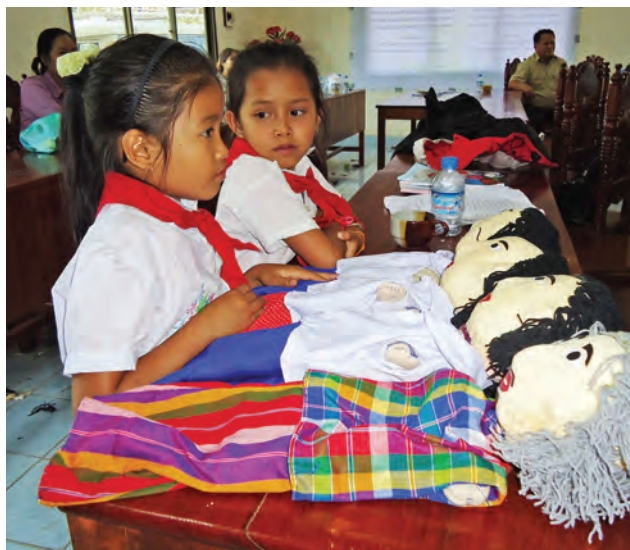
Children with puppets used for MRE activities.