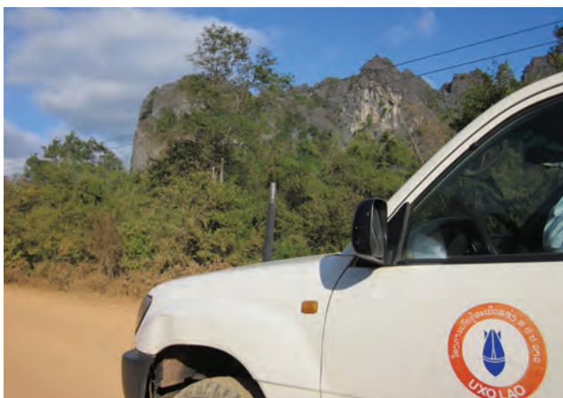
Above: A natural funnel formed by the limestone cliffs of Boualapha District were used by the Vietnamese as the 'Ho Chi Minh Trail'. The area is pitted with bomb craters and highly contaminated to this day.

The high levels of UXO contamination in the Eastern Provinces of Laos are a daunting obstacle to these developments as huge areas of land need to be cleared before it is safe to begin construction. It seems that the people of Laos are now, more than ever in need of funding for clearance of UXO, making the continued support of WWM critical to the future of the country.