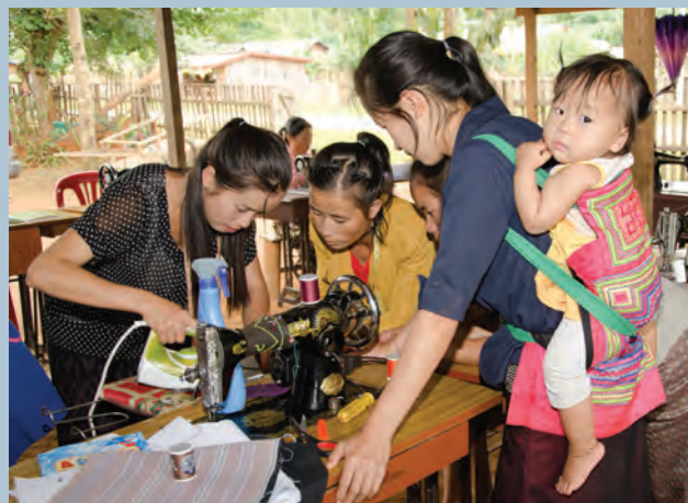
Above: Handicraft training, organized by QLA, in Hai Hin Village.