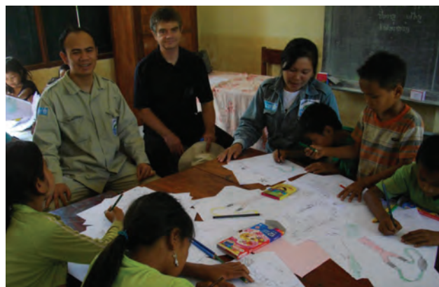
Visit of Michel Goffin, Charge d'Affaire a l'Union Europeenne - Kids club at school – Sepon March 2012.

The risk education team conducted UXO awareness-raising sessions, as planned, in 20 villages. The 'Safe Kids Club' program was adjusted to be carried out in the school environment. The risk education team also conducted a KAP survey.