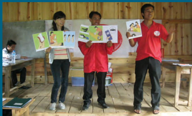
VHVs practicing Basic Cardiac Life Support at a VHVs Training.