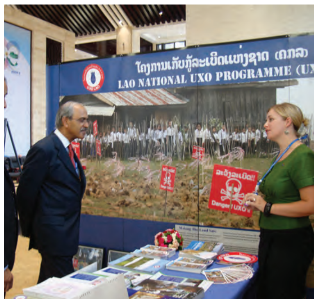
ASEM delegates from all over Europe and Asia visited the UXO Sector exhibition at the ASEM summit to learn about the UXO challenge in Lao PDR.

A strong presence at these high-profile international events ensured strong advocacy for the victims of UXO in Lao PDR and served to generate awareness of the ongoing challenges of UXO contamination for the people of Lao PDR.