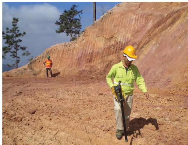
Deep Search at Phu Kham Copper and Gold Mine.