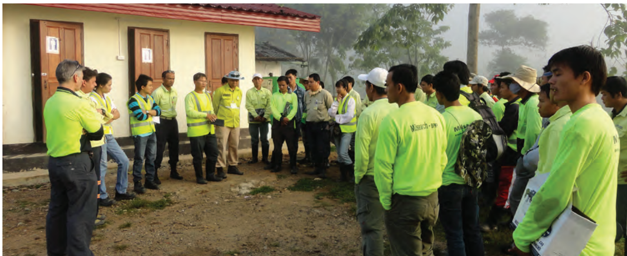
Morning Safety Toolbox Prior to the Commencement of Work.