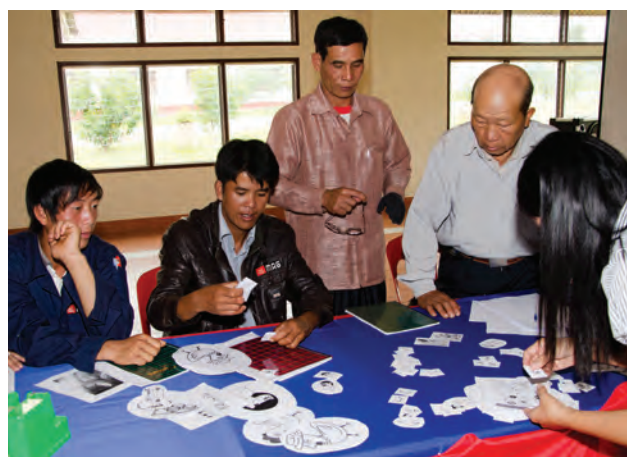
Financial literacy training activity during QLA stakeholder meeting.