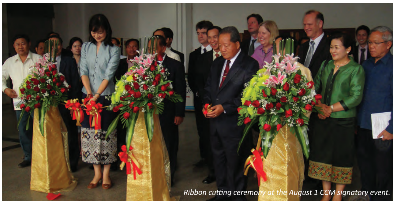
Ribbon cutting ceremony at the August 1 CCM signatory event.