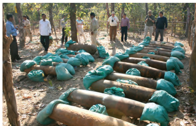
Big bombs waiting to move to the demolition site in Saravane Province

These efforts have contributed to a decrease in the recorded number of annual casualties from 302 to only