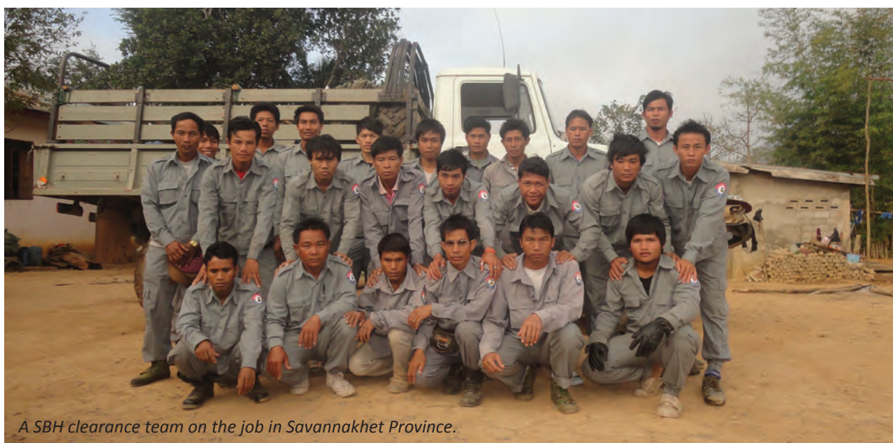
A SBH clearance team on the job in Savannakhet Province.

Our major partner in 2012 was Stora Enso Lao Company.