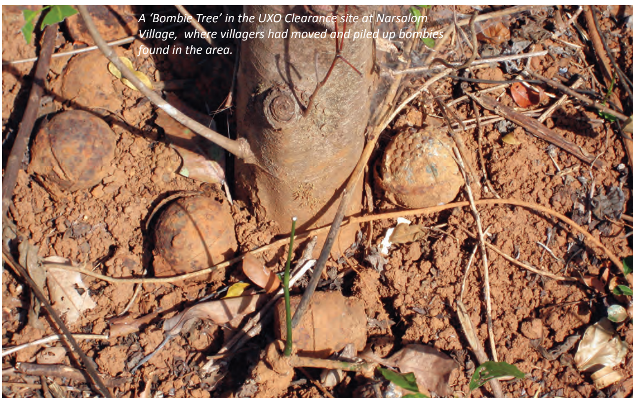
A 'Bombie Tree' in the UXO Clearance site at Narsalom Village, where villagers had moved and piled up bombies found in the area.