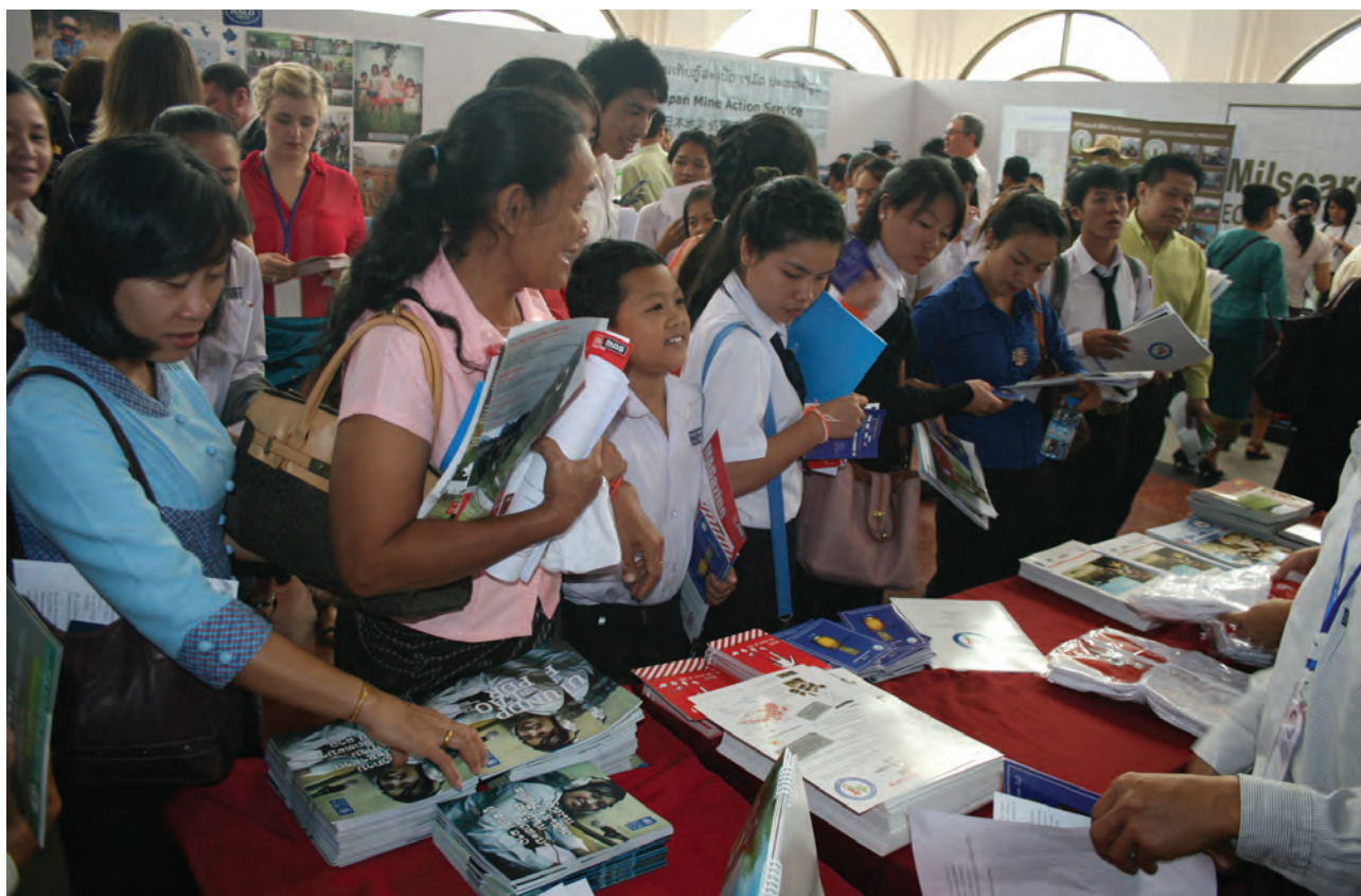
Above: High school students visit the UXO exhibition at the launch of the MDG9 logo and 2nd anniversary of the signing of the CCM event held at the National Culture Hall.