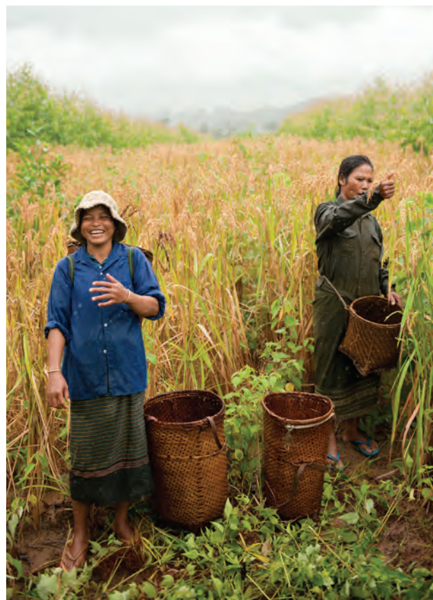
Stora Enso Agroforestry Model in Ta Oy District, Saravane Province.

The key aspect of the agroforestry model is that it is based on a wide spacing of trees, allowing villagers to grow rice and other agricultural crops between the