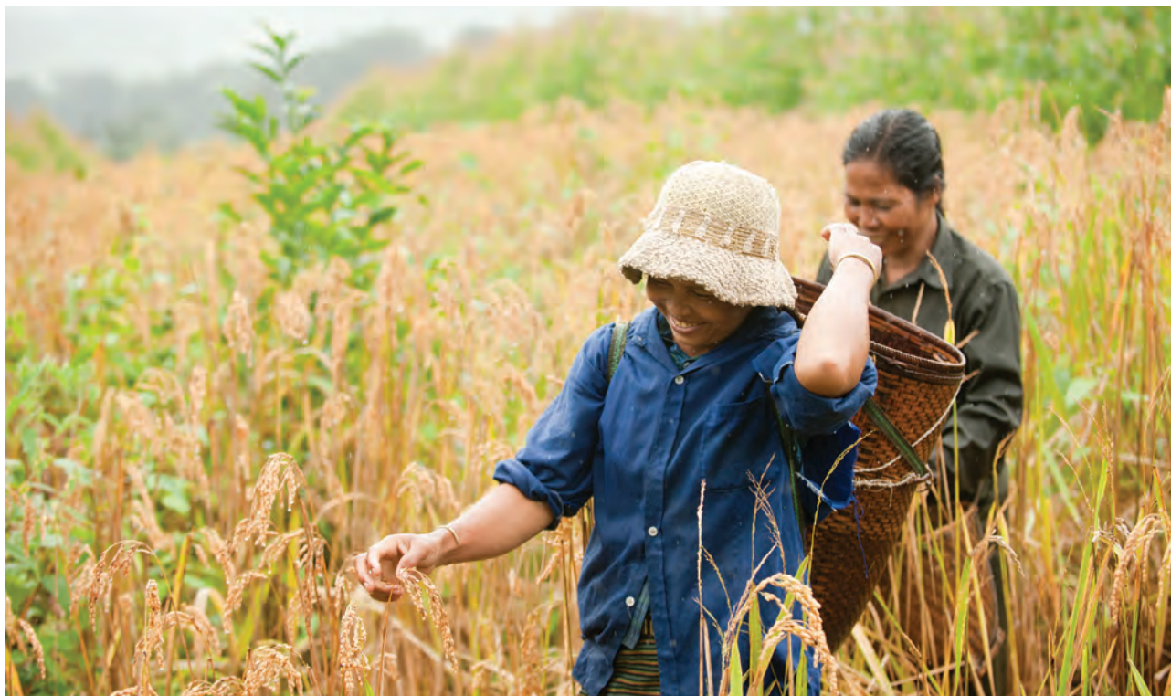
Above: Local women tending their rice crop, planted in-between rows of Eucalyptus trees .