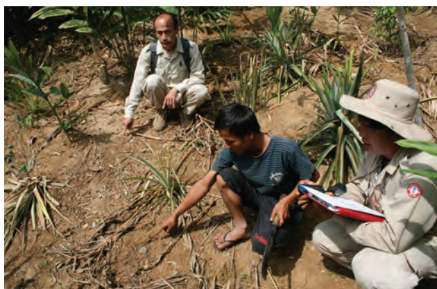
A man shows the UXO Lao survey team where he found a bomb in his pineapple garden in Luang Prabang Province