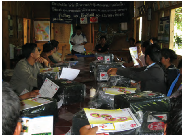
Handing out and explaining how to use First Aid Kit, Booklet and Brochure to VHVs.

AAR Japan provides First Aid Training to Health Center Nurses (HCNs) and Village Health Volunteers (VHVs) in case of UXO accident. AAR also cooperates with UXO-Lao in the sector of MRE.