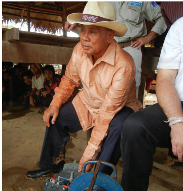
Visit of the HI operations with the Minister Mr. Bounheuang Douangphachanh, March 2012.

The roving team's clearance work plan has been adjusted to address the findings from the DFS. Indeed, HI decided to bring full support to the DFS by deploying the roving team to each 'Emergency Clearance Request' reported, with clearance activities being carried out within one month.