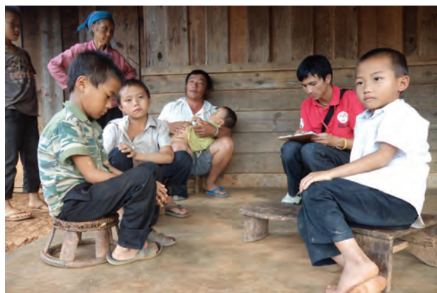
Interviewing a UXO victim about the accident.