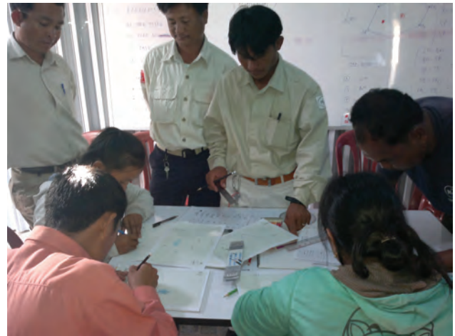
Staff from HALO's programme in Cambodia work closely with Laos national staff to improve knowledge of survey techniques.

Following a period of consultation with the NRA and the Ministry of Foreign Affairs, HALO's MoU was approved on the 4th of October. HALO immediately applied for desk accreditation and was awarded this certificate by the NRA on the 14th November.