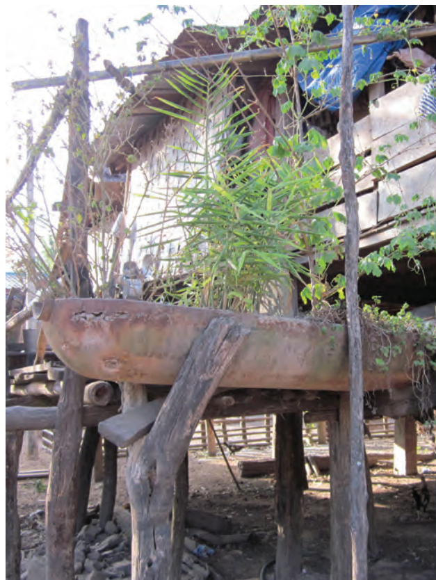
Villages of Boualapha District are full of examples of 'living with bombs', with locals stockpiling scrap metal and of using bomb casings as building materials. In this village, bomb casings were split in half and used as 'pots' for herb gardens.

The second UXO clearance site at Narsalom Village proved to be the highlight of the trip as the monitoring team came face to face with the harsh realities of UXO clearance in Boualapha District. The clearance of thick vegetation by a bulldozer to make room for much needed government infrastructure had to be stopped when dozens of UXO were found on the ground. A UXO Lao team was called in to investigate and an unexploded 500 pound bomb was later found on the surface of the site, as well as a total of 80 UXO, of three different varieties.