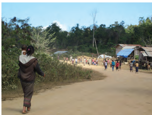
A young mother follows the evacuation instructions of the UXO Lao clearance team before the detonation of UXO located in from Narsalom Village, Boualapha District.