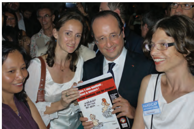
Meeting with Francois Hollande, French President to get signature of the HI petition book on submunitions – November 2012.