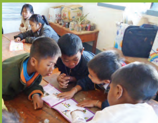
Group activity in MRE in school.