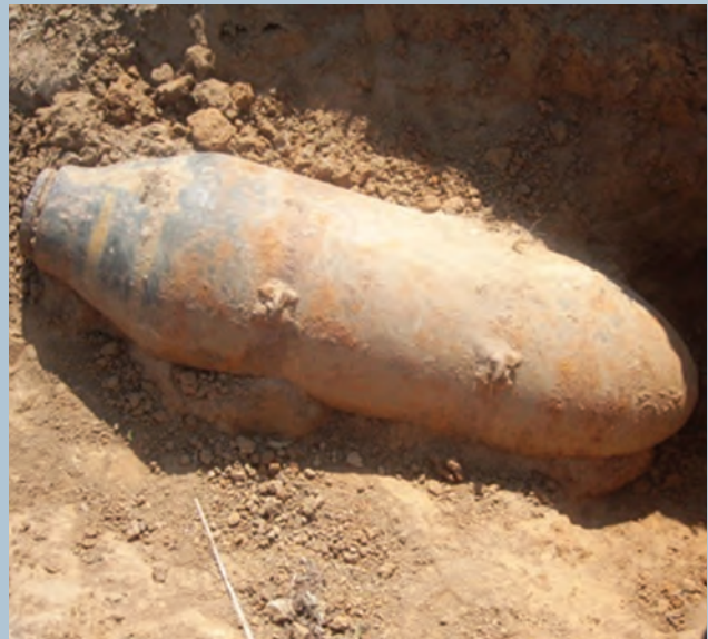
MK lbs. Bomb, Laksao.

The correct behavior of the children (following SODI MRE activity at the school), the use of the SODI 24 hour hotline and the rapid response from the SODI Survey Team is an example of how the local community can rely on a UXO clearance capacity for their benefit and wellbeing.