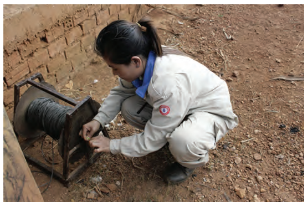
A female deminer prepares for the demolition of a bomb