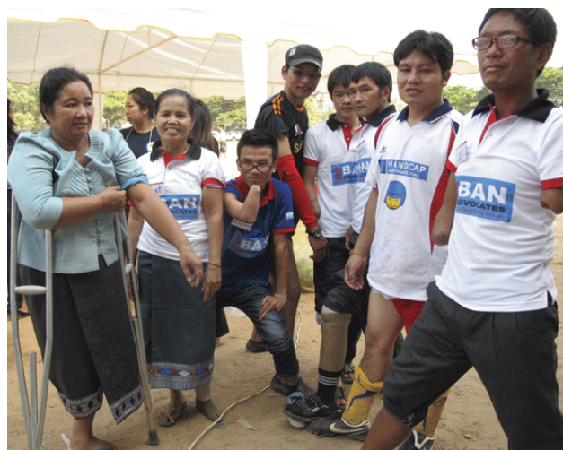
The Lao Ban Advocates Lending their Legs on 4 April 2012.