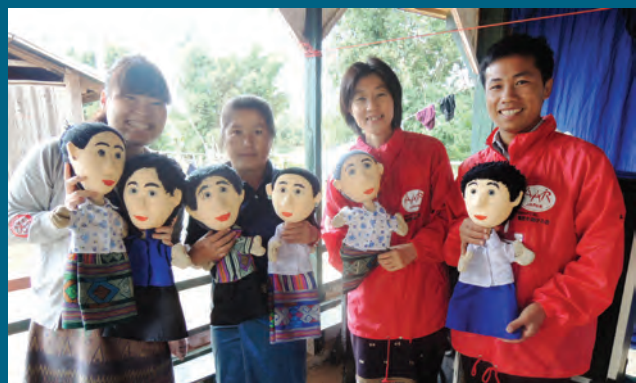
Providing villagers with First Aid Posters in order to develop knowledge about First Aid at a village workshop.