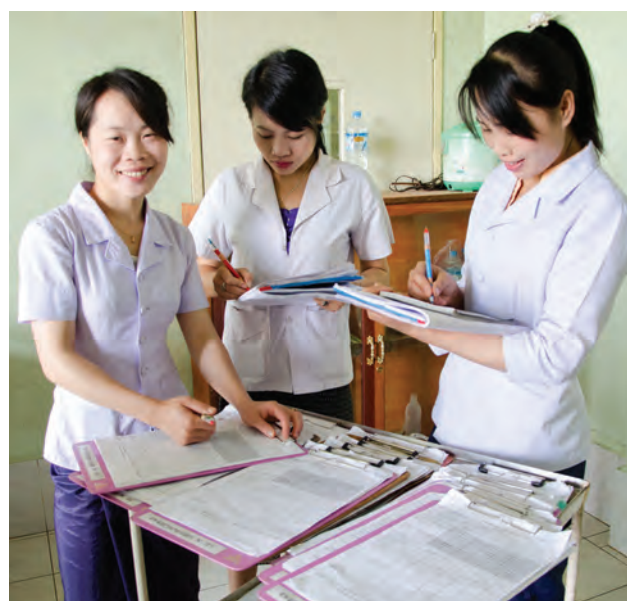
New graduate nurses at Xiengkhouang Provincial Hospital. Training activities helps them develop confidence in providing trauma care.