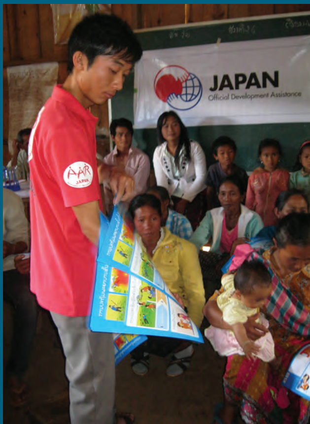
Providing villagers with First Aid Posters in order to develop knowledge about First Aid at a village workshop.