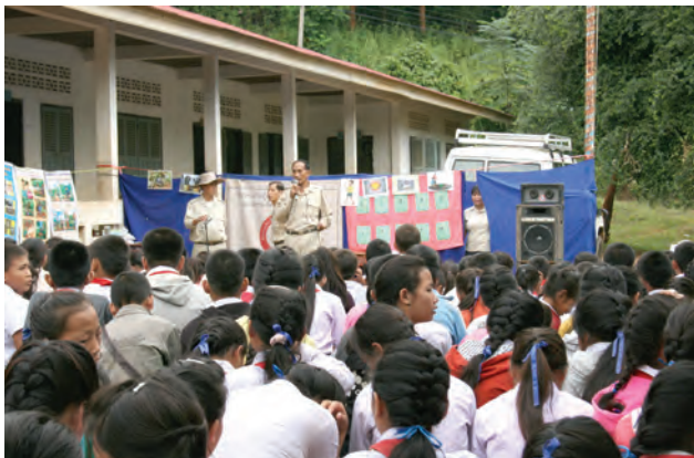
The community awareness team educate the risk of UXO for students at the primary school

UXO Lao has significantly contributed to this achievement in 2012 through the release of 3,199 hectares of land through area clearance and technical survey activities reaching 516,410 beneficiaries. In 2012, UXO Lao destroyed 49,189 items of UXO of which 23,266 were 'bombies' through clearance, technical survey and roving tasks.