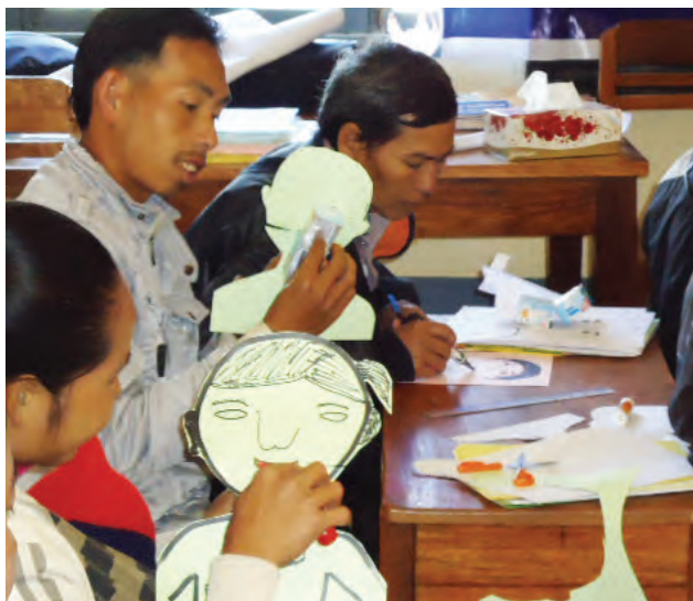
Making paper puppets as part of MRE activities.