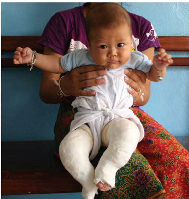
Child receiving treatment for club foot at the Center of Medical Rehabilitation in Vientiane.