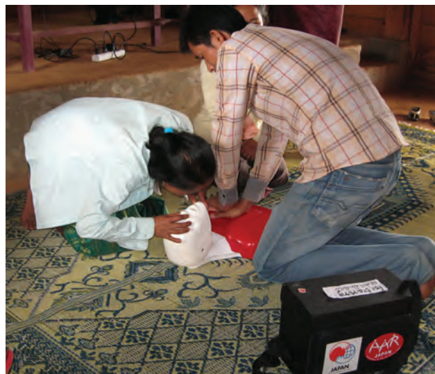
VHVs practicing Basic Cardiac Life Support at a VHVs Training.