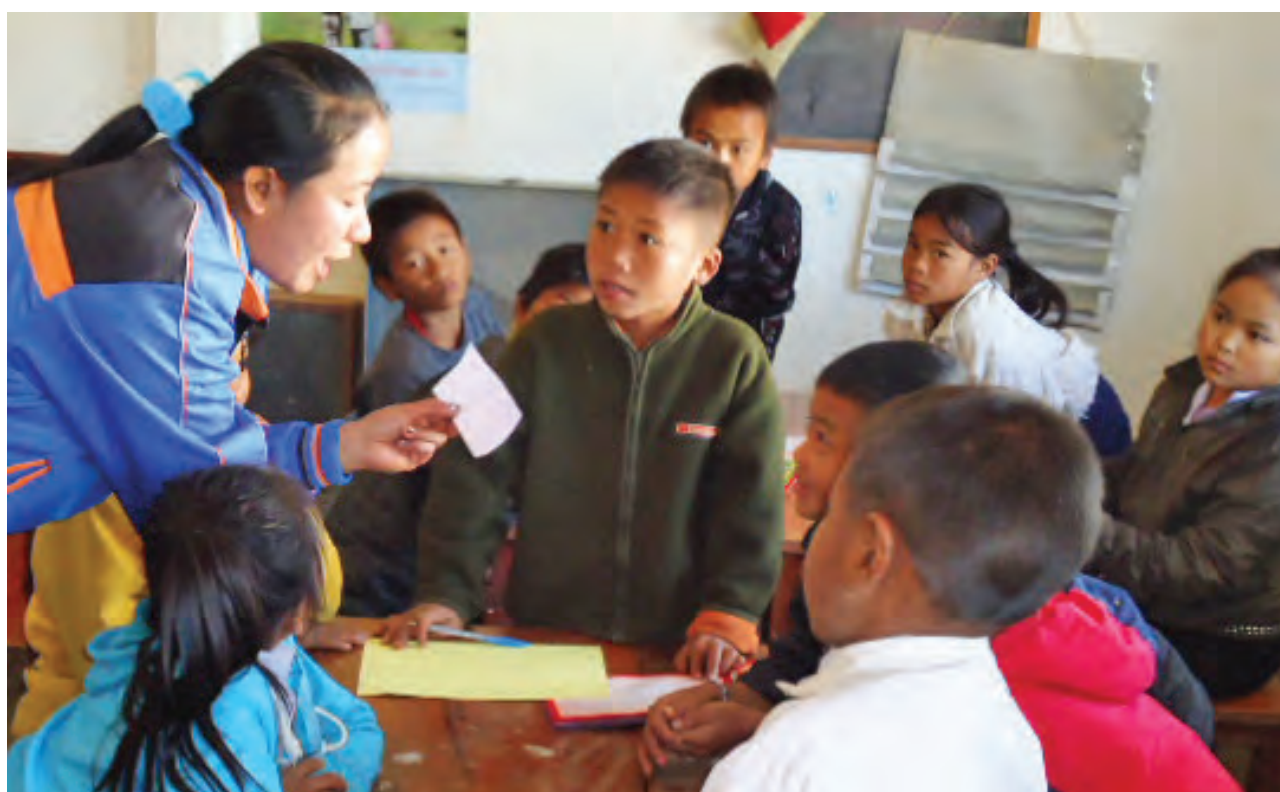
Learning about the risks of UXO in a classroom setting.