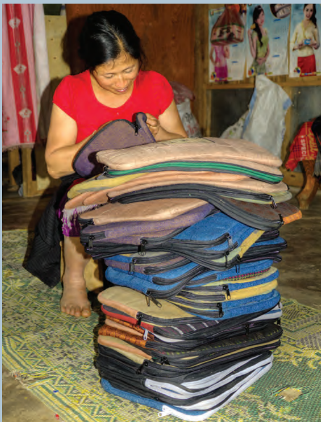
Above: The QLA organized a training in making laptop bags in Dong Dan Village which has many UXO survivors.