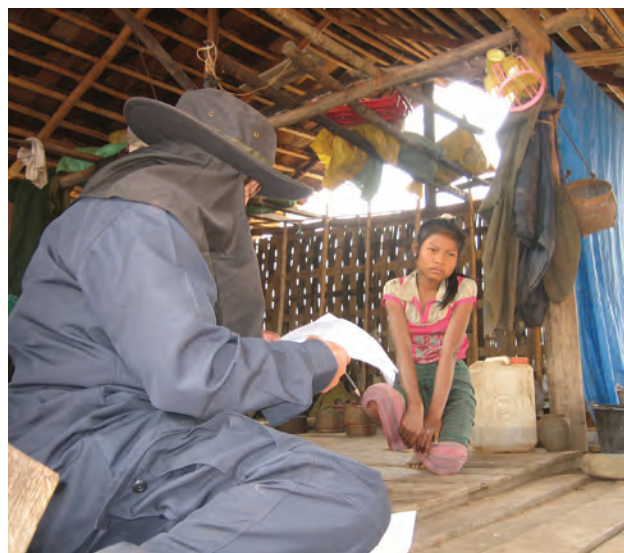
HALO's survey team gathering information on the impact of cluster munitions and intended land usage.

HALO has been discussing potential future co-operation opportunities with the other INGOs that operate in HALO Laos' area of operations. Prospective collaborations will include Welthungerhilfe (previously known as German Agro Action) a German NGO engaged in rural development and food security, operating in Sepon District. HALO will continue aiming at establishing working relationship with other NGOs, in order to ensure that, where possible, UXO survey and clearance takes place in areas where other humanitarian interventions have been hindered by the UXO threat.