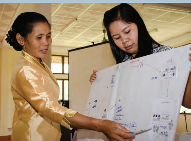
Financial literacy training during QLA stakeholder meeting in June 2012.