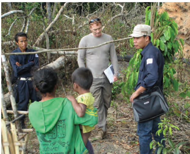
HALO conducts village assessments.

HALO received its operations permit from the Ministry of Foreign Affairs of Lao PDR in February 2012 and, having secured start-up funding, deployed its management team to Laos in June.