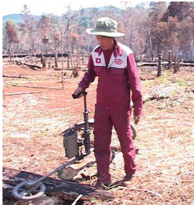
Left: The PSD clearance team. Above: Using specialized metal detectors to identify UXO