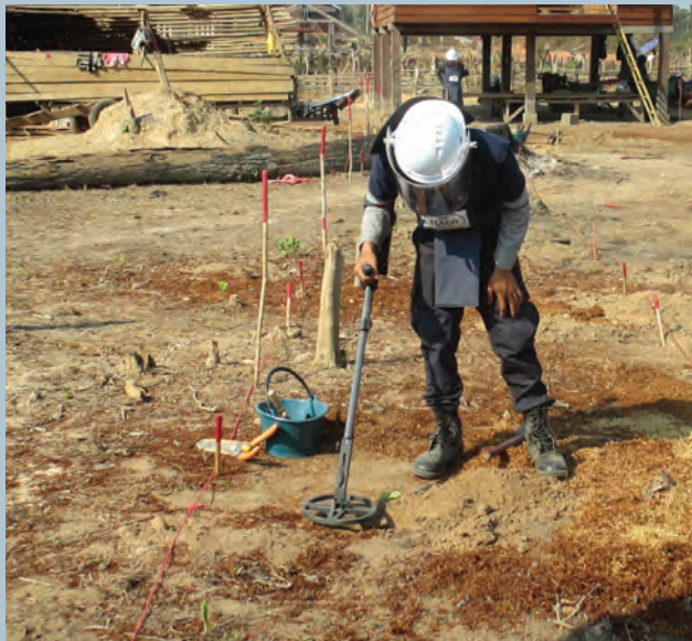
HALO's UXO Clearance technician at HALO's first site in Nakhapung.

The first HALO Laos survey team deployed to the high impacted community of Nakhapung, a newly resettled village in Vilabuly District, at the end of December 2012. The village expects to house over 40 new families during 2013 – 2014 and will also build a new school and water well; however, the land is contaminated with air-dropped bombs and cluster munitions, which are scattered in the areas of village expansion. Speedy survey, followed by targeted clearance, is therefore needed to prevent accidents. HALO has been asked by the Vilabuly District Authorities to conduct a survey and assessment of the areas within the village boundary and the neighboring farmland, prior to deploying clearance assets. HALO Laos is on track to commence clearance activity in the Nakhapung in January 2013.