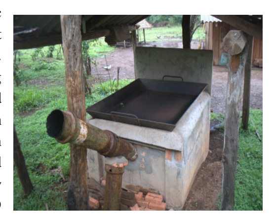
Pan drier provided by buyer

Oh Anh village was resettled by a Hmong ethnic group in 1974. It is located about 8 km northwest of Road No. 7 and enjoys easy access for traders. Since 2009, 46 families have been cultivating wild tea, planted in various small plots and between forest trees within the Phou San National Protection Forest, some up to 5 km from the village. The exact area of planted wild tea in the forest is unknown but probably in the neighbourhood of 100 hectares. Another 9 hectares of wild tea are cultivated in tea gardens.