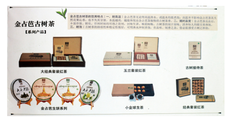
High quality packing and price of Lao wild tea for Chinese

Chinese tea companies entered the Lao tea sector in 2005. They mainly provided Lao farmers in Phongsaly and perhaps Luang Namtha provinces with cloned tea seedlings from adjacent Yunnan Province in southwest China. Most of these companies were also involved in the rubber, vegetable and banana sub-sectors