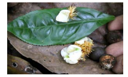
Leaf, flower and seed of Lao wild

whereas the Camellia sinensis var. assamica (the Assam variety) is the most common tea variety in Laos. The Assam variety, which has longer buds and leaves, is also cultivated in northern India for the production Darjeeling black tea, and in China where it is mainly used for Pu-erh tea. The Cambodian variety has medium sized leaves and is taxonomically referred to as Camellia sinensis var. laciocalyx (Mondal et al. 2003).