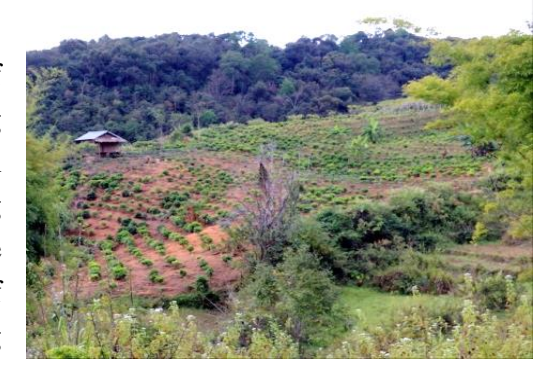
First tea garden, Phommeuang, Ngodphae

In 2015, the leading tea family sold 666 kg of fresh tea and 654 kg of processed tea, earning them a total income of approximately 70 million kip or USD 9,000. Compared to Ngot Phieng village, the 2015 price for fresh tea is at the same level i.e. processed tea fetched prices of 8,000 to 22,000 kip or USD 1 to 2.7 per kg whereas the processed tea only fetched 75,000 to