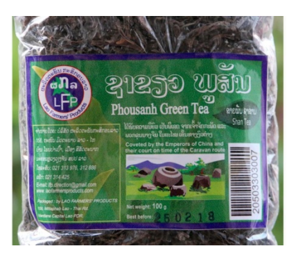
Example of labeling by LFP

The key domestic consumer tea market is in Vientiane. It is very crowded, competitive, and based mainly on price. The market for Phou San tea is small, but generally sells at higher prices than tea from other northern provinces and southern Laos. Hence, currently the domestic market for Phou San Wild Tea is limited. Furthermore, the packaging by most traders and processors tends to be unattractive and poorly marked. LFP has the most attractive packaging with a Plain of Jars logo. San Jiang Tea Company also has very appealing packaging for