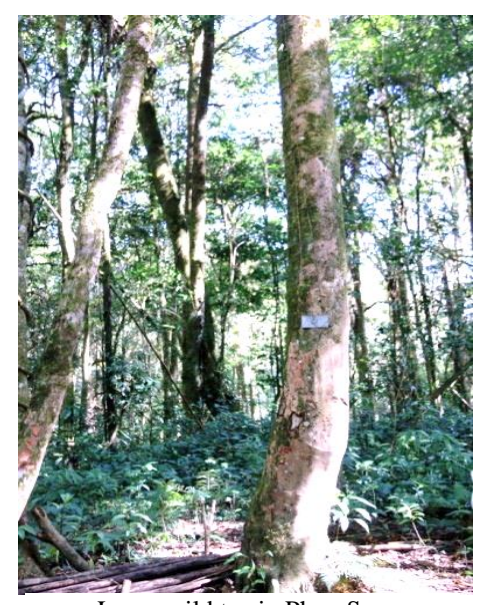
Large wild tea in Phou San

Since 2015, the TABI project has assisted local authorities with the marking of 1,600 wild tea trees in Phou San Conservation Forest.