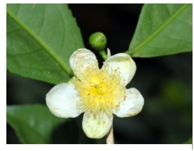
Wild tea flower

In larger tea producing countries, many clones are cultivated in tea gardens with numerous local and commercial names. There are believed to be more than 1,000 clones in China alone (see RateTea.com), where single premium quality tea plants are carefully selected for their growth, performance and unique taste and subsequently propagated by cutting off small branches. Some plants in tea gardens are up to 100 years old, but are