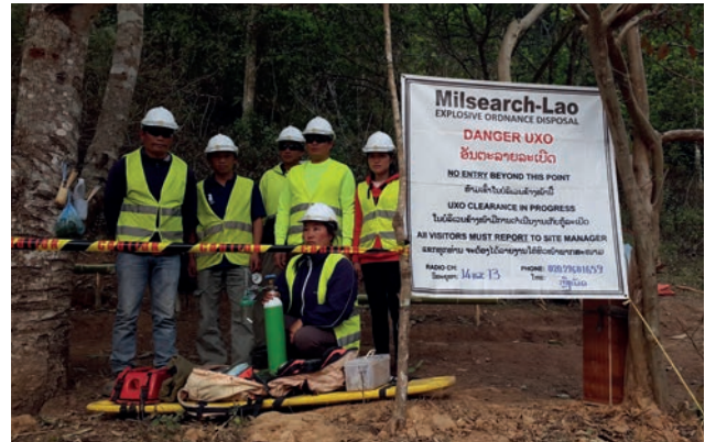
Milsearch Medical Emergency and Control Point set up.

In 2014 Milsearch Lao had achieved 878 consecutive days without a "Lost Time Injury". After another efficacious year both at our Regional Head Office in Vientiane and in the Field we can add 365 days to this for a grand total of 1243 days without a lost time injury in 2015. Milsearch continues to pride itself on our safe