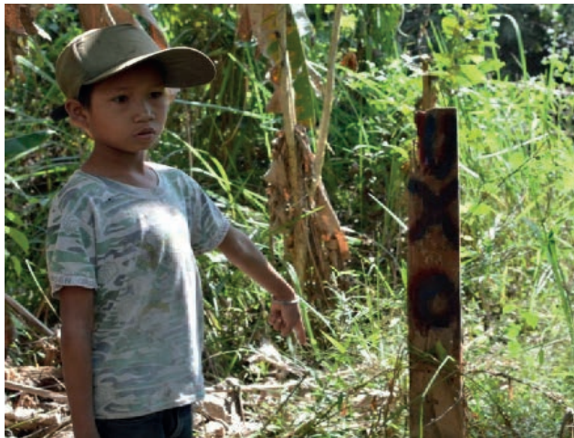
Muangchan village. After RE session, a child reports an UXO he had identified when hunting rats.

23 villages, resulting in the destruction of 1,310 UXO.