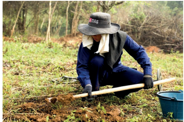
MAG Laos female technician carefully excavating the ground in Xieng Khouang province.

the opportunity to provide information regarding any evidence of UXO contamination that they had and also qualitative information regarding how this impacted on their lives and livelihoods. Techniques used by the MAG CL capacity included community meetings, focus group discussions which were divided across genders and age groups, and household questionnaires.