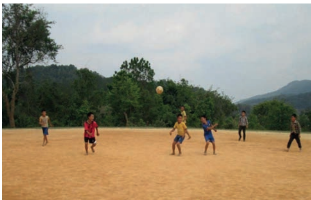
The new football pitch after ERW-clearance (Primary School, Dong Danh, 8 April 2015)

Within 2015, MAG's Community Liaison (CL) capacity concluded non-technical survey in 37 villages. During this process each member of the village community had