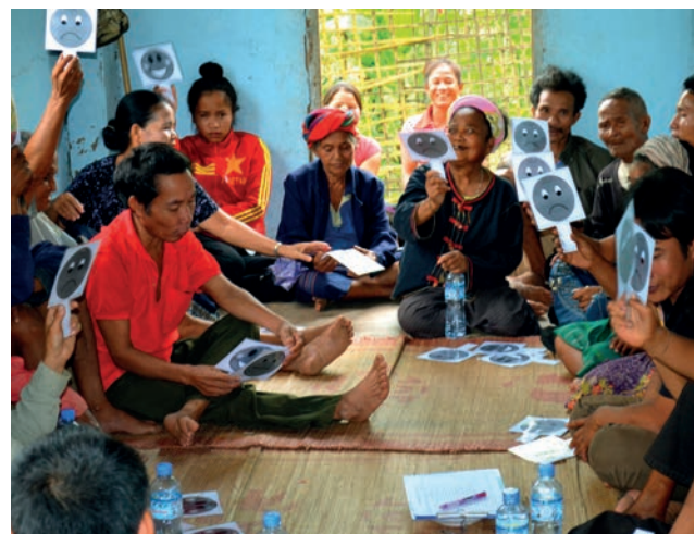
Barrier Assessment Session with persons with disabilities and UXO survivors in Sepone in September, 2014.

Clearance: Handicap International continued with clearance of CHAs in 2015. The clearance is defined in a yearly work plan in coordination with local stakeholders and the NRA. Generally, area clearance is only carried out on CHAs and based on the UXO evidence point reports and on the perspective of local development initiatives as identified by the Districts, or development organizations. Handicap International EOD teams were continuously trained to maintain standards. In 2015, two section commanders succeeded the EOD Level 3 training from May 04th to June 12th. From October 06th to 08th, 98 staff including Deminers, Section Commanders, Team Leaders, SEOD4, Medics and Drivers, participated in a refresh training organized by HI technical Advisor in HI. From November 05th to 16th, 48 staff participated in a technical training for Technical Survey procedures organized by HI Technical Advisor. Six clearance teams were deployed to conduct the clearance activities in three districts. 74 sites were cleared and turned over to communities for gardens (26), roads (14) and cash crops (7). A total of 540,000m 2 have been released in