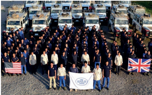
The HALO Laos Programme 2014.

utilized to the best effect and benefit of the people of Laos.