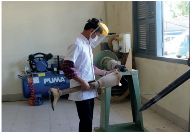
Bench Technician at Center for Medical Rehabilitation grinding a lower limb prosthetic device.