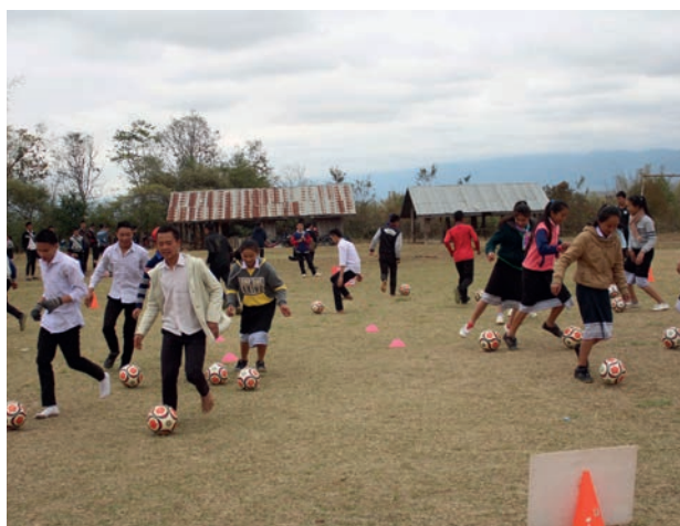
Children try to dribble the ball away from mine area, they can learn about dribble skill in football also to keep away from mine area.