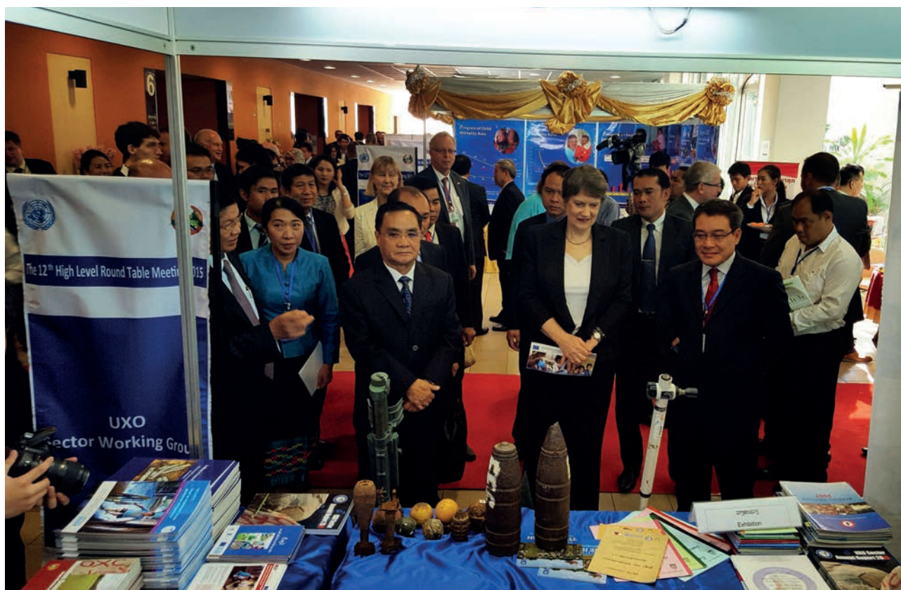
H.E. Prime Minister Thongsing Thammavong and HRTM delegates from all over Europe and Asia visited the UXO Sector exhibition at the HRTM to learn about the UXO challenge in Lao PDR.