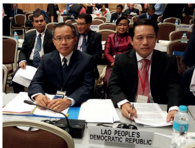
Lao delegation attended the First Review Conference of the CCM in Dubrovnik, Croatia.

In 2015, Laos has given great importance to the Convention on Cluster Munitions (CCM) through the approval of several related regulations, policies, strategies and practices. Led by Deputy Minister of Foreign Affairs Mr Saleumxay Kommasith made the government's reaffirmation when delivering his speech at the First Review Conference of the CCM which took place from September 7 to 11 in Dubrovnik, Croatia. The Lao delegation made substantive statements in all key sessions. The Review Conference also marks five years since the First Meeting of State Parties to the convention took place in Vientiane in 2010. The Deputy Minister, who is also the Vice Chairman of the National Regulatory Authority (NRA), reminded the participants about the country's implementation of the convention over the past five years with satisfactory results having been achieved. Around 500 delegates have participated in the review conference under the chairmanship of Croatian Prime Minister Zoran Milanovic. A number of activities and projects have been implemented by the international community since the CCM entered into being. Many have completed the destruction of cluster munitions from their arsenals, inspections have been carried out and legal measures have been established in many countries for protecting civilians from the cluster bomb threat.