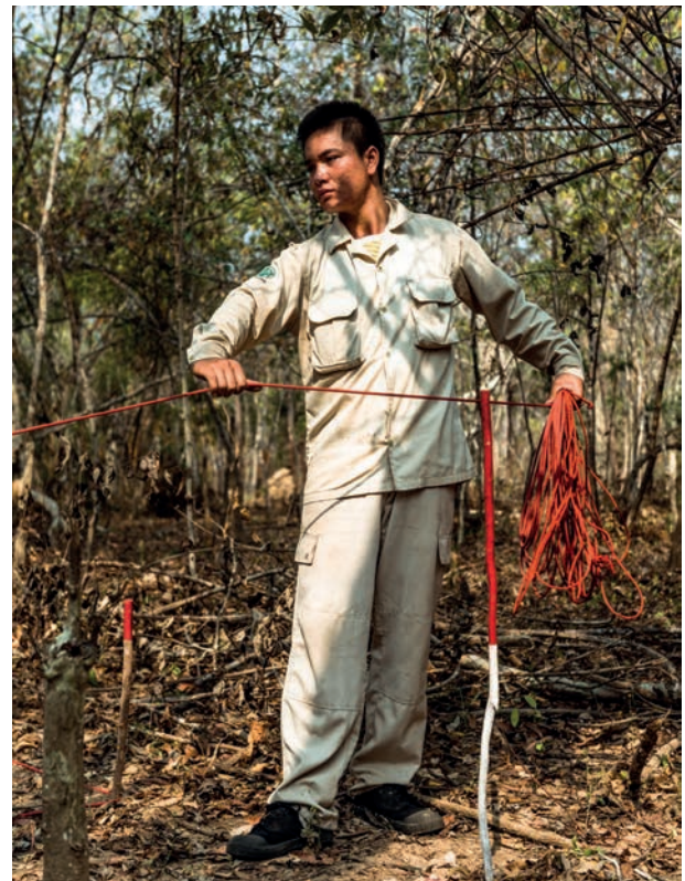
NPA team member roping off area for further investigation

NPA Lao will cooperate with the Gender and Mine Action Program (GMAP) to produce an animation film in the first quarter of 2016. The film will show examples of why and how taking gender and diversity into account is important in mine action. This will be utilized as a training tool that can be used to increase the gender and diversity among staff.