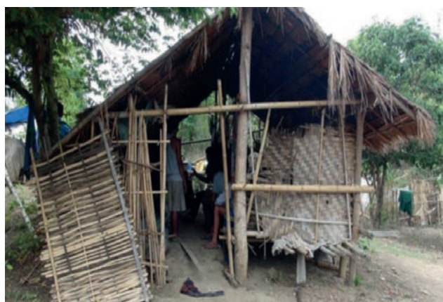
The house of Vanh and her children (before the storm which damaged it).

When QLA met Vanh, she and her children were living in a bamboo house with a grass roof that was quite far out from their village and in a state of major disrepair. Although they earned a small income from growing corn they had no means for fixing the house or improving their living conditions. The remote location of the house was not good for security; A total of 14 of Vanh's large chickens have 'disappeared' in the past.