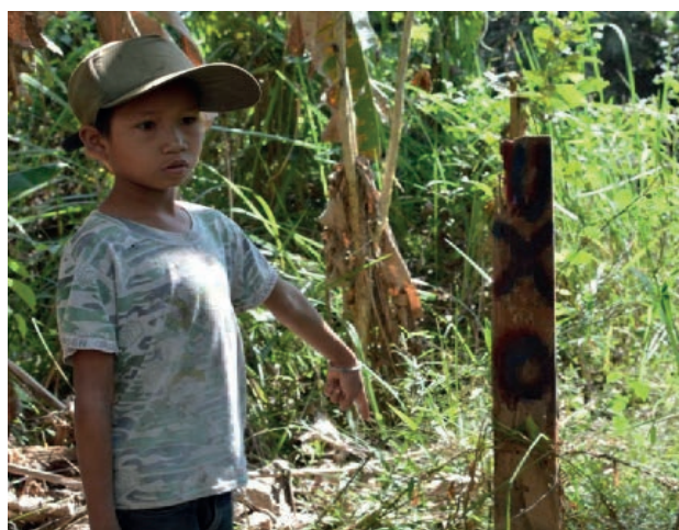
Muangchan village. After RE session, a child reports an UXO he had identified when hunting rats.