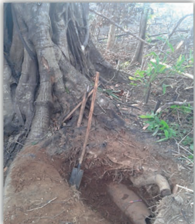
MK-81 250 Lbs found at PHB WD