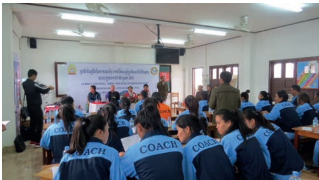
A technician isolates a signal on a clearance task located within Nonsomphou Village boundaries.

In 2015 HALO's Survey operations proved extremely successful. HALO was able to conclude non-technical and technical survey in 35 villages, and expects to have concluded survey within all of its currently assigned target villages in early 2016. The adoption of evidence-based survey across the UXO sector is a significant step