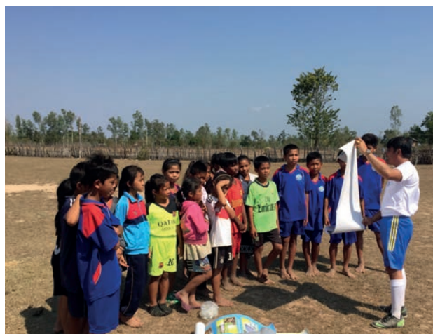
Doing MRE in between the football clinic and game