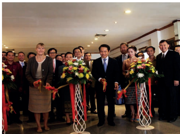
Ribbon cutting ceremony at the celebration of the 5th anniversary of the entry into force of the Convention on Cluster Munitions (CCM) on 1 August, 2016

exhibition on showcase the organization achievements. On the 1st August, there was a full day sport activities call Football and Petanque Friendship Tournament. It was held at Saphavisa Stadium, Polytechnic College. Teams representing a range of different organization and government departments joined this meeting. There were more than 250 people involved in this event.