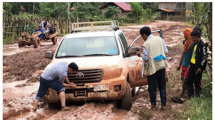
An aid delivery vehicle stuck in the mud in Attapeu Province.

Outcome 6: UXO Clearance conducted in the flood area.