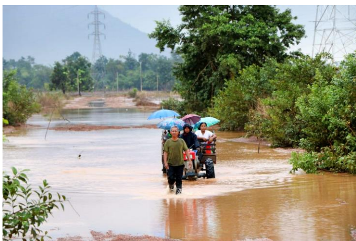
Villagers escaping to safety after a flood in Attapeu Province in 2018.

This Least Developed Country is regularly affected by typhoons (storms), floods, flash-floods, droughts, landslides, earthquakes, epidemics and UXO contamination which have negatively impacted its development growth. Flooding is the major cause of disasters in Lao PDR - both in terms of frequency and intensity. Floods in the central and southern parts of the country and flash floods in the northern part of the country occur on a yearly basis.