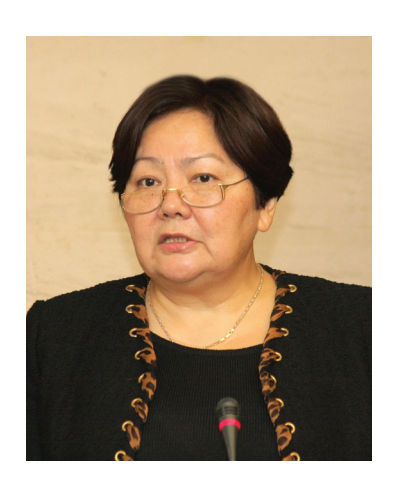
Ms. MADINA JARBUSSYNOVA Ambassador-at-Large, Ministry of Foreign Affairs of the Republic of Kazakhstan