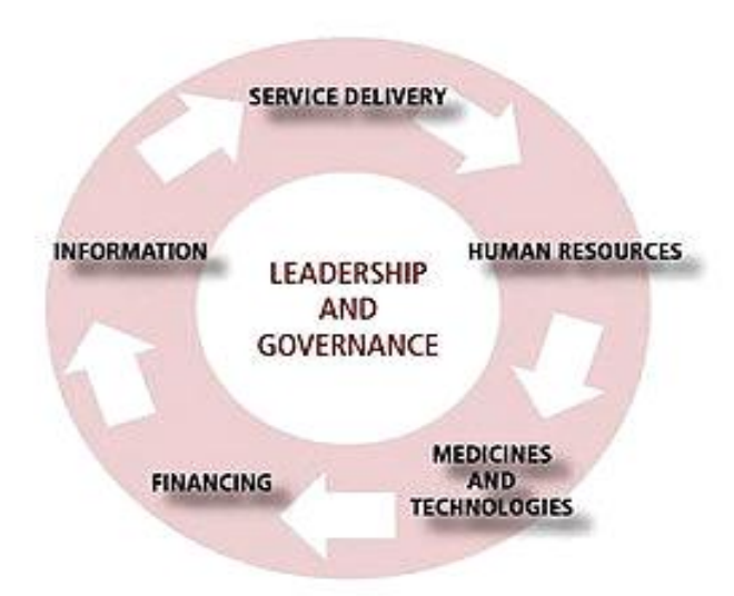
Figure 1: WHO Health Systems Building Block Framework

The assessment of risks of corruption in the health sector is based on the World Health Organization (WHO) health systems building blocks framework. While acknowledging that health systems are highly context specific, WHO notes that most health systems are organized around fundamental "building blocks" including leadership/governance, service delivery, health workforce, information, medical products/vaccines/technology, and financing (Figure 1). This assessment considers the weaknesses in these building blocks and how they may be affected by or facilitates corruption.