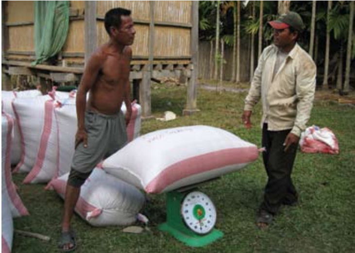
Farmers in Tmatboey Village inside Kulen Promtep Wildlife Sanctuary receive a premium price for their Ibis Rice, which is grown without damaging wildlife habitats. Environmentally friendly livelihoods preserve wildlife and reduce rural poverty.