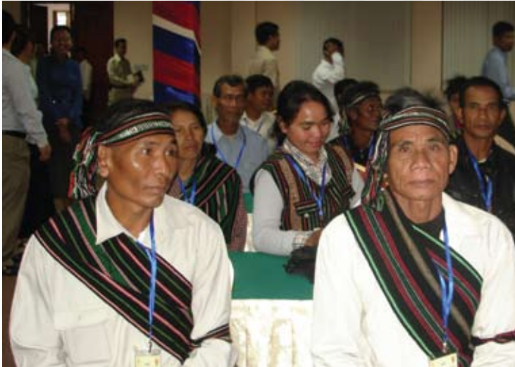
Traditional Authorities from indigenous groups in Mondulkiri meet parliamentarians and discuss the challenges they face, as well as their culture, livelihood system and traditional rules. (National Assembly)