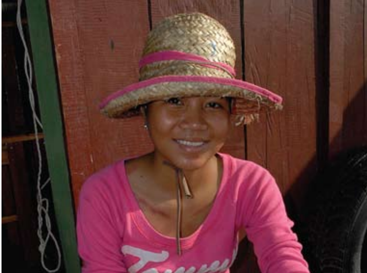
UNDP supports Cambodia as it finds its own solutions to national and global development challenges.

UNDP Cambodia made key contributions to pro-poor development in 2009 by supporting democratic governance, poverty reduction and environmental sustainability. Highlights included helping to build an alliance to respond to climate change, encouraging responsive government through decentralization, and promoting parliamentarians' engagement with citizens. UNDP assisted the Government in playing its part in international efforts on demining, land degradation, chemicals management, ozone-depletion and aid effectiveness. It also underpinned efforts to develop trade and creative industries and promote alternative livelihoods that help preserve both biodiversity and vital natural resources. Its work ranged from providing policy advice to organizing community self-help groups that enable families to improve their lives.