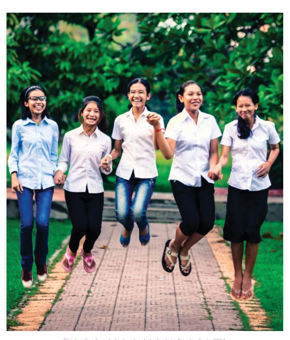
The top five female high school students in Cambodia in 2014.