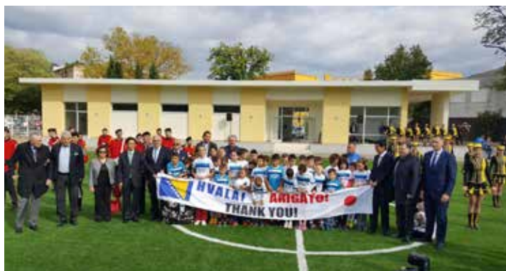
The Kantarevac Sports centre in Mostar, BiH was rebuilt in 2016.

In Uzbekistan, Japan and UNDP are helping businesses to register themselves, obtain licenses and follow procedures for exporting