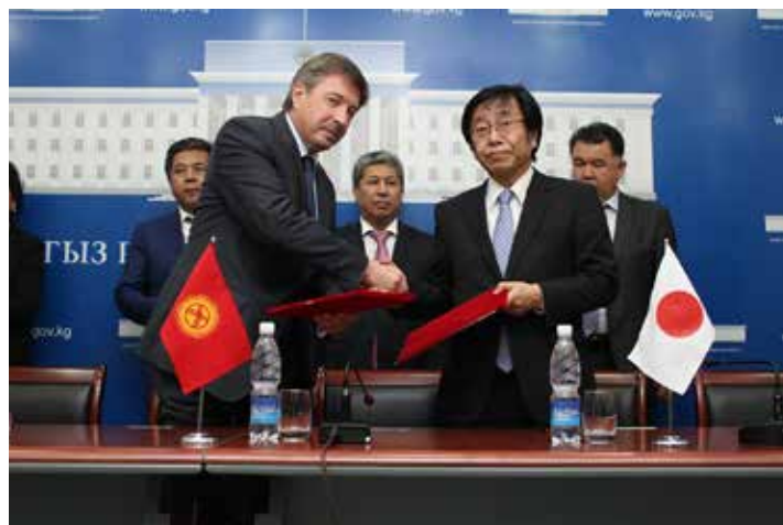
The Government of Kyrgyzstan, JICA, the Japanese Embassy and UNDP sign an agreement ahead of the country's elections