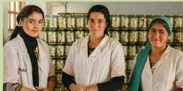
A programme along the Tajik-Afghan border is aiming to strengthen the livelihoods of more than 1,123,000 people.

Small grants have directly targeted at least 3,000 people (including 1,400 women) and indirectly benefited 43,500. 60 rural infrastructure facilities were constructed or rehabilitated, benefitting 270,682 vulnerable people. The project is expected to improve the livelihoods of over 1.1 million people living in the border areas, contributing to stability and security in the region.