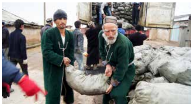
With UNDP and Japan's support, Tajikistan is strengthening its disaster preparedness.

In Kyrgyzstan, a project funded by Japan, supported by the Kyrgyz Ministry of Emergencies and other key partners successfully established an information management system for preventing, monitoring and responding to disasters that has strengthened the country's resilience to natural hazards.