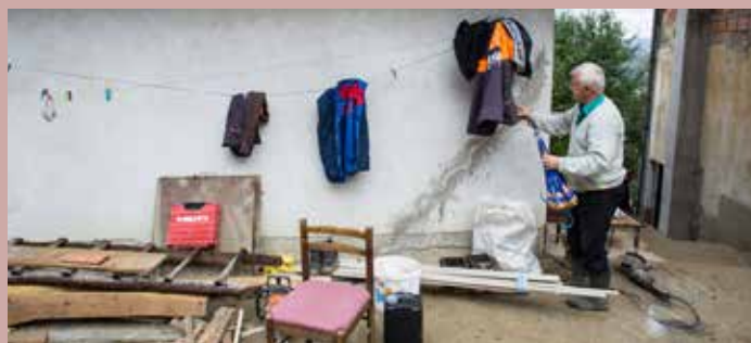
A UNDP-Japan programme has provided safety for 984 people in 13 landslides zones in Bosnia and Herzegovina.