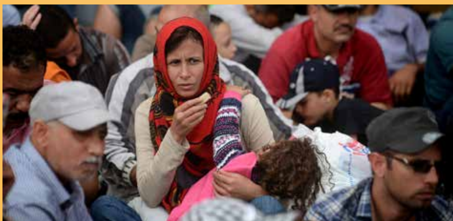
In the Western Balkans, UNDP and Japan are working to strengthen municipal resilience in the context of vastly increased numbers of transiting refugees.

UNDP and Japan are helping to ensure resilience is integrated in the response in Syria