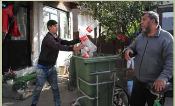
Kosovo* is finding new ways of creating green jobs with support from UNDP and Japan.

In Tajikistan, UNDP and four other UN Agencies -- WFP, UNICEF, UN WOMEN, UNFPA -- are implementing a project with a USD 1.95 million contribution from Japan, through the UN Trust Fund for Human Security that is helping to improve livelihoods, food security, and health in the Rasht Valley of Tajikistan. The project is diversifying crops and improving land management practices through improved access to water, irrigation, pasture and energy. It is also supporting birth registration of all children and civil registration of all marriages and helping girls to attend secondary education.