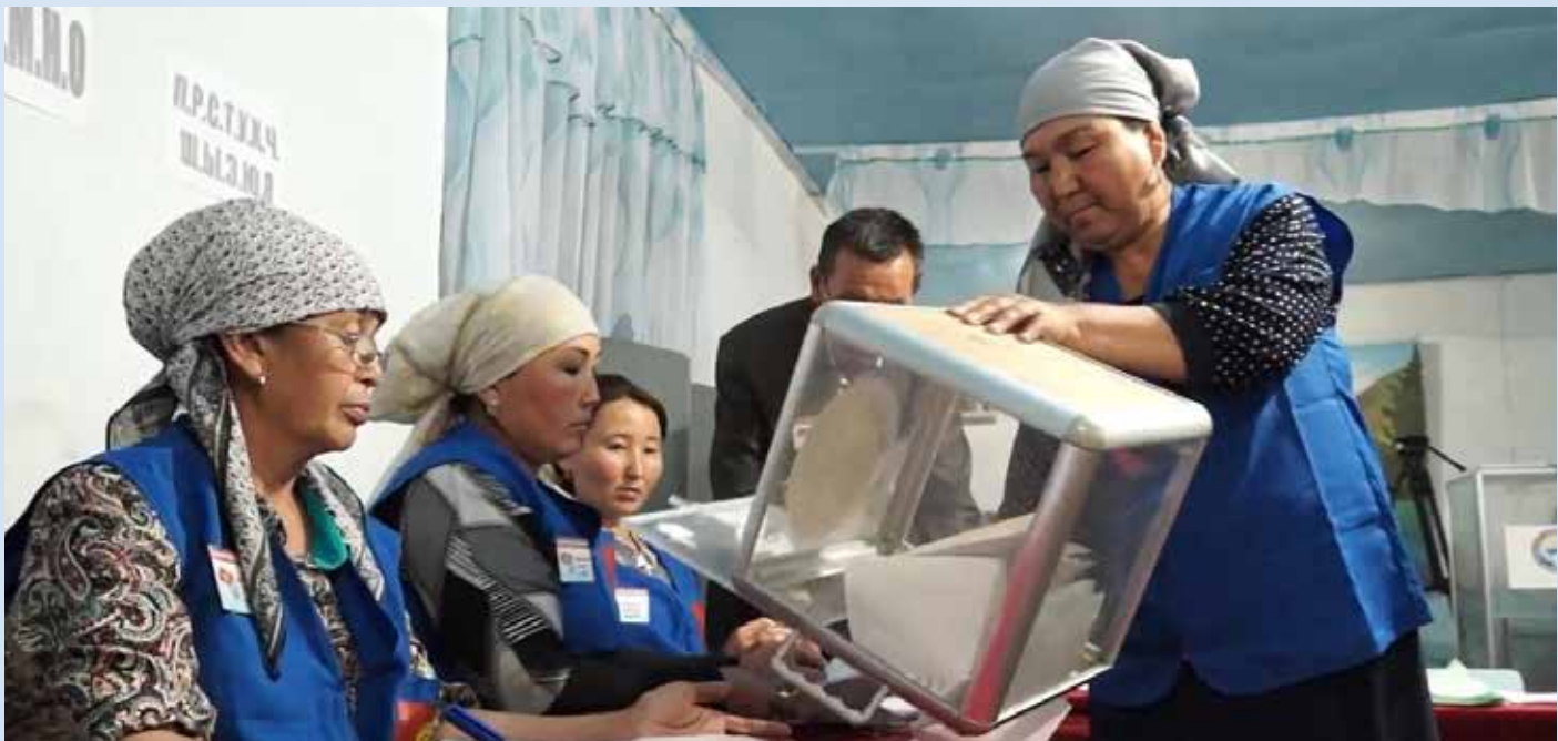
In Kyrgyzstan, UNDP helped introduce modern information-communication electoral technologies to conduct successful elections.