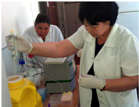
Laboratory assistants during the training

This training included theoretical and practical modules and promoted the availability and quality of prevention, treatment, detection and care services for people living with HIV (PLH).