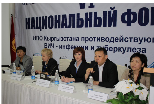
Expert the staff of Government Kyrgyz Republic during his welcoming speech to the forum participants

The participants discussed the problems in the work of NGOs and the need for inter-sectoral collaboration and cooperation between the government and the public sector for improvement of the efficiency of joint efforts related to the epidemic of HIV and tuberculosis.