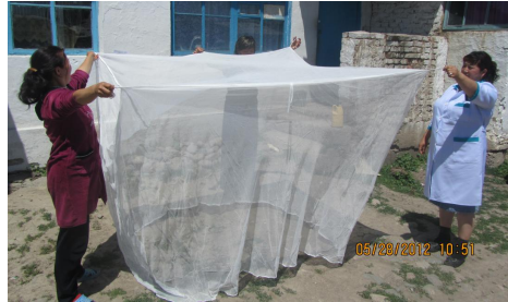
Handed out curtains

In order to establish the reliability/verification of source data in the distribution of mosquito bed nets with the obligatory visit to the sampled households, an expert on monitoring and evaluation of the Grants Management Unit UNDP/GF together with specialists from the field of Karasu DDPE and the Ministry of Health regularly carry out monitoring visits to the project areas.