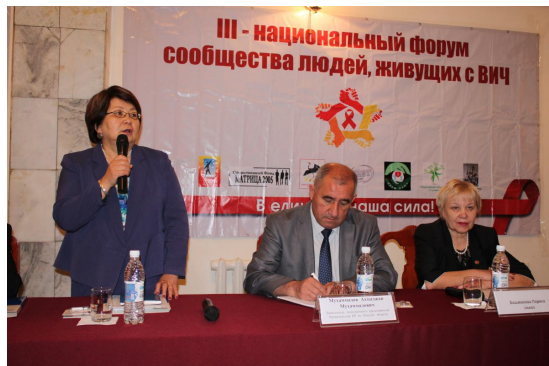
Roza Otunbaeva during welcoming speech

Speaking at the opening of the forum, Roza Otunbaeva, said: "I express my human sympathy to all those people who are infected with HIV and to those who are sick and suffering from this disease. Within the framework of my Fund I want to do everything possible that would raise the existing problems at the state and republic level, which would reduce the level of negative attitudes towards HIV-positive people, in order to have the public ready to accept and help our citizens in trouble."