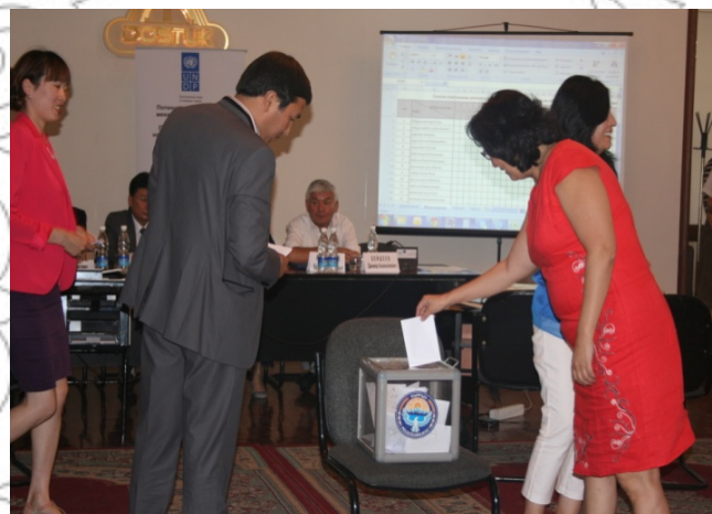
Participants in the competition for the membership in the Select commission for the public council members. Voting procedure.

The announcement on the election to the new composition of the Public Councils was published in “Erkin-Too” newspaper as well as uploaded on the official website of the Government.