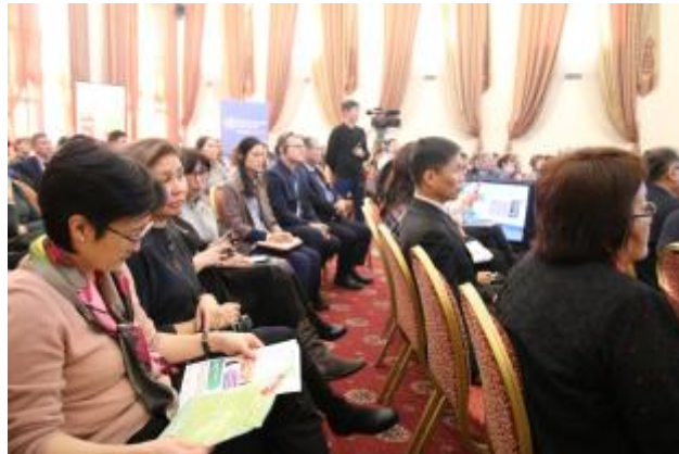
6 - International and national partners celebrate UHC Day