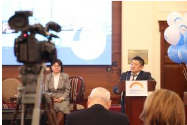
5 - The Minister of Health Kosmosbek Cholponbayev opens the ceremony