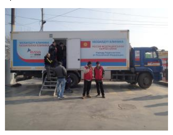
2 - HIV testing on Alamedin market, Bishkek.

In November, the Republican AIDS Center together with the UNDP and other partners conducted a free and rapid HIV testing campaign in Bishkek, Tokmok, Osh and Kara-Suu. As a result, 1,365 people were tested and 4 of them had a positive result.