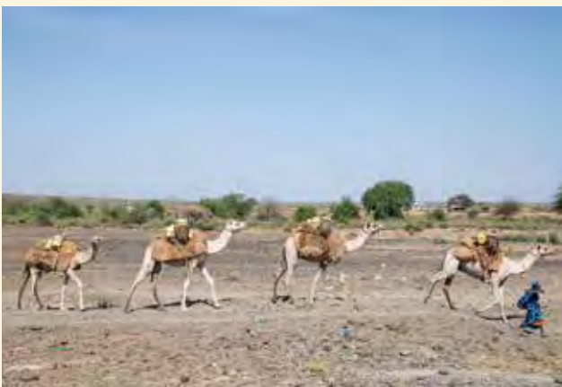
UNDP Amkeni Wakenya CSO Facility: Spotlight on ALCHA PLEAD Project, Marsabit

Moyale Town is as bustling and lively as you'd expect a border town to be: split across both Kenya and Ethiopia, there are clear influences on either side of the town from each country, from the foliage to the food and the language to the locals. The northernmost point of Marsabit County has recently seen a boon in fortunes following the completion of the Isiolo-Moyale Highway in 2017 and strengthened Kenya-Ethiopia integration: what was once a troubled frontier town is becoming a focal point in the rising tide of East African trade.