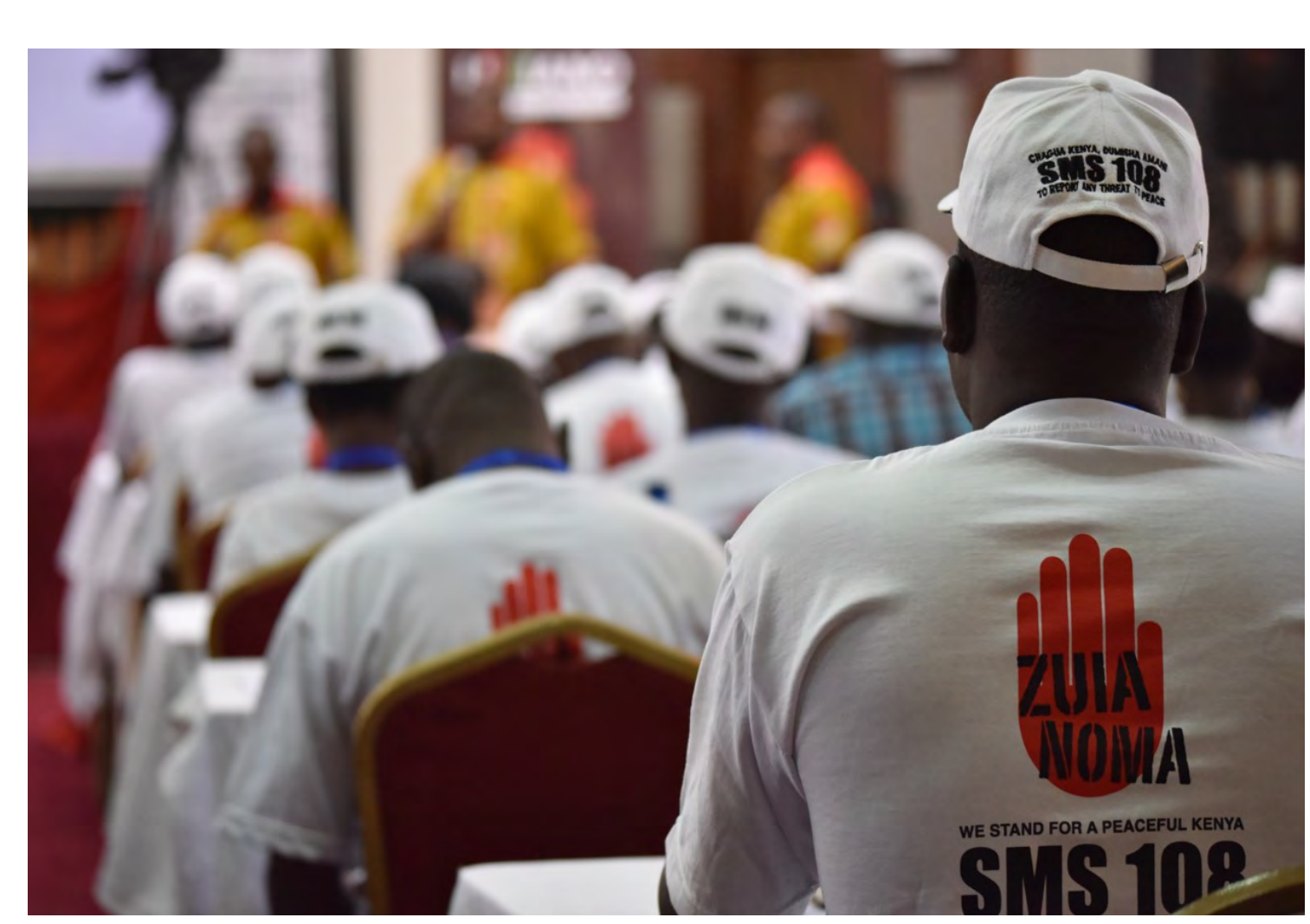
UNVs join other peace monitors as part of UN support towards peaceful elections in Kenya