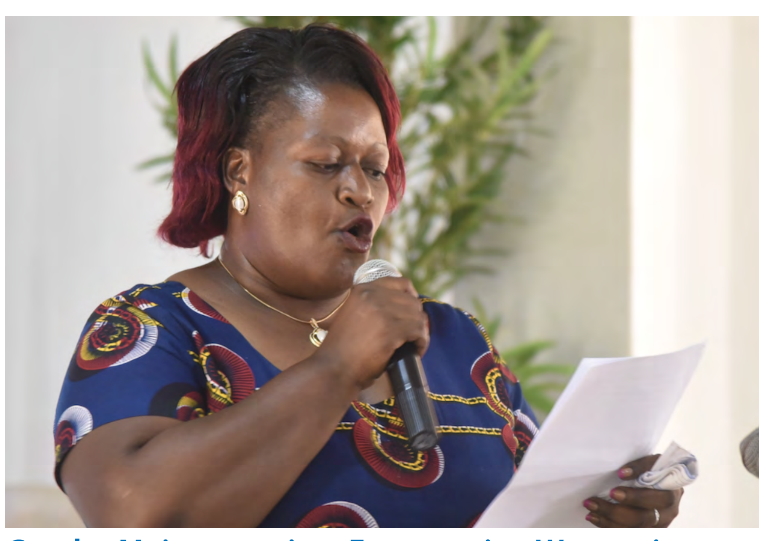
Gender Mainstreaming: Empowering Women in Vihiga County