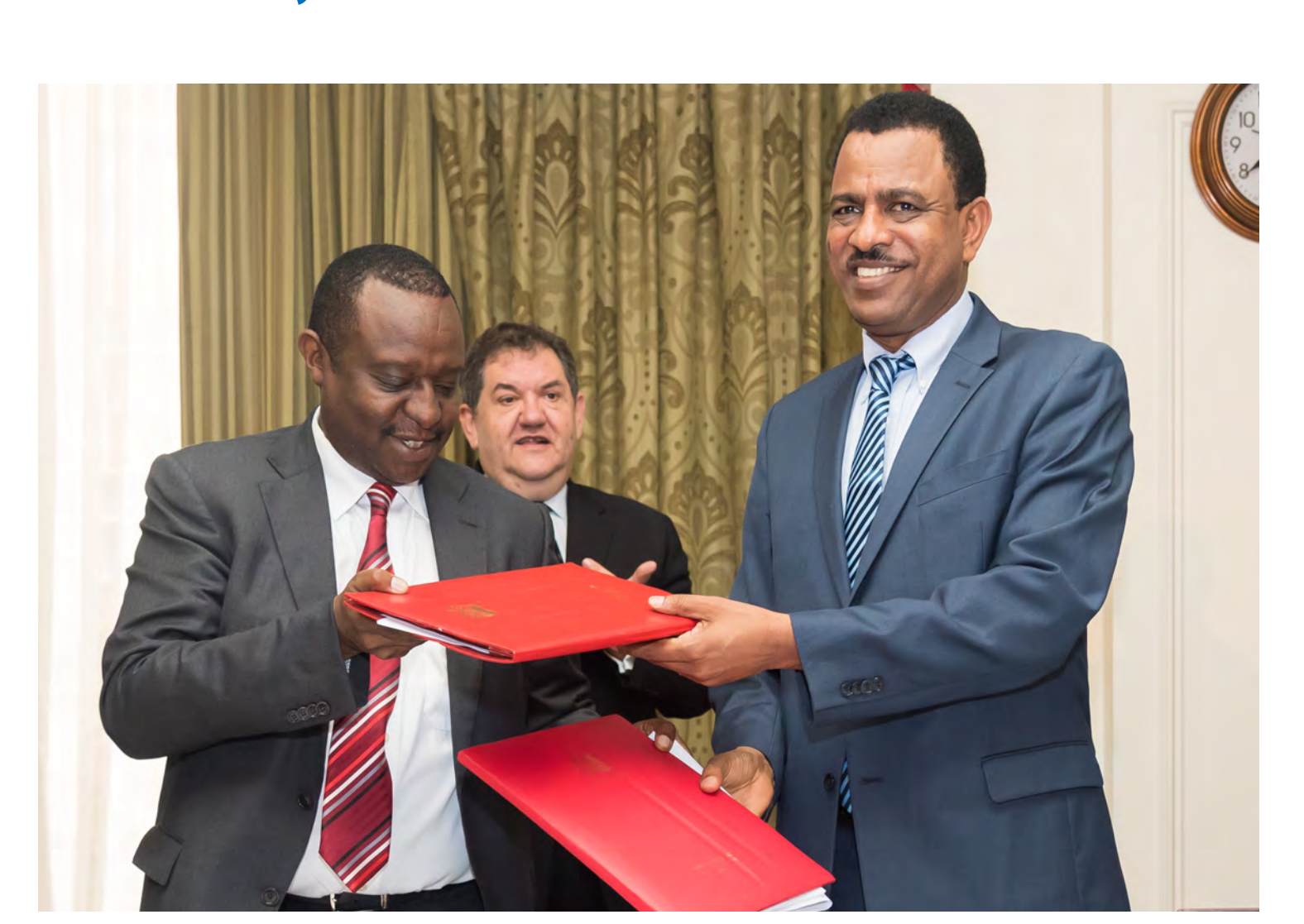
The Government of Kenya signs two key agreements that will help promote peace and development