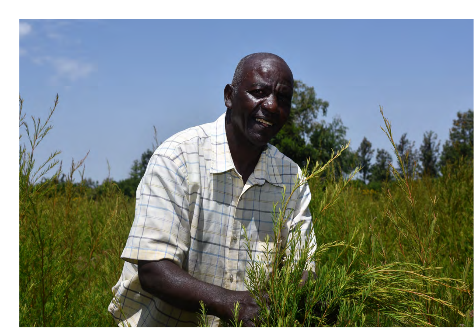
Tea Tree Farming Mitigating Impact of Drought in central Kenya