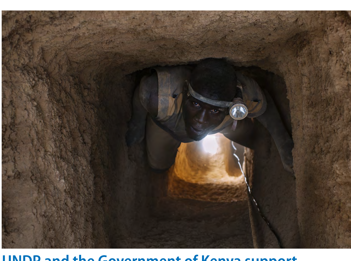
UNDP and the Government of Kenya support sustainable livelihoods in the artisanal and small-scale gold mining sector by eliminating mercury