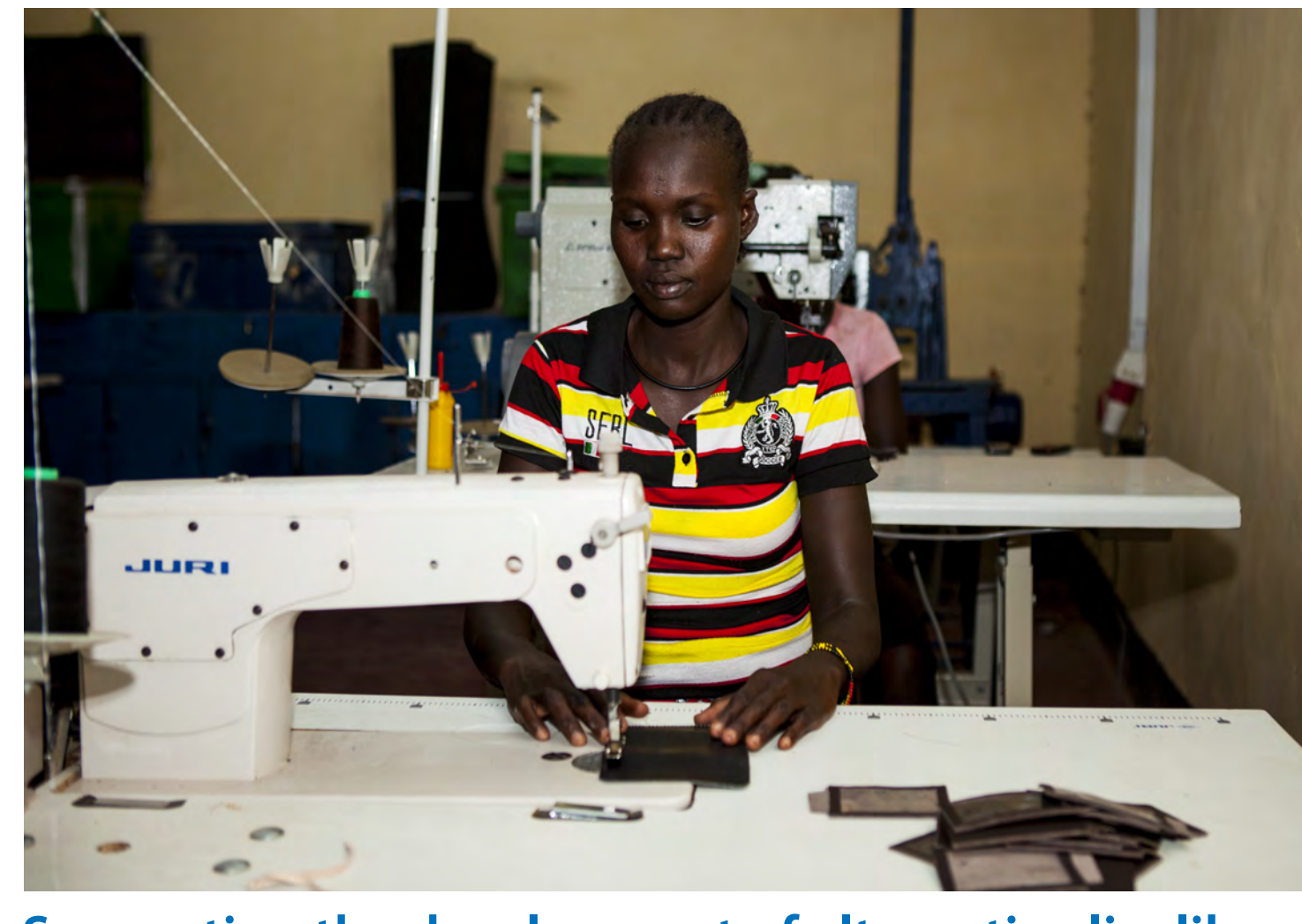
Supporting the development of alternative livelihoods for pastoralists communities in Turkana County