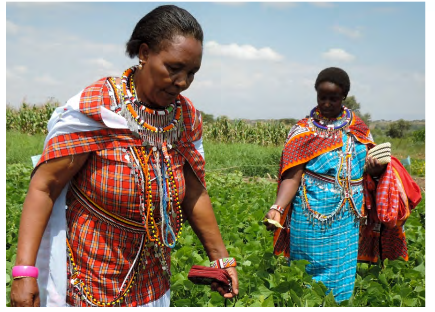
Sustainable Land Management boosts sustainable livelihoods in Arid Lands