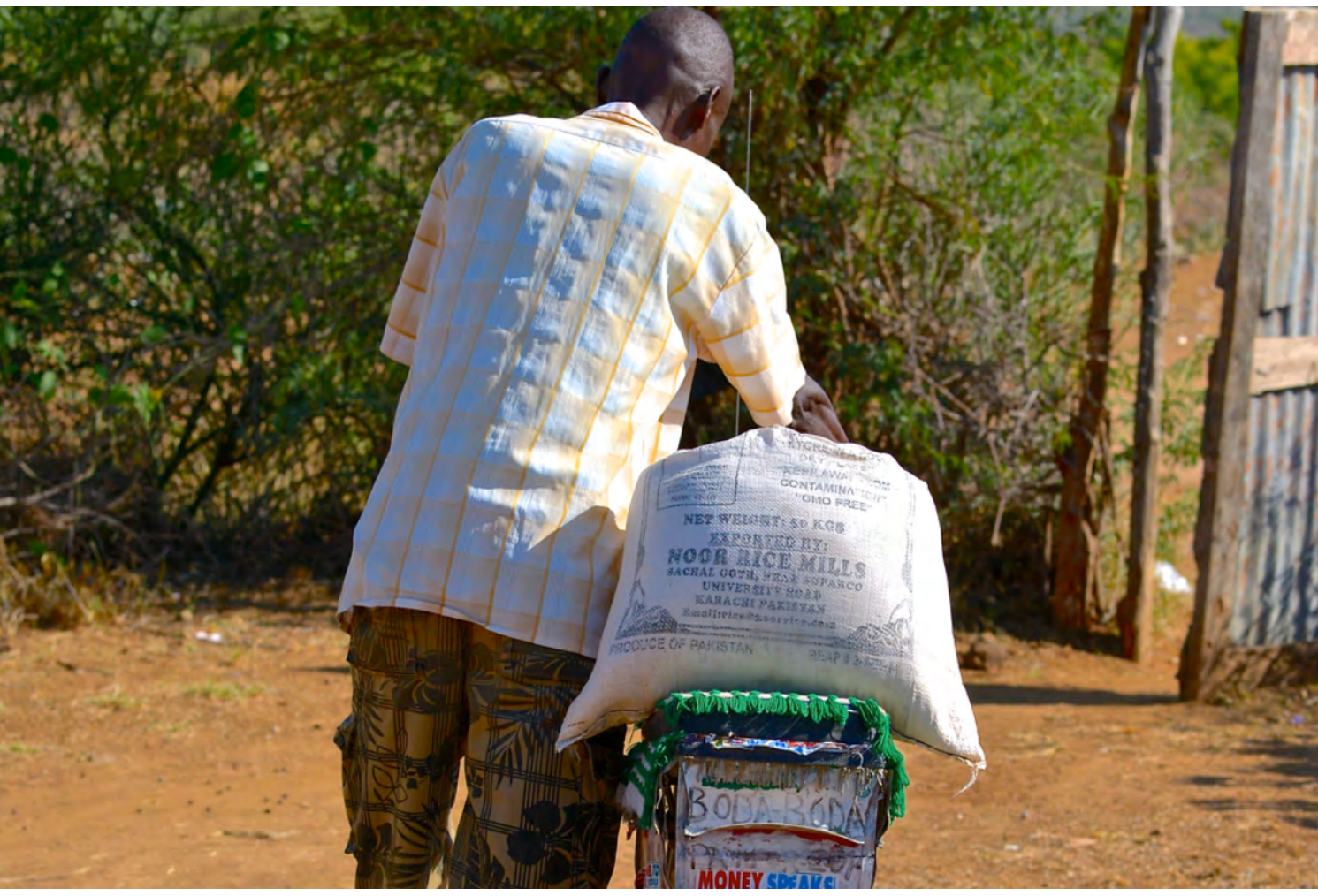
Turning flour into profits: Making business opportunities work for communities