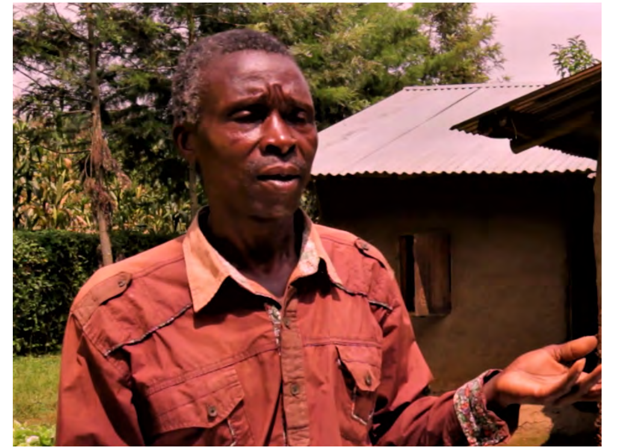
UNDP Kenya aligns programmatic work to the SDGs in supporting communities to achieve sustainable development