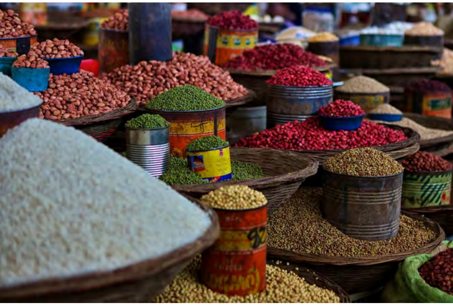
Performance Management System Improves Service Delivery in Kisumu County