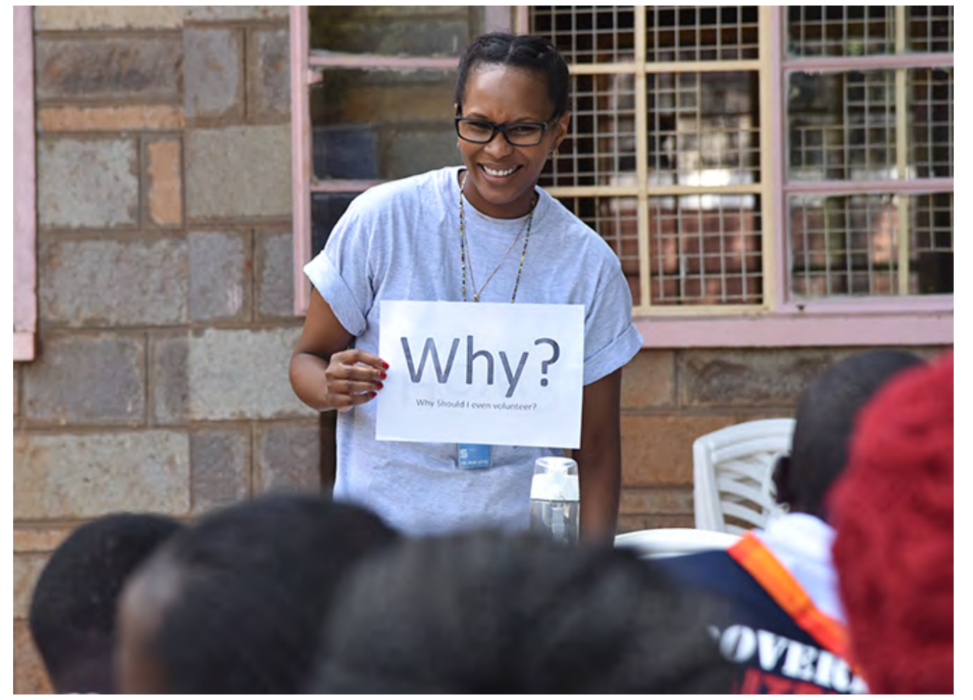
UN Volunteers Kenya engage with Scouts Leaders on peace and development