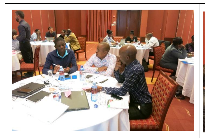
Participants identifying stakeholders involved in different stages of the mining cycle.