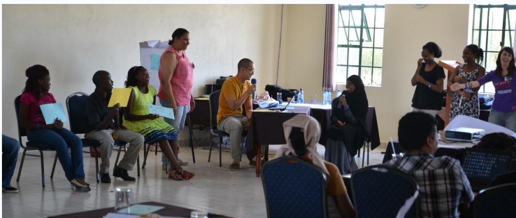
UN Volunteers demonstrate a skit during the peer to peer learning session.

was “ Vision, Voice, and Volunteerism ”, reflecting the following: Vision – Inclusive Participation in Peace and Development; Voice – Knowledge Sharing and Networking; Volunteerism – Voluntary Service to Nations and Communities.