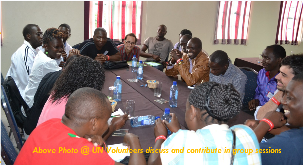
Above Photo @ UN Volunteers discuss and contribute in group sessions