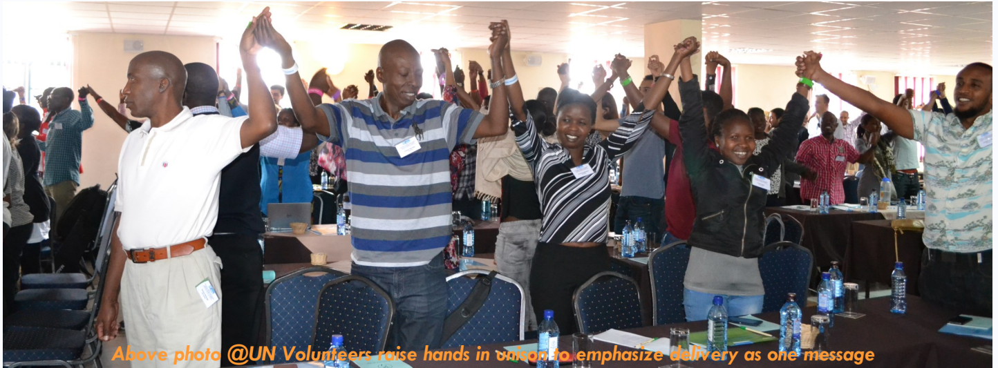
Volunteers raise hands in unison to emphasize delivery as one message