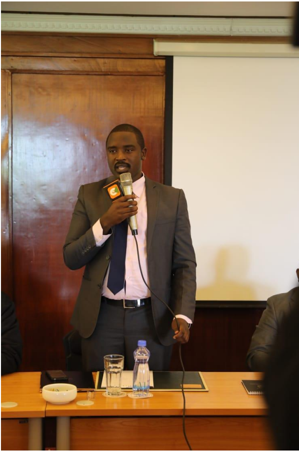
Figure 4: Mr. Abraham Barsosio - Elgeyo Marakwet County Executive Member Environment Water and Natural Resources