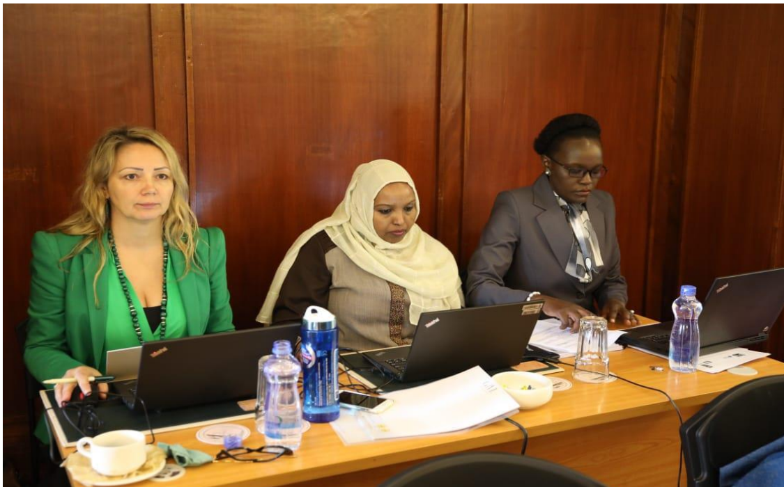
Figure 8: UNDP Team