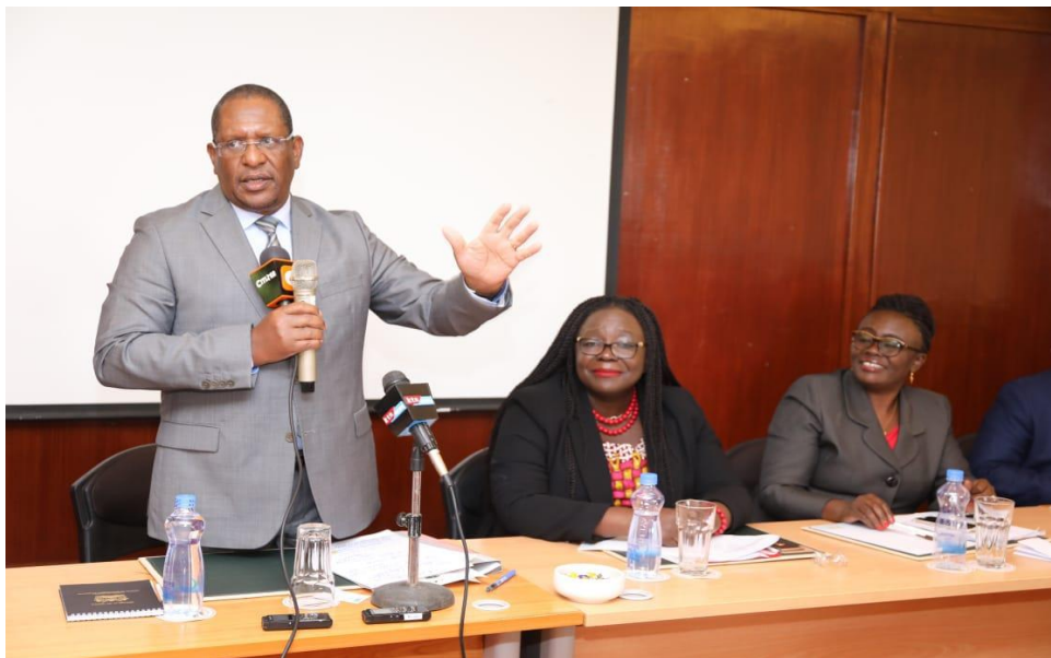
Figure 1: Hon Keriako Tobiko - Cabinet Secretary Ministry of Environment and Forestry addressing the Inception Meeting