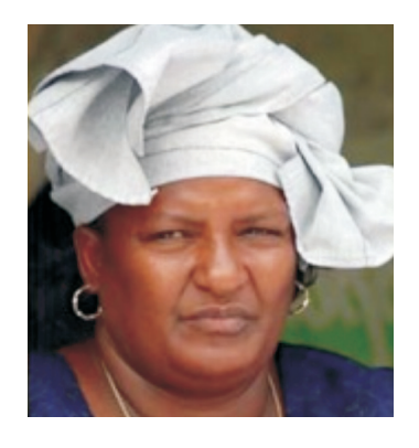
Hon. Dr. Naomi Shaban

Hon. Dr. Naomi Shaban, is the Member of Parliament for Taveta constituency and was first elected to Parliament in 2002. Hon. Shaban is current Minister for Gender,