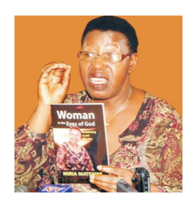
Hon. Dr. Miria Matembe

Hon. Dr. Miria Matembe is former Ugandan Minister of Ethics and Integrity (1998-2003). She is a former member of the Pan-African Parliament from Uganda, where she