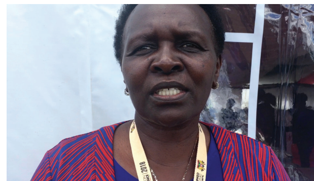
Accountability and transparency are key ingredients to the successful implementation of devolution