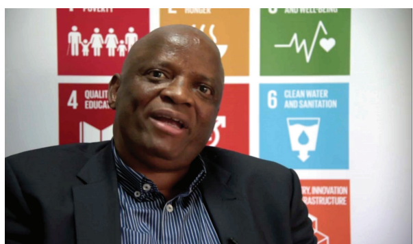
Successful implementation of the SDGs requires strategic coordination and commitment of all stakeholders