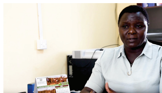
How performance management contracting will enhance service delivery in Turkana County