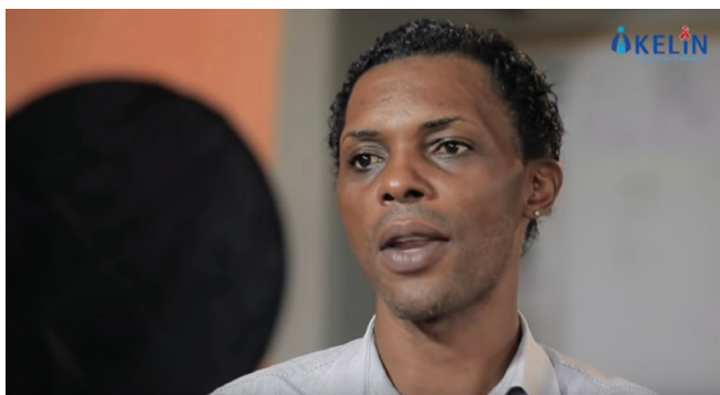
Enhancing legal environment for effective HIV response in Kenya