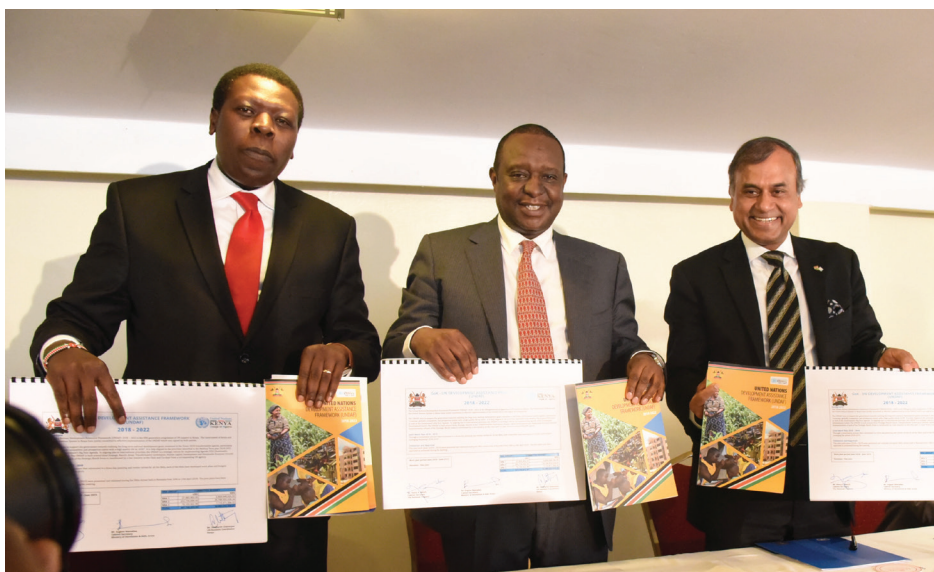
The Government of Kenya and the UN agree on the next phase of the UN Development Assistance Framework (UNDAF) 2018-2022