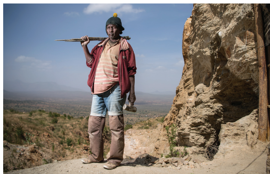
Strengthening environmental governance within the extractives sector is key to reaping optimal benefits