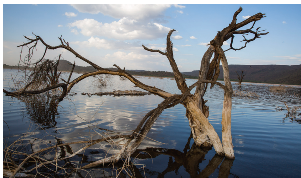
Development photography, a key element to effective communication of development results and impact