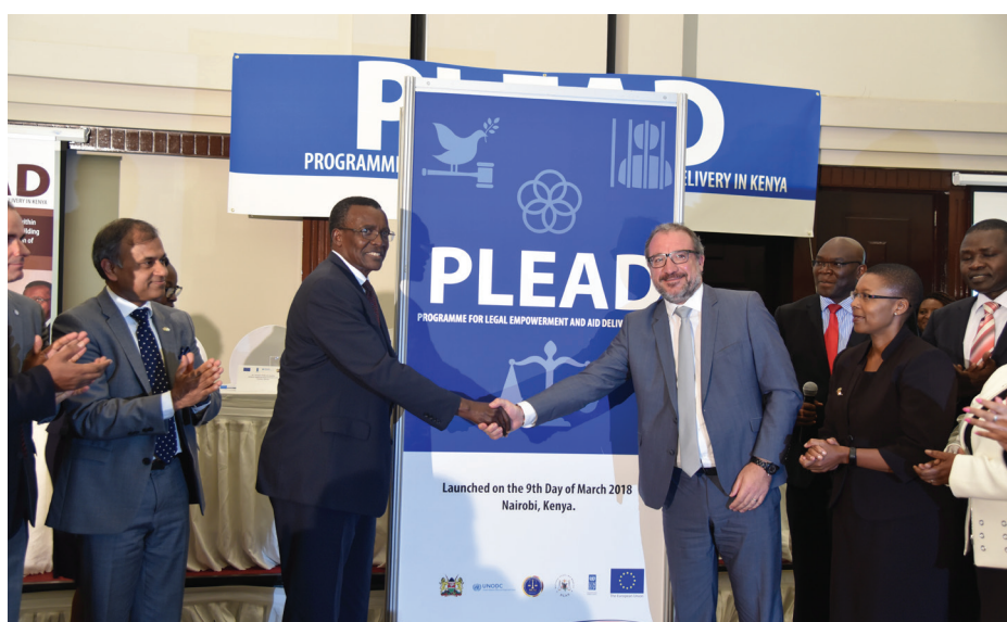
The European Union, Kenya Judiciary and United Nations launch a Legal Empowerment and Aid Delivery programme