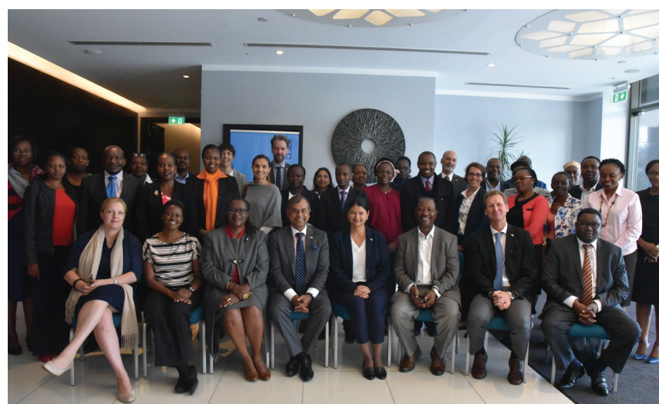
The Nordic Annual Review: Strengthening cooperation for development