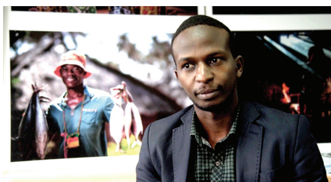
Investing in hazard mapping can support risk reduction and disaster management