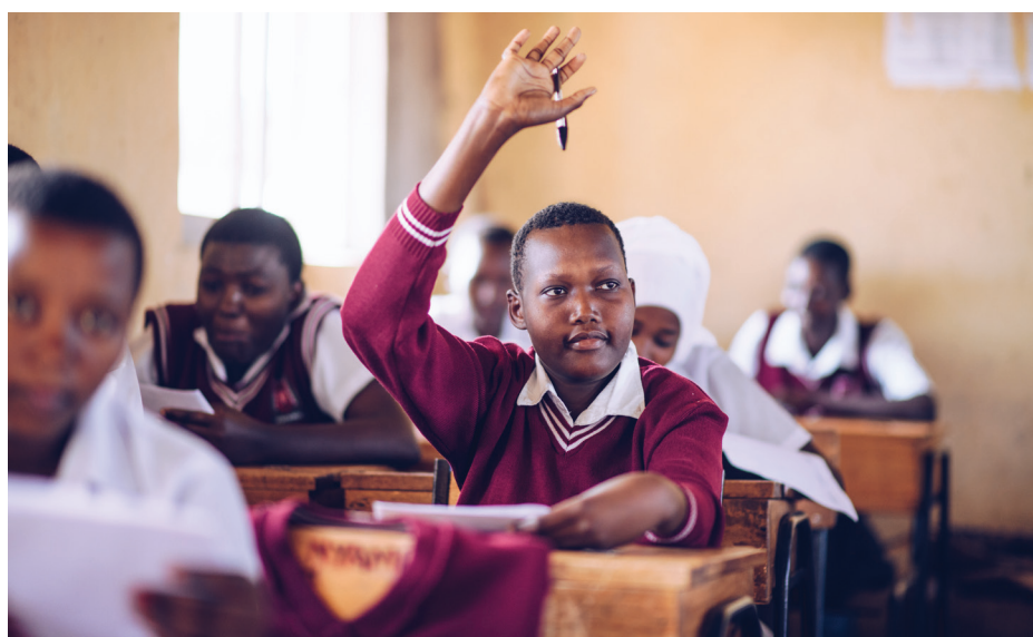
UNDP Kenya's blueprint for the next five years approved by the Executive Board

* Click on the titles to read the full stories