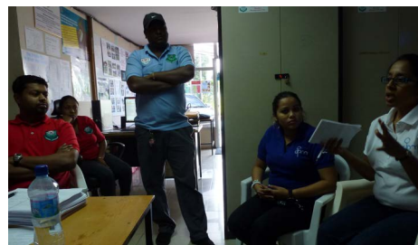
Interviews being conducted during the monitoring site visit in Trinidad & Tobago.