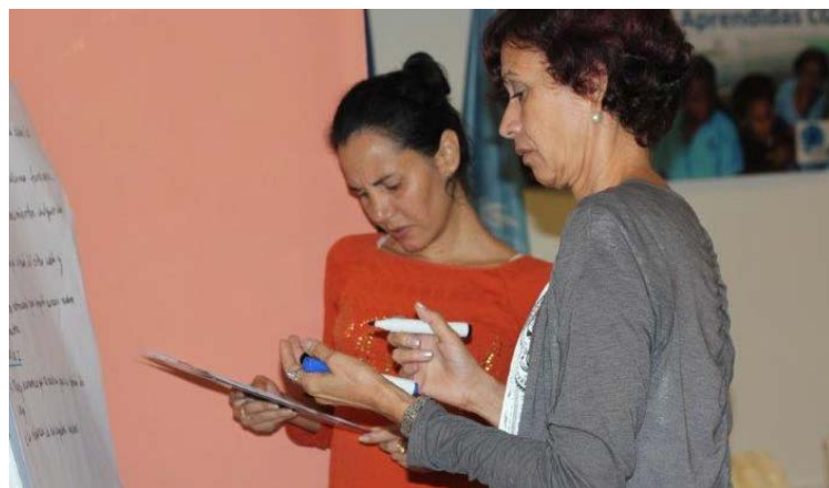
Participants during the Lessons Learned Workshop in La Habana.