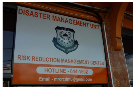
RRMC signage was installed in Trinidad & Tobago.

During the last 6 months, Trinidad & Tobago made overall improvements in the RRMC and the Early Warning Points (EWP) in terms of staffing, infrastructure/equipment, signage, and conducted post pilot trainings and an additional drill exercise in Mayaro Rio Claro Regional Corporation. The EWPs/RRMC communities are still actively engaged and next activities have been planned, including capacity building and disaster preparedness training, among others.