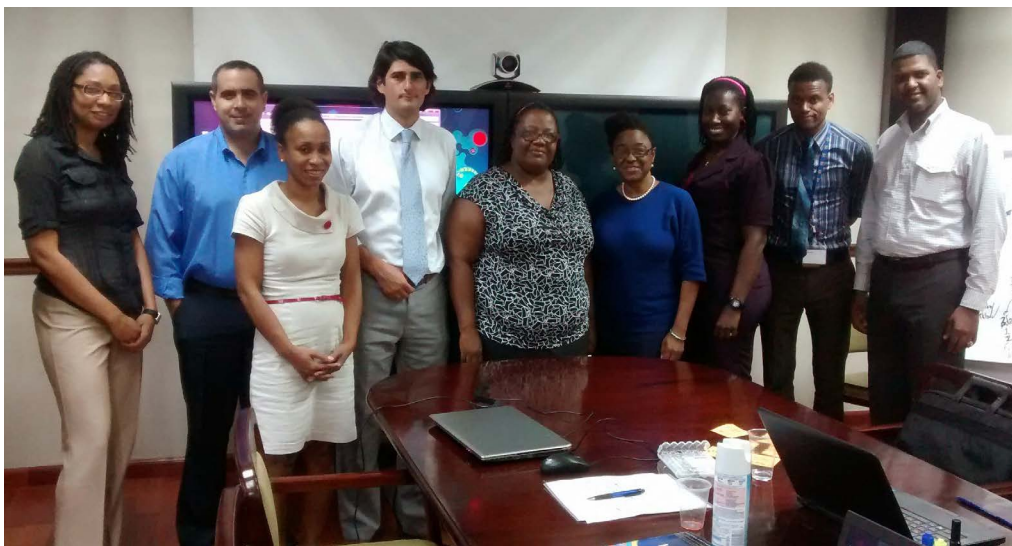
Participants during the PGTF planning meeting held on Kingston.