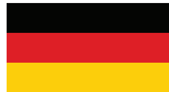
The Government of Germany

UNDP is the leading United Nations organization fighting to end the injustice of poverty, inequality, and climate change. Working with our broad network of experts and partners in 170 countries, we help nations to build integrated, lasting solutions for people and planet.