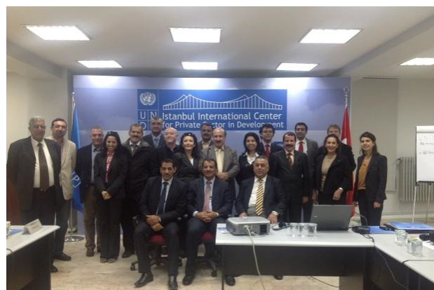
Iraq UNGC Network and IICPSD team at the workshop on CSR, Istanbul November 2012