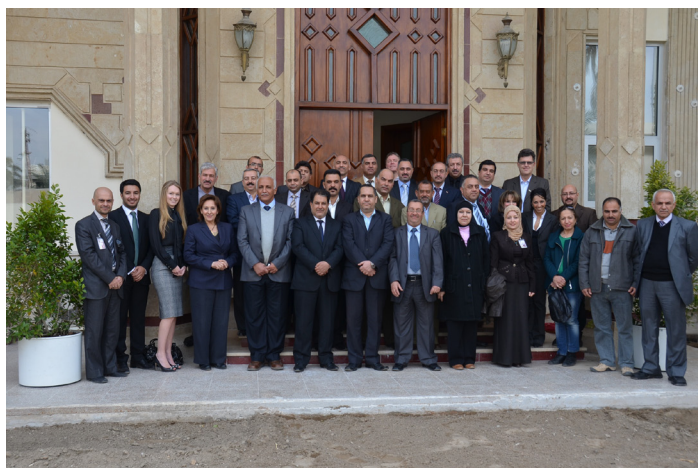
Workshop on CSR and exchange with Swedish companies, Embassy of Sweden – Baghdad, February 2012

The two workshops, held on 13 and 15 February at the Swedish embassy in Baghdad, focused on the sectors of industrial service and transportation, with interventions and experiences shared by experts from Swedish organizations and leader companies in these sectors (i.e. Volvo Trucks, Scania, and Sandvik) who presented some CSR practices that have been applied to their companies.