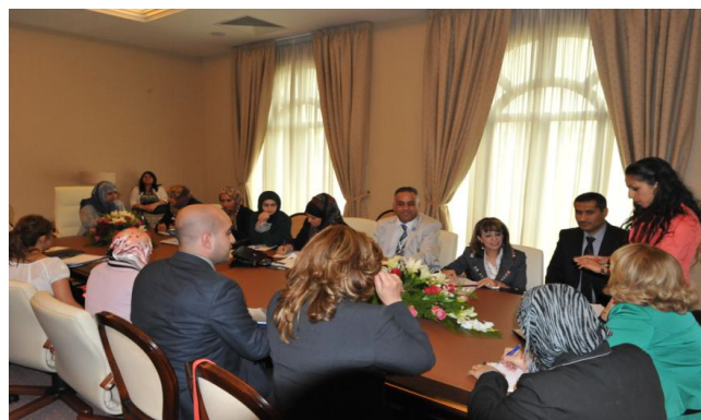
Conference on Women Economic Empowerment and working group discussions, Baghdad - October 2012