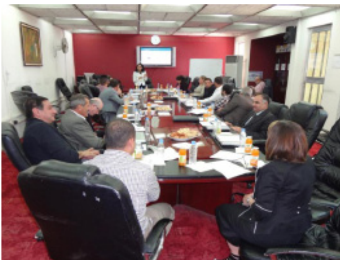
Training on COP for Iraq UNGC Network members, COMSEC Baghdad - October 2012

also to promote translation into practice of the UNGC principles. Delay in submitting the COP upon the yearly deadline results in downgrading the status of members to 'non active' and can be eventually delisted. Iraqi members attended the webinars offered by the UNGC on COP preparation and the workshop in Baghdad was the first 'in-person' activity to build capacity of Iraqi Network members to report on sustainable business practices and UNGC implementation.