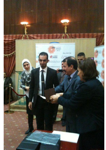
Awards ceremony for the Tamayouz Initiative, October 2012

Tamayouz is sponsored by Zaha Hadid Architects , Al-Dulaimi Business Group, Dewan Architects and Engineers, Iraqi Business Council in Jordan, The United Nation's Global Compact – Iraq, Ayad Al-Tuhafi Architects, Coventry University and Architecture For Humanity.