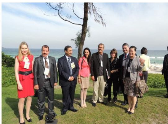
Iraq UNGC Network with other Local Networks and Iraqi Government at the Rio+20 Corporate Sustainability Forum, June 2012

The final text of the outcome document, 'OVERVIEW AND OUTCOMES: Innovation & Collaboration, Public Policy Recommendations, Commitments to Action', was presented to UN Secretary-General Ban Ki-moon during the Rio+20 summit. The can be downloaded at: http://www.unglobalcompact.org/docs/news_events/upcoming/RioCSF/RioCorpSustForum_Outcome_21June12.pdf