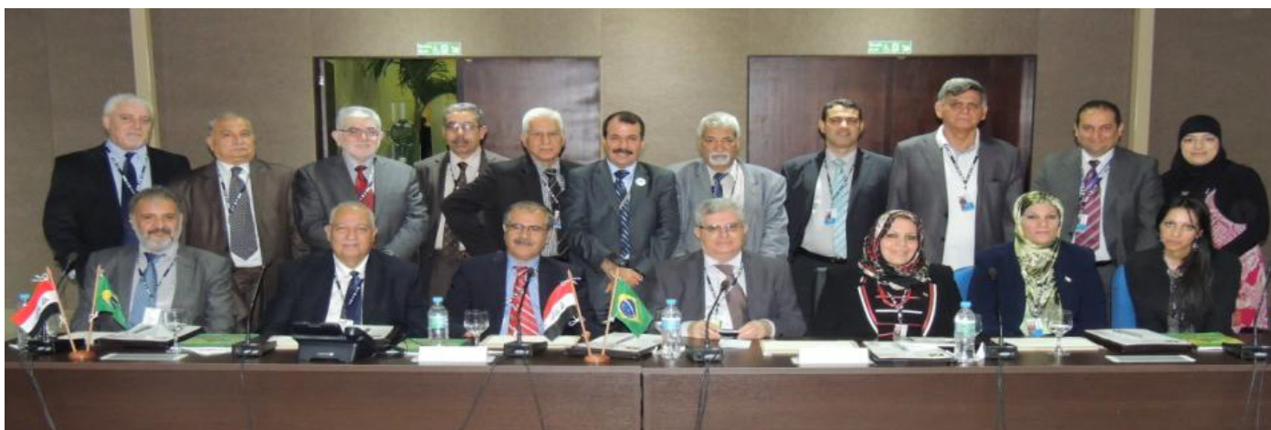
Iraq UNGC Network with other Local Networks and Iraqi Government at the Rio+20 Corporate Sustainability Forum, June 2012

Among the decisions taken at the 15-18 June Forum: