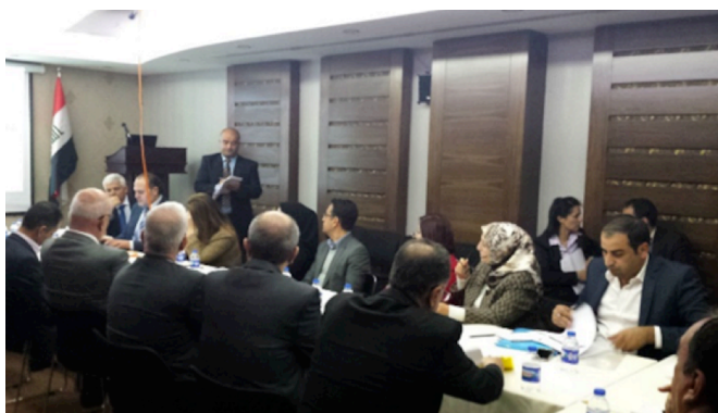
Thematic workshop for the preparation of Erbil's Provincial Development Strategy.

The aim of the Local Area Development Programme (LADP) is to promote sustainable and inclusive social and economic development at the subnational level. Phase II of the programme was initiated by the end of 2012 with a contribution from the Swedish International Development Agency (SIDA), followed by a financial contribution from the Kurdistan Regional Government (KRG). LADP II promotes inclusive and participatory planning, budgeting and implementation practices to advocate the prioritization of development programmes, and provides focused technical assistance to the Governorates to improve essential service delivery.