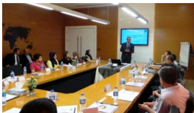
LADP II workshop on strategic planning, Erbil.

Present in Iraq since 1976, the United Nations Development Programme (UNDP) is committed to supporting the Government and people of Iraq during their transition towards reconciliation, reform and stability. UNDP's support ranges from promoting emergency livelihoods and community dialogue in districts impacted by the crisis, to prevention of sexual and gender-based violence (SGBV) amongst Syrian refugees and internally displaced people (IDPs), to helping stabilize newly liberated areas through its Funding Facility for Immediate Stabilization (FFIS). Further support includes inclusive area-based planning, governance reforms, decentralization, rule of law, and environment and climate change.