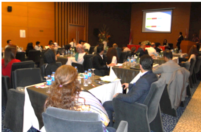
Team planning workshop on KRG Capital Investment Budget, Erbil.

In 2008, UNDP signed a long-term agreement with the Kurdistan Regional Government (KRG) for Budget Execution Support (BES). Running through 2016, the project contributes to KRG's efforts to develop more effective, accountable and transparent public financial management. BES has laid the foundations to accelerate stabilization, reconstruction and development in the Kurdistan Region of Iraq (KR-I).