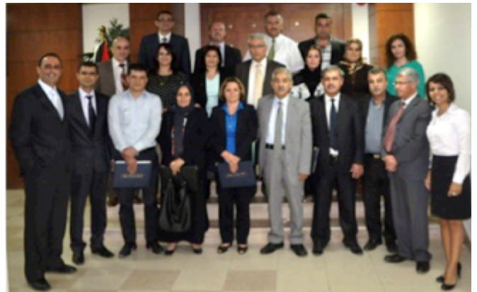
Awareness session on public finance held in Amman.

Present in Iraq since 1976, the United Nations Development Programme (UNDP) is committed to supporting the Government and people of Iraq during their transition towards reconciliation, reform and stability. UNDP's support ranges from promoting emergency livelihoods and community dialogue in districts impacted by the crisis, to prevention of sexual and gender-based violence (SGBV) amongst Syrian refugees and internally displaced people (IDPs), to helping stabilize newly liberated areas through its Funding Facility for Immediate Stabilization (FFIS). Further support includes inclusive area-based planning, governance reforms, decentralization, rule of law, and environment and climate change.