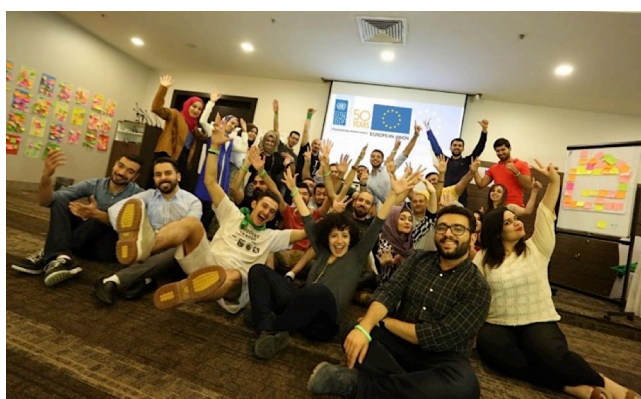
Volunteers from different governorates trained to support the Initiative, Erbil.

UNDP started the Initiative in 2015, as a pilot project, in partnership with Zain Telecommunication Company, in order to promote business and social entrepreneurship, through methods such as Design Thinking and the Business Model Canvas, in addition to volunteerism amongst young people in Iraq.