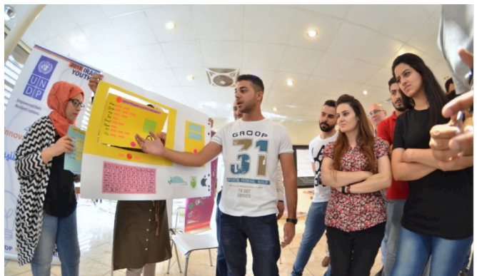
Workshop on innovation in Baghdad.

Present in Iraq since 1976, the United Nations Development Programme (UNDP) is committed to supporting the Government and people of Iraq during their transition towards reconciliation, reform and stability. UNDP's support ranges from promoting emergency livelihoods and community dialogue in districts impacted by the crisis, to prevention of sexual and gender-based violence (SGBV) amongst Syrian refugees and internally displaced people (IDPs), to helping stabilize newly liberated areas through its Funding Facility for Immediate Stabilization (FFIS). Further support includes inclusive area-based planning, governance reforms, decentralization, rule of law, and environment and climate change.