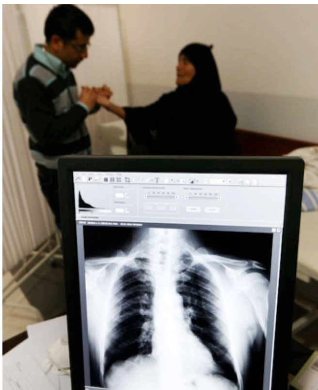
TB suspected patient in Erbil Respiratory and Chest Diagnostic Centre.

Based on the latest epidemiological situation, Iraq ranks 108 out of 213 countries and territories by the estimated number of Tuberculosis (TB) cases, and is considered amongst 8 high TB burden countries in the Eastern Mediterranean Region (EMR). The Government of Iraq considers TB a major public health problem. In January 2008, the United Nations Development Programme (UNDP) in Iraq was selected as the Principle Recipient to implement the Global Fund to fight AIDS, Tuberculosis and Malaria (GFATM). TB grants have been approved under two funding rounds; and UNDP has been supporting the Ministry of Health and Environment through the National Tuberculosis Program (NTP).