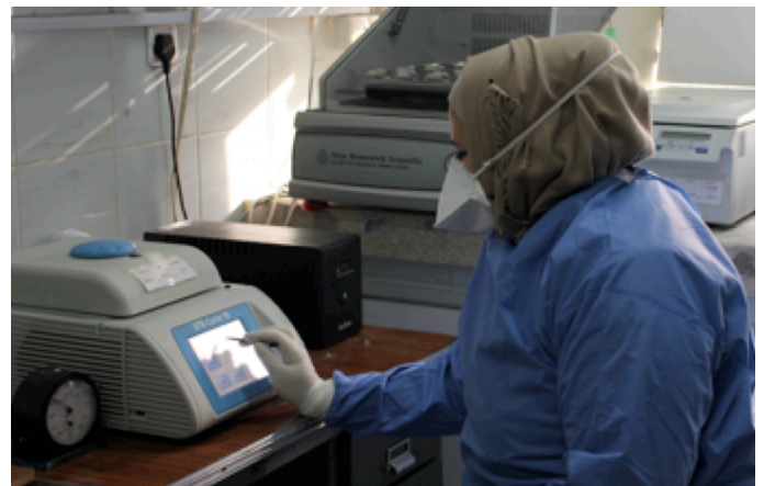
Introducing new diagnostic technologies, LPA, in the National Reference Lab in Baghdad.

Present in Iraq since 1976, the United Nations Development Programme (UNDP) is committed to supporting the Government and people of Iraq during their transition towards reconciliation, reform and stability. UNDP's support ranges from promoting emergency livelihoods and community dialogue in districts impacted by the crisis, to prevention of sexual and gender-based violence (SGBV) amongst Syrian refugees and internally displaced people (IDPs), to helping stabilize newly liberated areas through its Funding Facility for Immediate Stabilization (FFIS). Further support includes inclusive area-based planning, governance reforms, decentralization, rule of law, and environment and climate change.