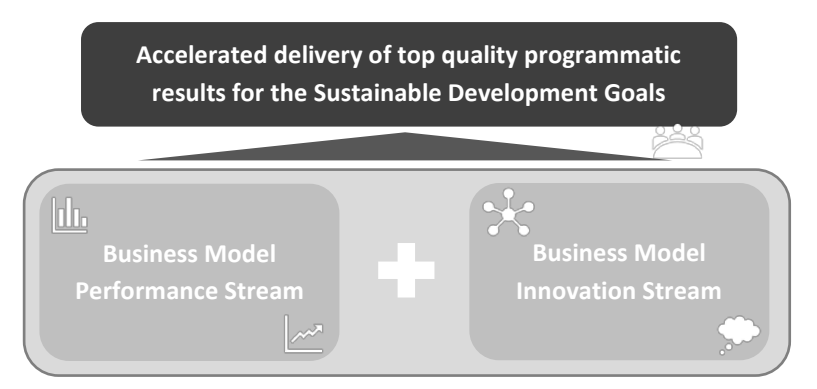
Figure 2. Accelerated delivery of top-quality programmatic results for the Sustainable Development Goals

66. UNDP country offices are the programmatic and operational backbone of the organization and will be central to the two streams of work, as well as key beneficiaries of the outcomes. The improved business model will empower country offices to deliver the services requested of them within their diverse operating contexts, in a manner that is financially sustainable.