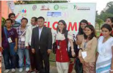
Some of the Youth delegates