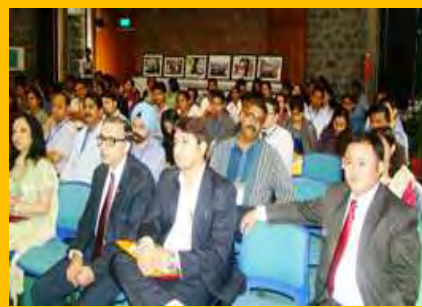
Some of the participants