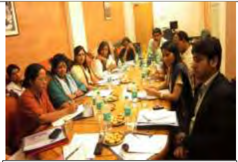
Committee members in discussion

The aim of the seminar was to sensitize all stakeholders, including young people themselves, about their role in fostering an environment of dialogue, understanding and a spirit of volunteerism; create an enabling environment for young people to address their issues, needs and concerns; and involving young people for meaningful engagement in decision making and the nation building process. The participants included policy makers, non-governmental organizations working for young people, and active youth leaders from Brunei, India, Maldives, Malaysia and Singapore.