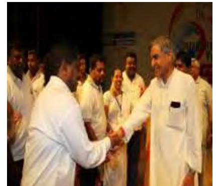
Union Cabinet Minister Pawan Kumar Bansal