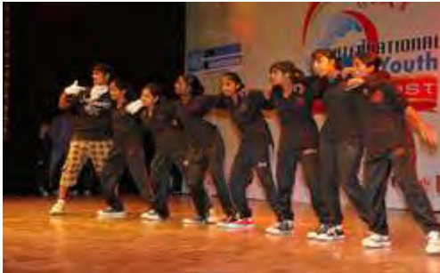
Performance by Delegates