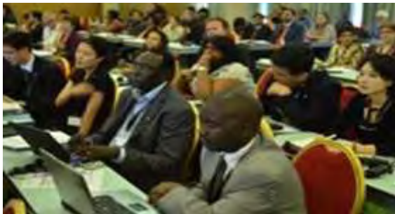
The Global Volunteering Conference in Budapest drew delegates from 80 countries.

Budapest, Hungary: The high-level Global Volunteering Conference under the tenth anniversary of the International Year of Volunteers brought together volunteering leaders from across the world.