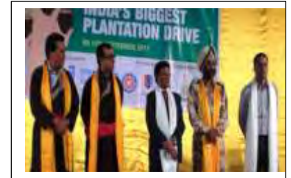
(Second from left) Mr. Ajay Maken, Hon'ble Minister of Youth Affairs & Sports

UNDP and UNV are lending support to the ‘My Earth My Duty’, environmental awareness campaign launched by Zee News.