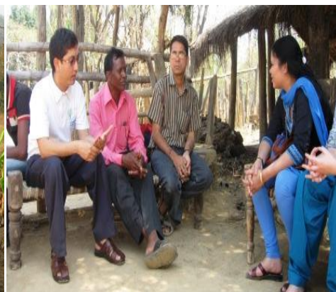
UNVPO in discussion with a Sarpanch at Korba