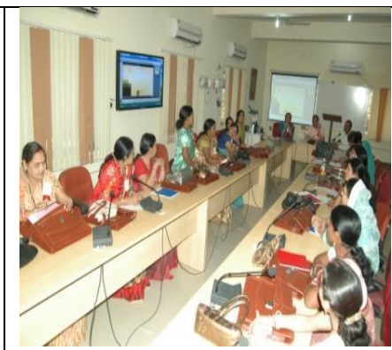
Elected Women Representatives discussing the importance of EWR Network