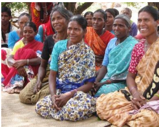
Interaction with a women Self-Help Group