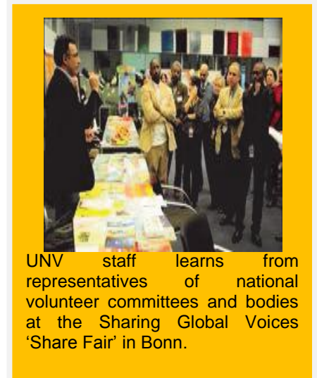
UNV staff learns from representatives of national volunteer committees and bodies at the Sharing Global Voices 'Share Fair' in Bonn.