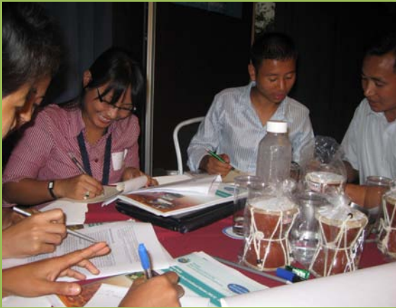
Preparing for Group Work & presentation