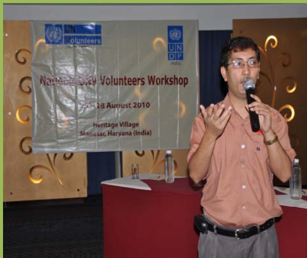
UNV India Programme Officer welcoming the participants to the workshop