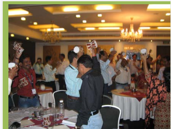
UNV Volunteers participating in a symbolic gesture for “Make a Noise” Campaign

The participants were apprised of Global Campaign against Poverty – part of the UNMC to achieve MDGs - to be held during 17-19 th September 2010. The year 2010 marks the completion of 10 years of the MDGs, with only five years more to go to meet the targets set during the Millennium Declaration in 2000. The “STAND UP and TAKE ACTION (SUTA) and “MAKE a NOISE” events during the Campaign are opportunities to reinvigorate the momentum to ensure that poverty reduction and MDGs remain a priority. The UNV volunteers were requested to organize events in their respective areas and contribute to the MDG campaign. It was an interesting and motivating sight when UNV volunteers beat small drums given to them as a pre-cursor to the Campaign to be soon held.