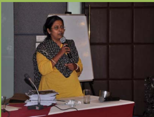
Vote of Thanks

A quiz on UNV and UNDP was conducted for the participants which was both informative and enjoyable. The participants were divided into various groups and participated enthusiastically in the quiz.