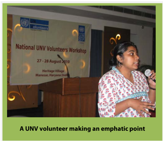
A UNV volunteer making an emphatic point