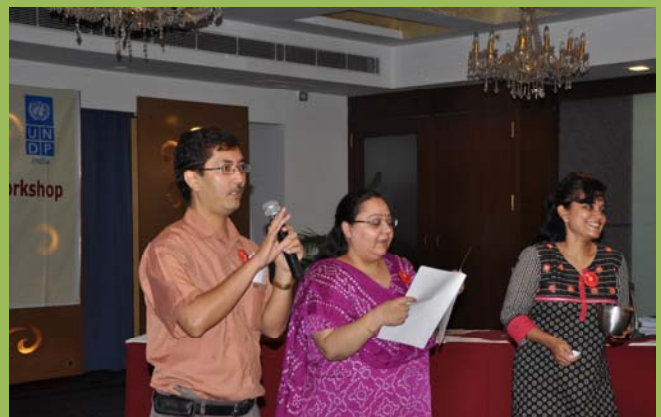
A light moment during the quiz