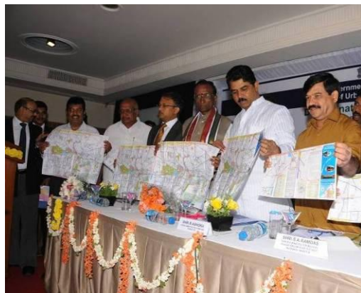
Mysore city route map being released

also convinced that KSRTC will effectively implement ITS programme and the city will benefit by way of a more punctual and efficient public bus service.