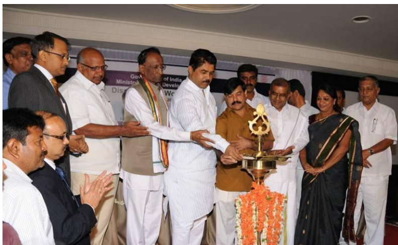
Lighting of lamp by dignitaries

The participants comprised citizens of Mysore City, NGOs & Associations, Media, Students, Public Representatives (Ministers, MLAs, Corporators etc.), Representatives of Mysore City Administration, KSRTC project stakeholders (Management, Drivers, Controllers, Conductors, Mechanics etc.), Representatives of Project Management Unit, Govt. of India, Govt. of Karnataka Representatives (KUIDFC, Dept. of Urban Development), Project Consultants, Project Implementation Agency etc.. The stakeholders were explained how they would benefit from the implementation of this project. The presentations were well received and highly applauded.