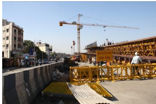
Nashik Phata, photo taken in Feb 2011