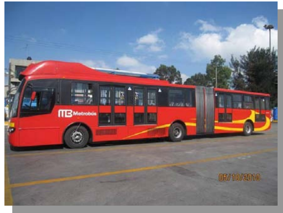
Metro Bus - Mexico

The delegates attended the International Congress on Sustainable Transport in Mexico City which was organized by CTS Mexico, which is a part of the EMBARQ network. The Congress is an annual event that brings together leading minds in academia, government and the private sector, with the purpose of exchanging knowledge on sustainable transport. Prof. Saugata Roy, Hon. Minister of State for Urban Development, Government of India, delivered a Key Note address at the Congress, where he spoke upon the initiatives made by the Central, State and Local Governments in India in spearheading the urban development of the country. Mr. Amit Bhatt, Senior Transportation Specialist with EMBARQ India participated in the Panel Discussion on Urban Transport Financing, where he shared the experience of Bus Operations under PPP format in Indore and also explained the details of financing of rolling stocks under JNNURM.