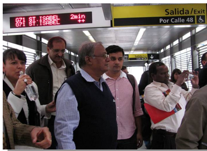
Prof. Saugata Roy, Union Minister leading the delegation

The tour management was supported by the World Bank through EMBARQ: The World Resources Institute (WRI) Centre for Sustainable Transport India (EMBARQ India).