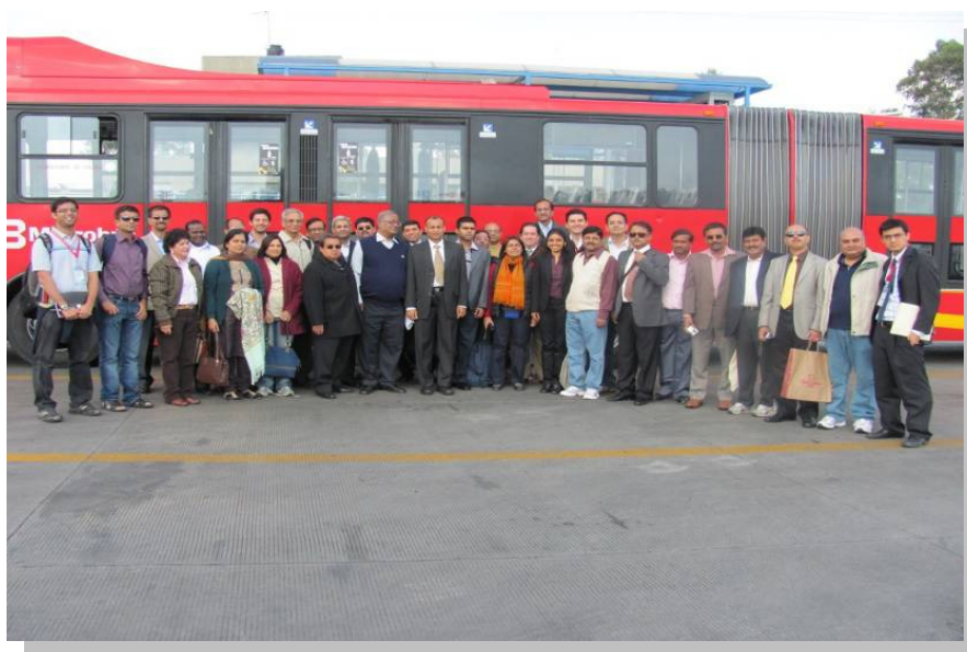
Group photo of the delegation at Bogota