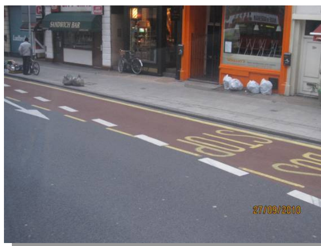
Red route – London

The delegates also rode on the London buses, where they were exposed to various