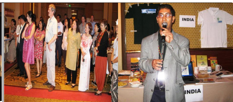
IYV+10 Action Plan and Presentations by participating countries