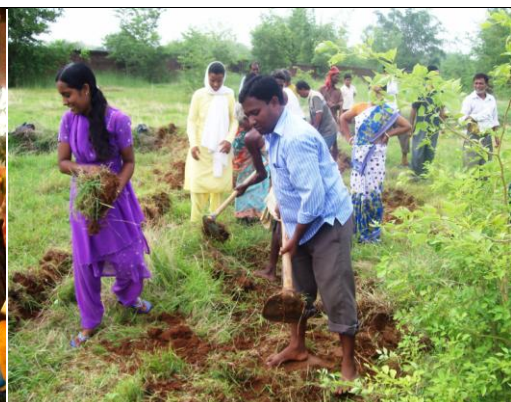
On 15 April 2011, 50 youth from villages in Deoghar district in Jharkhand, Eastern India, came together to build a waterway that would not allow scarce rainwater to runoff but collect in the village pond.